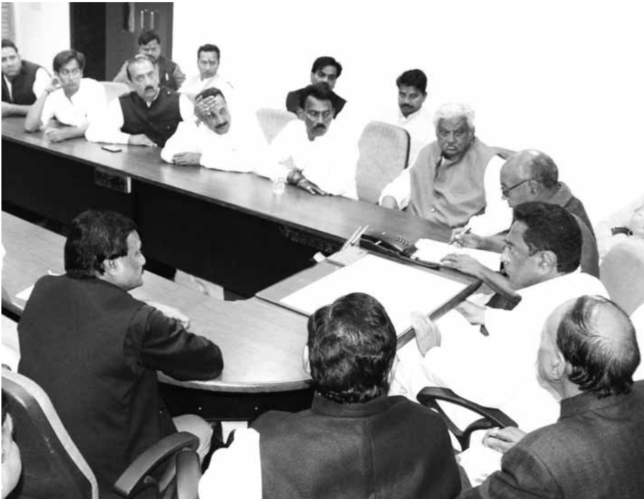
Madhya Pradesh Chief Minister Kamal Nath chairs a meeting of his newly-inducted Cabinet Ministers soon after swearing in ceremony, at PCC headquarters, in Bhopal on Tuesday

Based on the complaint after the preliminary investigation the police registered case of molestation and assault against the accused and started search for the accused.