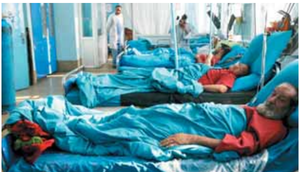
Injured men receive treatment at a hospital after Monday's Christmas Eve attack in Kabul, Afghanistan on Tuesday

It was the deadliest assault in the Afghan capital since a suicide bomber blew himself up in the middle of a religious