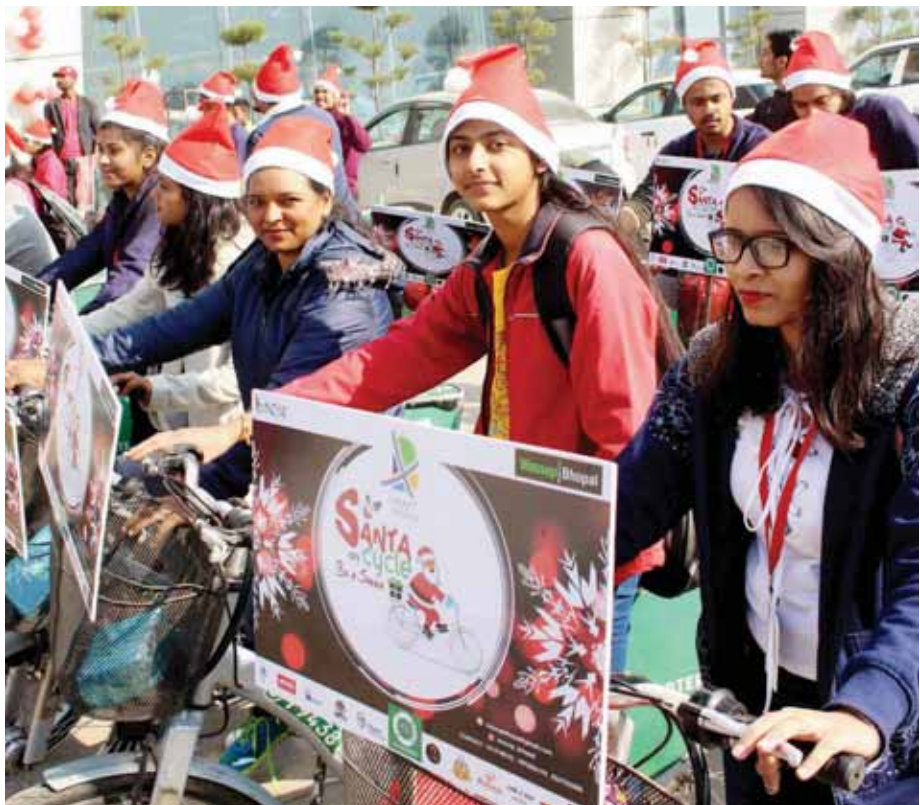
Youths of Wassup group participate at an event 'Santa on Cycle' organised on Christmas festival in Bhopal on Tuesday