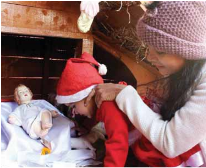
A child pays obeisance at a Crib of an infant Jesus on the occasion of Christmas festival at St. Francis Assisi's Cathedral Church in Bhopal on Tuesday

In his greeting message, the Chief Minister said that