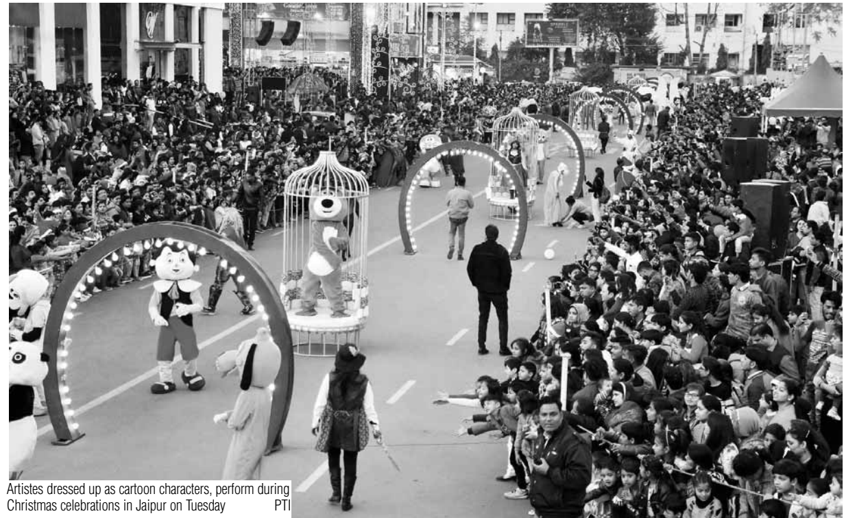
Artistes dressed up as cartoon characters, perform during Christmas celebrations in Jaipur on Tuesday