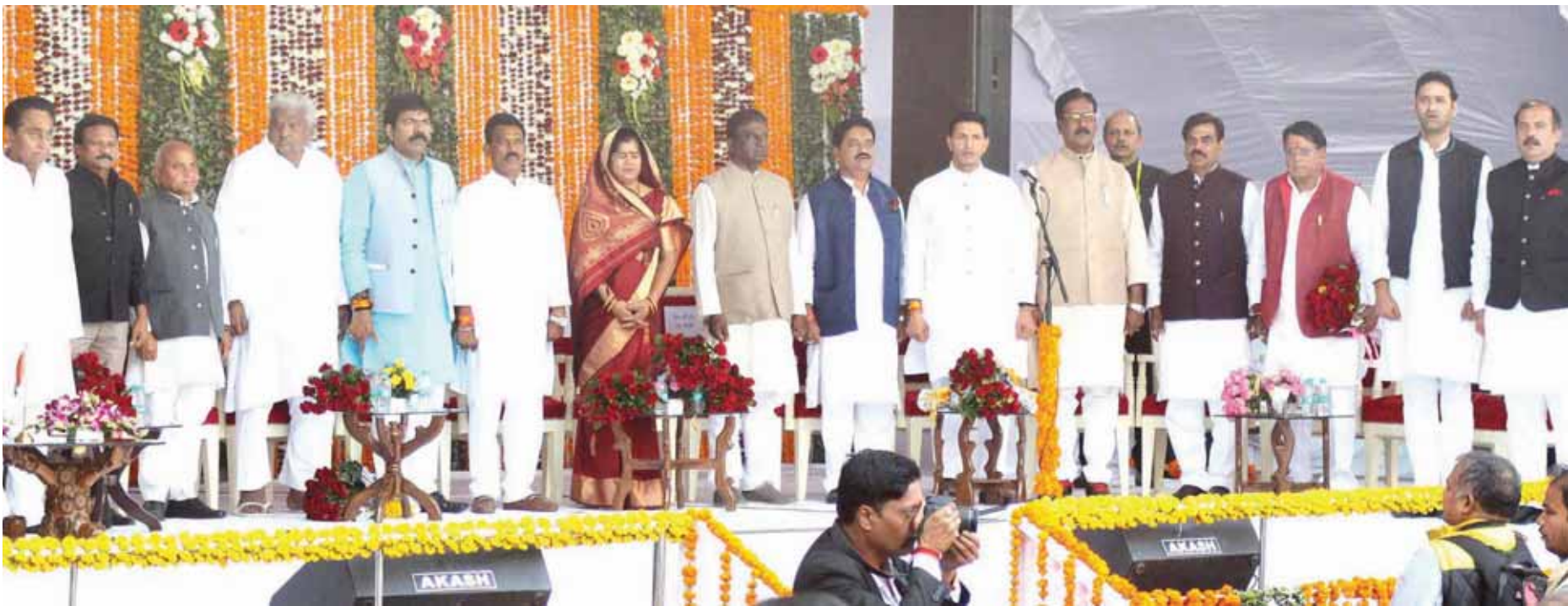
Madhya Pradesh Chief Minister Kamal Nath with newly inducted ministers at the swearing-in ceremony at Raj Bhawan in Bhopal on Tuesday

While talking about the dance form he said that body language is major criteria for the dance. He said it is important to keep body flexible and free at the same time to bring out the essence of the dance form. Then he stated that it is also important to feel the music and feel the dance together.