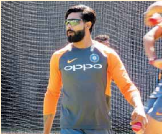
Ravindra Jadeja trains during practice session ahead of third Test

India (XI): Virat Kohli, Mayank Agarwal, Hanuma Vihari, Pujara, Ajinkya Rahane, Rohit Sharma, Rishabh Pant, Ravindra Jadeja, Ishant Sharma, Jasprit Bumrah, Shami. Australia (XI): Tim Paine, Marcus Harris, Aaron Finch, Usman Khawaja, Travis Head, Shaun Marsh, Mitchell Marsh, Nathan Lyon, Starc, Pat Cummins, Josh Hazlewood.