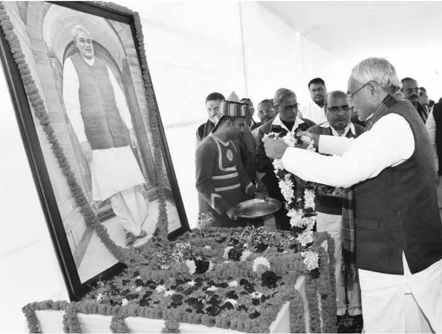
Bihar Chief Minister Nitish Kumar pays tribute former Prime Minister Atal Bihari Vajpayee on his birth anniversary at Sri Krishan Memorial hall in Patna on Tuesday

The positive manner in which he dealt with his alliance partners is a memory to be cherished. Even the dignity with which he treated those in