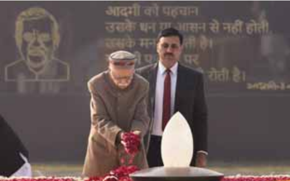
LK Advani pays homage to former Prime Minister Atal Bihari Vajpayee on his 94th birth anniversary in New Delhi on Tuesday

With the whiff of 2019 Lok Sabha polls in the air, Vajpayee returned to the posters outside