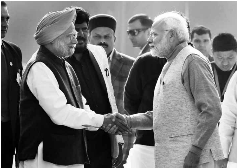
Prime Minister Narendra Modi and Former Prime Minister Manmohan Singh after paying tributes to former Prime Minister Atal Bihari Vajpayee on his 94th birth anniversary in New Delhi on Tuesday

During the inquiry, the chartered accountant, who had purportedly signed the balance sheets, told the bank that it was not the case.