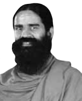
Yoga guru — Baba Ramdev

We do not have a political or religious agenda. We want to make a spiritual India... not Hindu India or communal India.