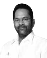
Union Minister —Mukhtar Abbas Naqvi

The drama of dynastic politics staged by the Congress and their ‘Modi Hatao’ movement is just an eyewash.