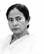
West Bengal CM —Mamata Banerjee

We (TMC) have never been influenced by political colour, if any, of the recipients and only went by eligibility criteria.