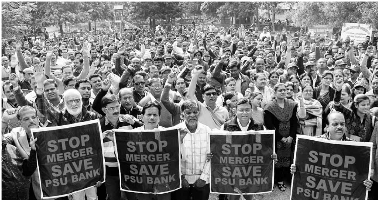
Bank employees stage a protest against the proposed merger of Vijaya Bank and Dena Bank with Bank of Baroda during a nation-wide strike at JDA garden in Jabalpur on Wednesday

The cold wave began in the Valley last week coinciding with the onset of Chillai-Kalan - the 40-day period of harsh winter. It begins on December 21 and lasts till the end of January. The authorities have closed all educational institutions for winter vacations.