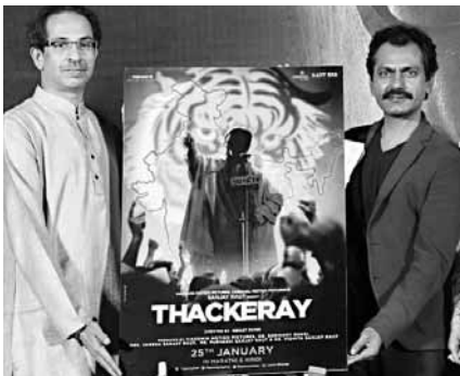
Nawazuddin Siddiqui and Shiv Sena chief Uddhav Thackeray during the trailer launch of film in Mumbai

Responding to the cuts suggested by the CBFC, Raut said: “When we talk of late