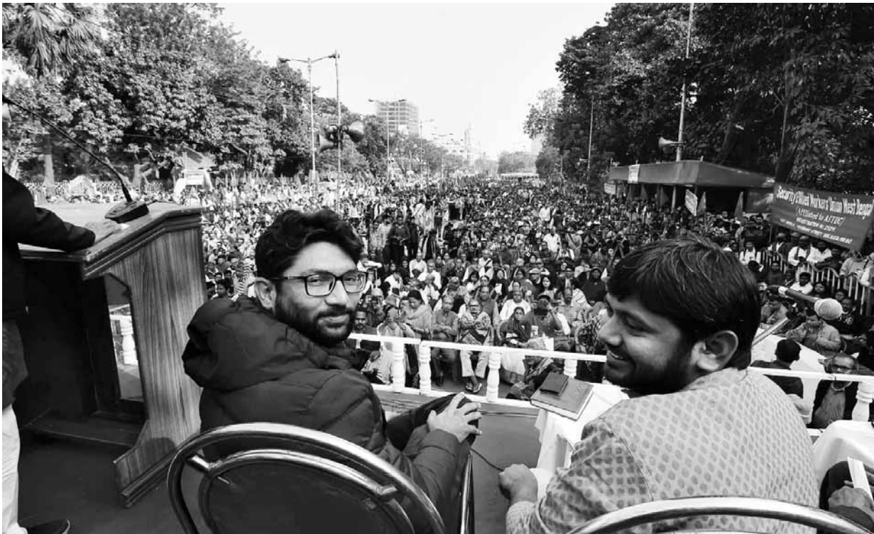
MLA Jignesh Mevani and Student leader Kanhaiya Kumar during a rally to mark the 94th foundation day programme of Communist Party of India (CPI) in Kolkata on Wednesday

Targeting Governor Ram Naik over law and order, Akhilesh said, “When I was the Chief Minister, the Raj Bhawan was hyperactive over law and order situation. The Governor is now maintaining a studied silence and those responsible for deterioration of law and order are being honoured in Raj Bhawan.”