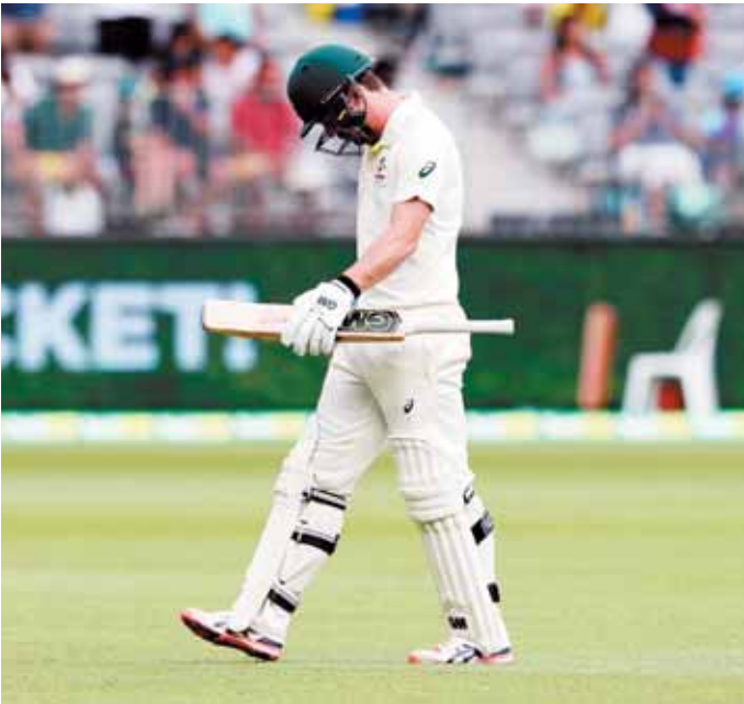
Travis Head walks off the field after getting dismissed in the second Test at Perth

we will get more spin, but we have been able to restrict a lot of runs today even though we didn't get the wickets we would have liked. It makes for an exciting morning and momentum can change."