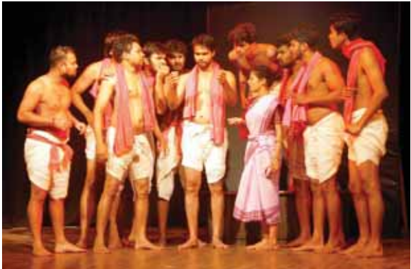
A scene from the play 'Poster' staged at Shaheed Bhawan in Bhopal on Wednesday

Poster creates a huge fuss that changes the lives of the vil-