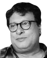
Director —Tigmanshu Dhulia

Today’s society is going down the drains. We live in well-connected world, but we must strive to revive our value system.