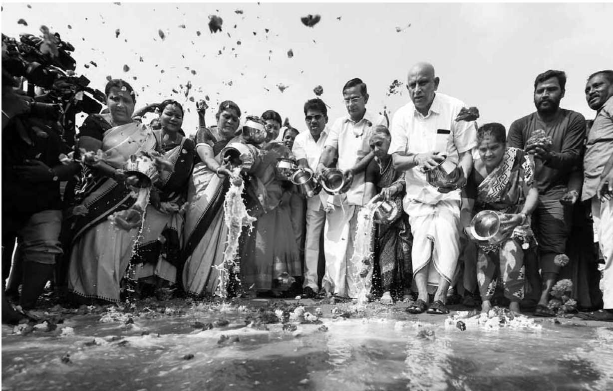
People pay tributes to the victims of tsunami 2004 on the 14th anniversary of the calamity, at Foreshore Estate beach (Pattinapakkam beach) in Chennai, Wednesday