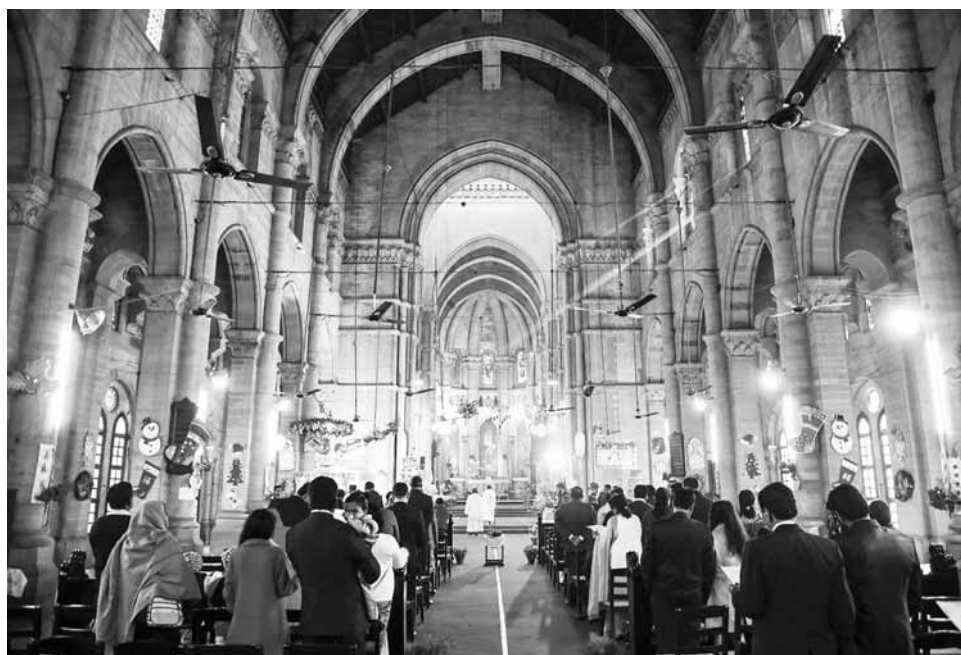
Devotees offer prayers during the Christmas mass at All Saint Cathedral church in Allahabad on Tuesday

The commissioning of this 30-bedded hospital, with a team of specialists in the fields of Medicine, Surgery, Gynecology, Pediatrics, Anesthesia and Dental Sciences; will not only improve the quality and speed of health-care delivery, but also obviate the need for patients, including those with critical ailments and emergency cases, to travel by sea to Mumbai.