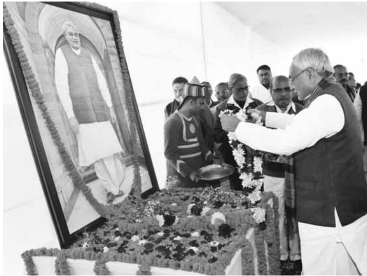
Bihar Chief Minister Nitish Kumar pays tribute former Prime Minister Atal Bihari Vajpayee on his birth anniversary at Sri Krishna Memorial hall in Patna on Tuesday

The positive manner in which he dealt with his alliance partners is a memory to be cherished. Even the dignity with which he treated those in