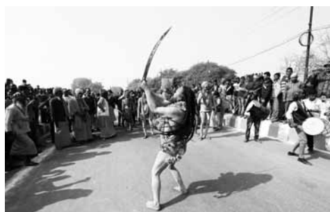
A Naga Sadhu dances holding a sword during a procession toward Sangam in the confluence of rivers Ganges and Yamuna on the first 'royal entry' for the Kumbh Mela in Allahabad on Tuesday