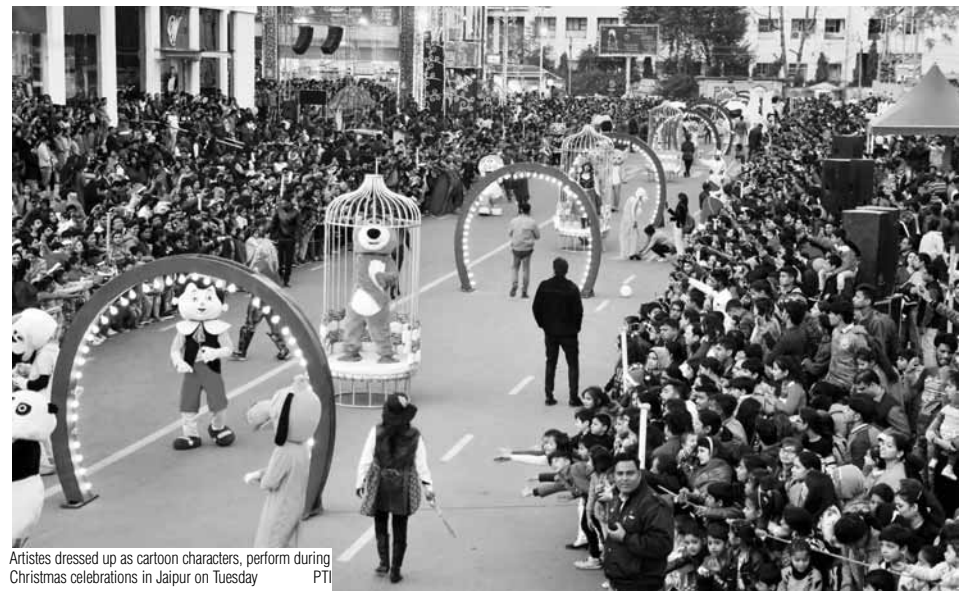
Artists dressed up as cartoon characters, perform during Christmas celebrations in Jaipur on Tuesday