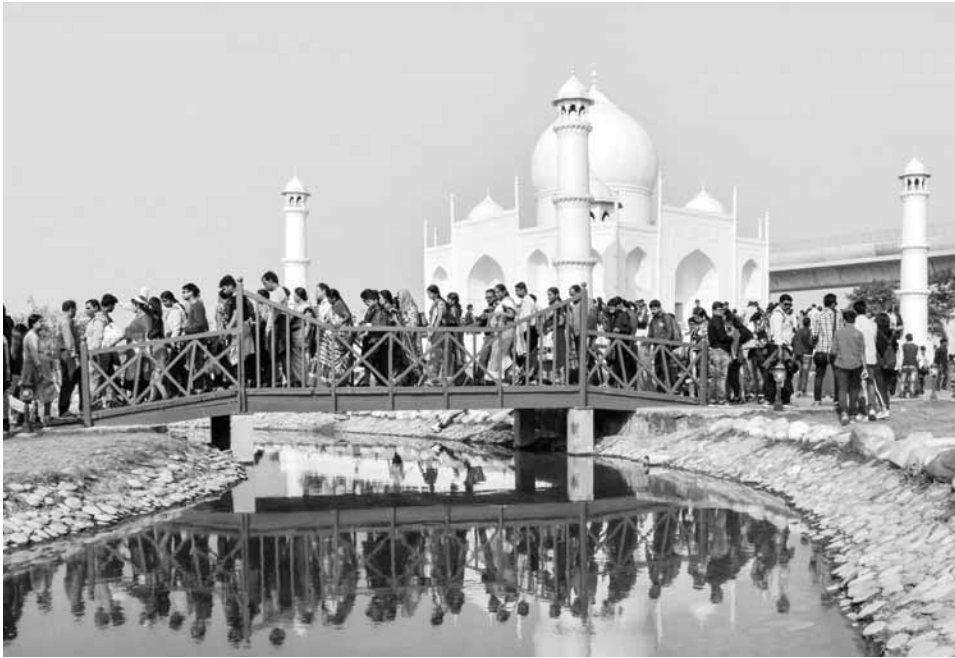
People visit the replica of Taj Mahal at Echo Park, Rajarhut-New Town city near Kolkata on Tuesday