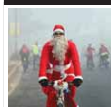
A cyclist dressed like Santa Claus rides through dense fog on a cold Christmas winter morning in New Delhi on Tuesday