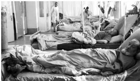
Injured men receive treatment at a hospital after Monday's Christmas Eve attack in Kabul, Afghanistan on Tuesday

It was the deadliest assault in the Afghan capital since a suicide bomber blew himself up in the middle of a religious