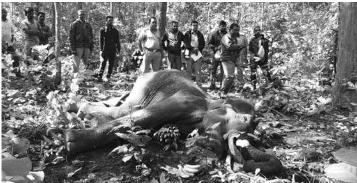
■ ROURKELA

An ailing tusker died late on Monday night in Toda Reserve Forest under the Bonei Forest Division of Sundargarh district.