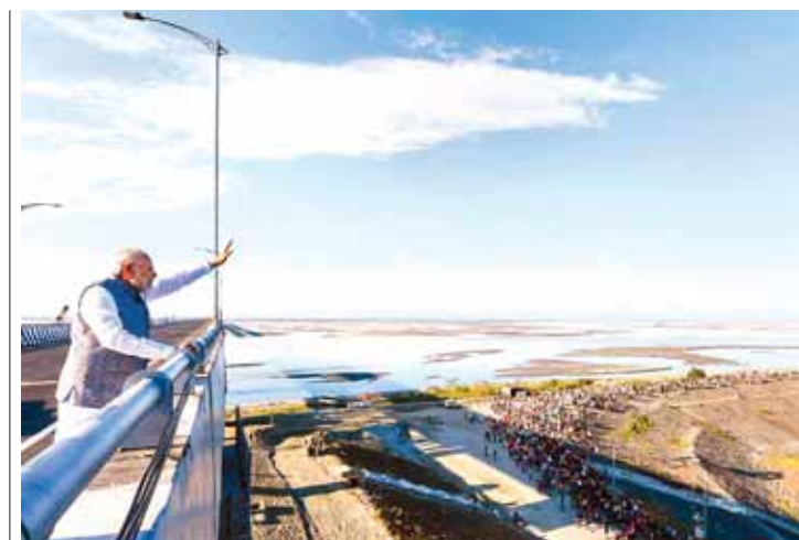
Prime Minister Narendra Modi strolls on the Bogibeel Bridge, the longest rail-cum-road bridge on Brahmaputra river, after it was inaugurated by him in Dibrugarh on Tuesday

"Both NDA and UPA are seeking to rule the country on their own while KCR wants that the power should be in the hands of the regional parties to meet the aspirations of the people", he told the media. "If the regional parties had responded positively back in 2006, Telangana State would have become a reality then only," he said.