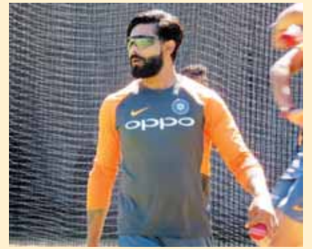
Ravindra Jadeja trains during practice session ahead of third Test

Australia (XI): Tim Paine, Marcus Harris, Aaron Finch, Usman Khawaja, Travis Head, Shaun Marsh, Mitchell Marsh, Nathan Lyon, Starc, Pat Cummins, Josh Hazlewood.