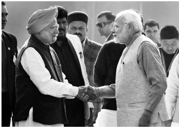
Prime Minister Narendra Modi and Former Prime Minister Manmohan Singh after paying tributes to former Prime Minister Atal Bihari Vajpayee on his 94th birth anniversary in New Delhi on Tuesday