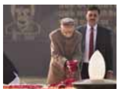
LK Advani pays homage to former Prime Minister Atal Bihari Vajpayee on his 94th birth anniversary in New Delhi on Tuesday

With the whiff of 2019 Lok Sabha polls in the air, Vajpayee returned to the posters outside the BJP headquarters along