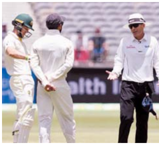
Virat Kohli, centre, looks to the umpire ICC from the team management about the incident and would like to classify the reports as baseless."

"It is assumed that Kohli said, 'I am the best player in the world and you are just a stand-in captain'. These claims were based on hearsay and the BCCI would like to bring into notice that no such words were spoken on the field by the Indian captain," BCCI said in a statement. "The BCCI got a clarification