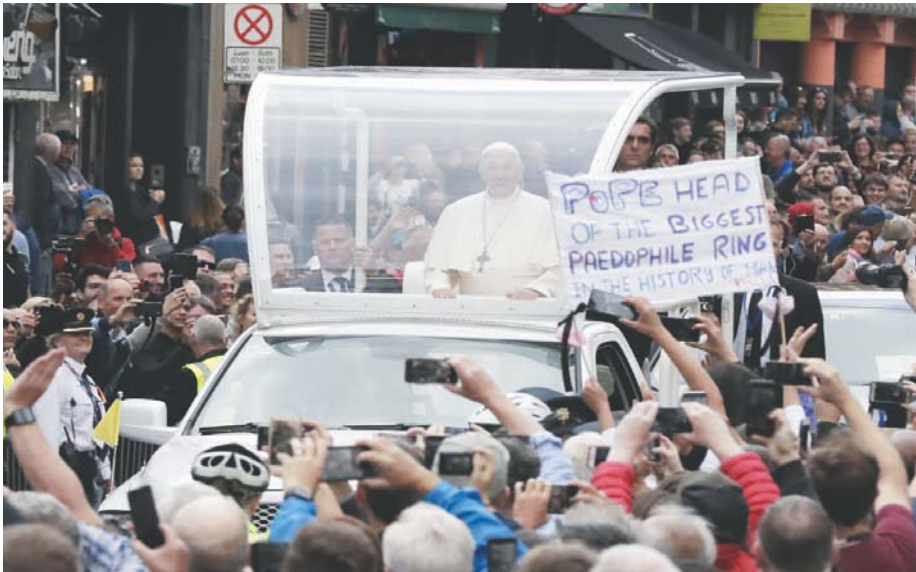
In this Saturday, Aug. 25, 2018 file photo Pope Francis passes by a banner of a protester as he leaves after visiting St Mary's Pro-Cathedral, in Dublin, Ireland. Pope Francis is on a two-day visit to Ireland.

Pope Francis also warned against corruption and the pursuit of personal ambition at the expense of wider society, saying that when rulers look out only for themselves, the future is compromised, especially for the younger generations which become marginalised.