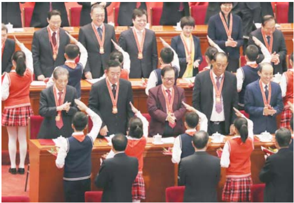
Children salute medallion recipients during a conference to commemorate the 40th anniversary of China's Reform and Opening Up policy at the Great Hall of the People in Beijing on Tuesday.

The Chinese leader said China would not develop "at the expense of other countries' interests." China's expanding footprint worldwide — from Asia-Pacific to Africa and beyond through a broad network of infrastructure projects called the Belt and Road Initiative — has led some nations to raise the alarm over what they call China's long arm of influence, which has been criticised for being political as well as economic. While Xi said China is "increasingly approaching the center of the world stage," he also noted