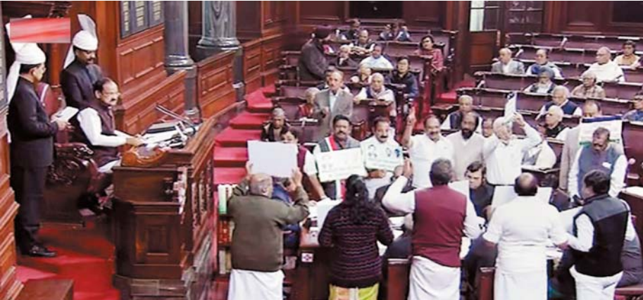
Rajya Sabha Chairperson M Venkaiah Naidu looks on as Opposition members protest in the Rajya Sabha during the Winter Session of Parliament in New Delhi on Tuesday

In the Rajya Sabha, Leader of Opposition Ghulam Nabi Azad said the privilege motion moved by the Congress should be taken up alleging the Government misled the Supreme Court and Parliament on the Rafale issue. He also said the Government has no right to continue and “should go.” Chairman M Venkaiah Naidu, however, said that the Chair should be allowed to take a view.