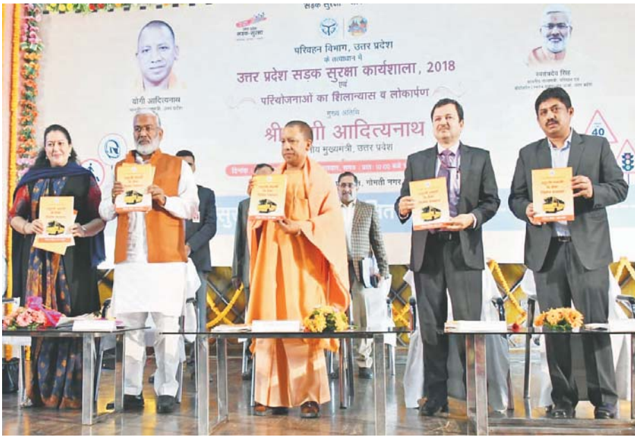
Chief Minister Yogi Adityanath at the road safety workshop held at Indira Gandhi Pratishthan on Tuesday

The Chief Minister said that it was important for the people to know that good roads did not mean that no monitoring should be carried out on their speed. "The commuters