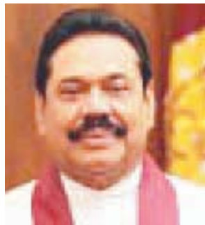
Rauff Hakeem of the Sri Lanka Muslim Congress raised objections against Rajapaksa's appointment.

His appointment was announced by Speaker Karu Jayasuriya in Parliament which met for the first time after the reinstatement of Ranil Wickremesinghe as prime minister that ended the 51-day political standoff in the country. M A Sumanthiran of Tamil National Alliance (TNA) and