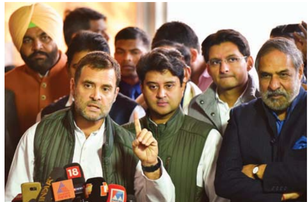
Congress president Rahul Gandhi addresses the media during the Winter Session of Parliament in New Delhi on Tuesday

"We promised to waive loans in 10 days. In two States (Madhya Pradesh and Chhattisgarh), we did it within six hours and we would do it in the third State very soon,"