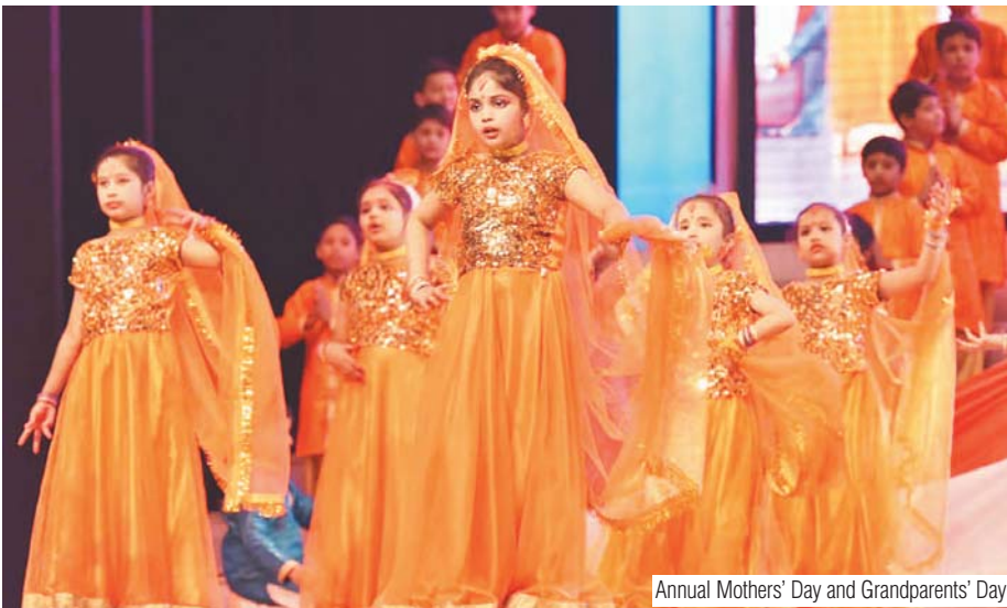
Annual Mothers' Day and Grandparents' Day