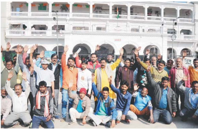
Shahnajaf roadside vendors protesting at LMC headquarters on Tuesday

The Municipal Commissioner said that they were trying to facilitate vendors even as they carried out their shifting to proper zones. He admitted that there were several challenges which they were facing in this regard. "The issues involve the coordination of many departments which include the Traffic and the Police departments. The first problem which we are facing are vending zones which had been decided earlier but are not getting the NOC from the Traffic department due to the congestion which they are causing. Hence these vending zones have not got the