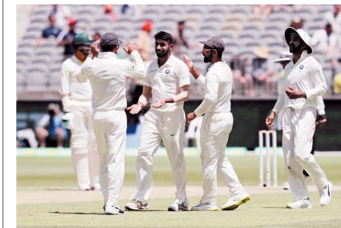
Jasprit Bumrah, third from left, celebrates after dismissing Pat Cummins