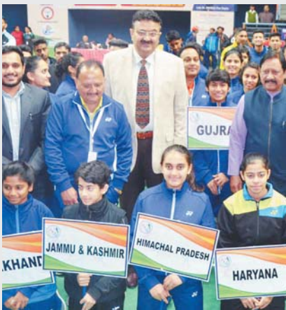
Sports Minister Chetan Chauhan with participants