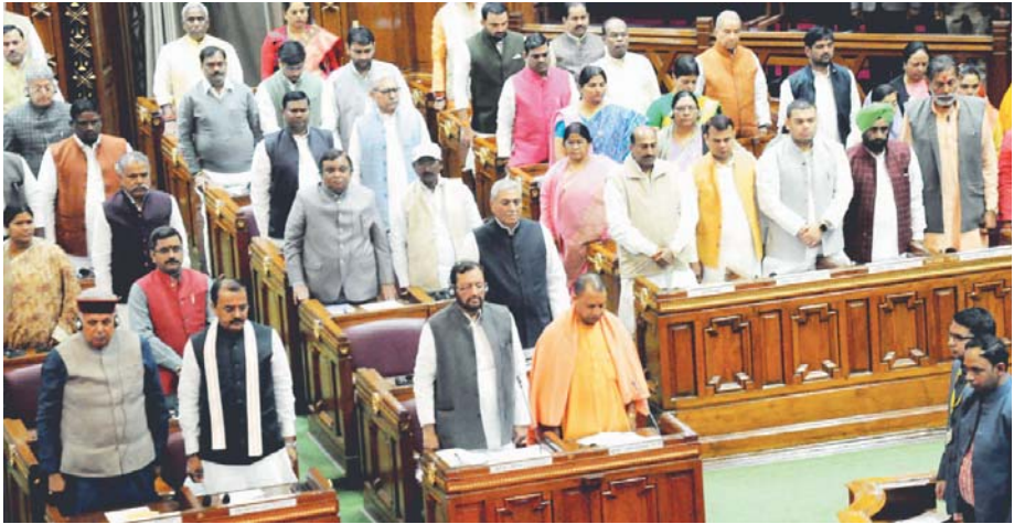
Chief Minister Yogi Adityanath and other MLAs mourning the death of former CM Narain Dutt Tewari at UP Assembly session on Tuesday