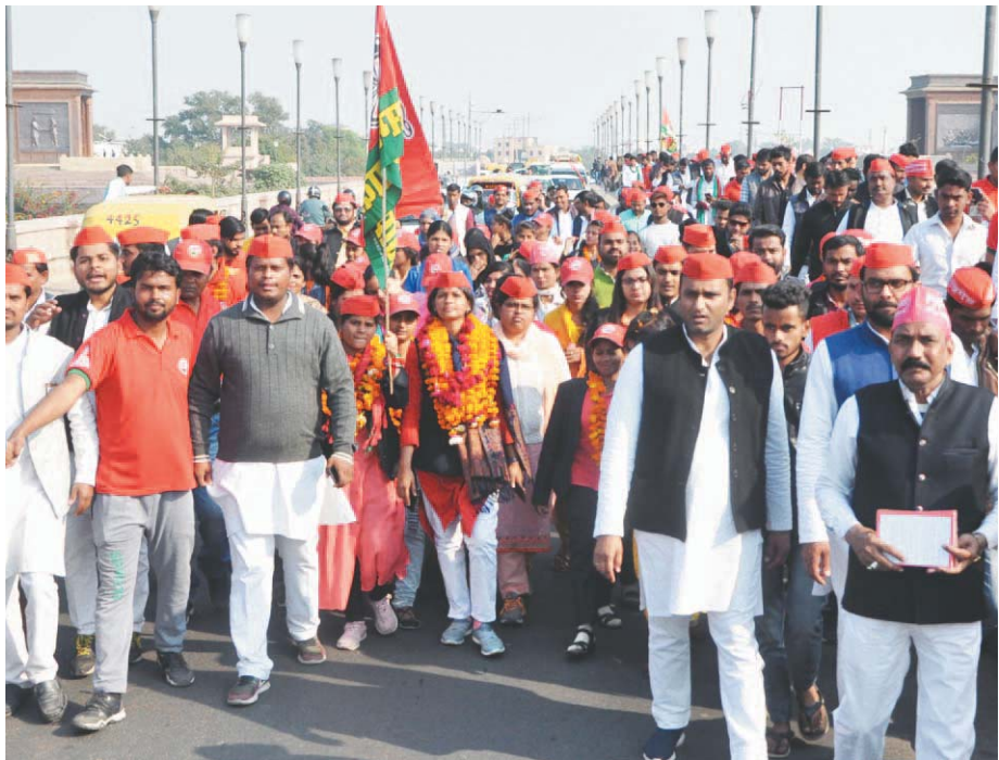
Samajwadi Party members taking out a padyatra from 1090 Crossing on Tuesday

Meanwhile, in Ghazipur, four youths were buried alive when a wall collapsed at Alipur village of Jangipur police sta-