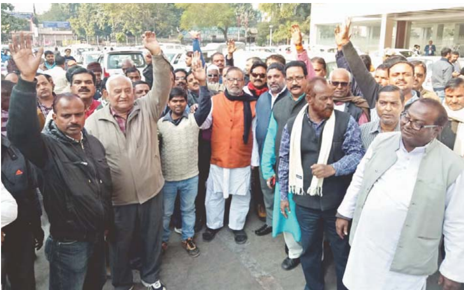
Members of Vidyut Karmachari Sangathan Morcha staging a protest at Shakti Bhawan on Tuesday