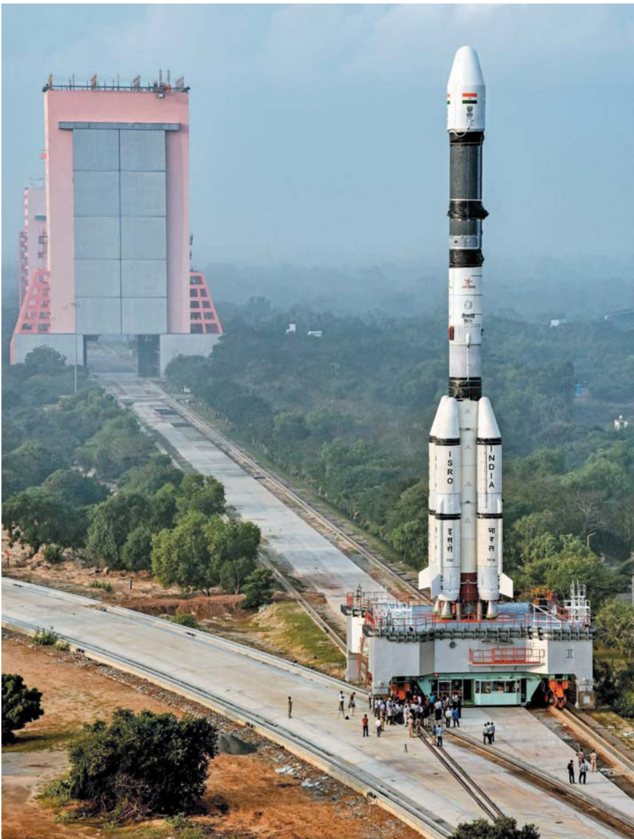
Indian Space Research Organisation's GSAT-7A onboard GSLV-F11 being taken to the launch pad during the countdown for its launch, at Satish Dhawan Space Centre in Sriharikota on Tuesday. The rocket will be launched from the launch pad 2 at 4:10 pm on Wednesday

Moreover, construction of airfields and advanced landing grounds(ALG) in the Ladakh region is a tough call given the terrain and climate where building activity is restricted only five to six summer months before snow blocks everything.