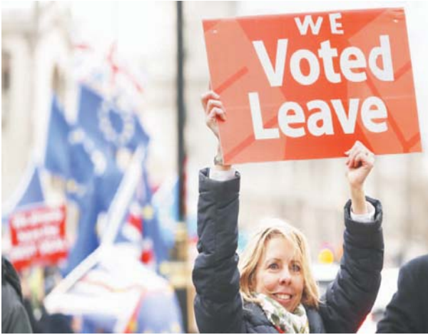
A pro-Brexit demonstrator waves a placard with others outside the Houses of Parliament in London on Tuesday.

Labour had the option of tabling a binding motion but faced defeat after Conservative Brexit hardliners and the