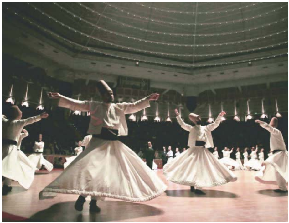
In this photo taken on Sunday, Dec. 16, 2018, whirling dervishes of the Mevlevi order perform during a Sheb-i Arus ceremony in Konya, central Turkey. Every December the Anatolian city hosts a series of events to commemorate the death of 13th century Islamic scholar, poet and Sufi mystic Jalaladdin Rumi.