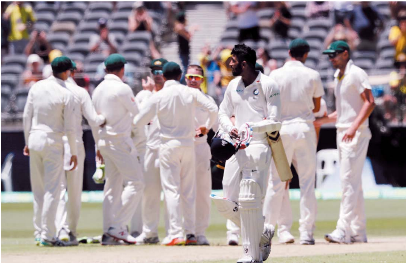
Jasprit Bumrah walks off as Australian players celebrate winning the second Test between Australia and India in Perth on Tuesday

Vihari was the first to go, lobbing a catch off Starc to short point. Pant then tried to play a few more attacking strokes, but he didn't comprehend the situation well and was confused whether to farm the strike at all.