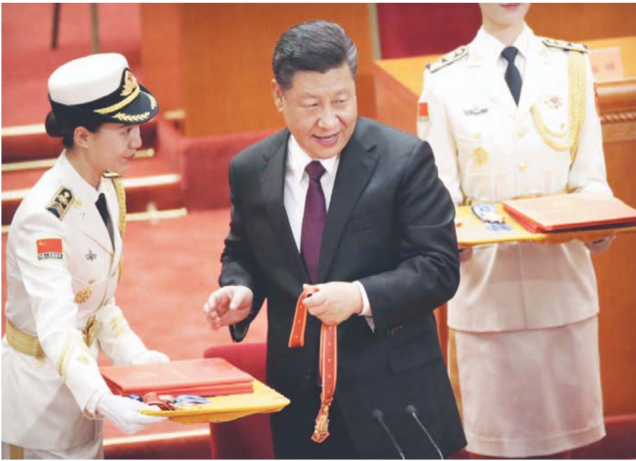
Chinese President Xi Jinping prepares to present a medallion during a conference to commemorate the 40th anniversary of China's Reform and Opening Up policy at the Great Hall of the People in Beijing on Tuesday.

Despite the economic reforms, the past decades have not brought change to China's rigid one-party system of communist rule.