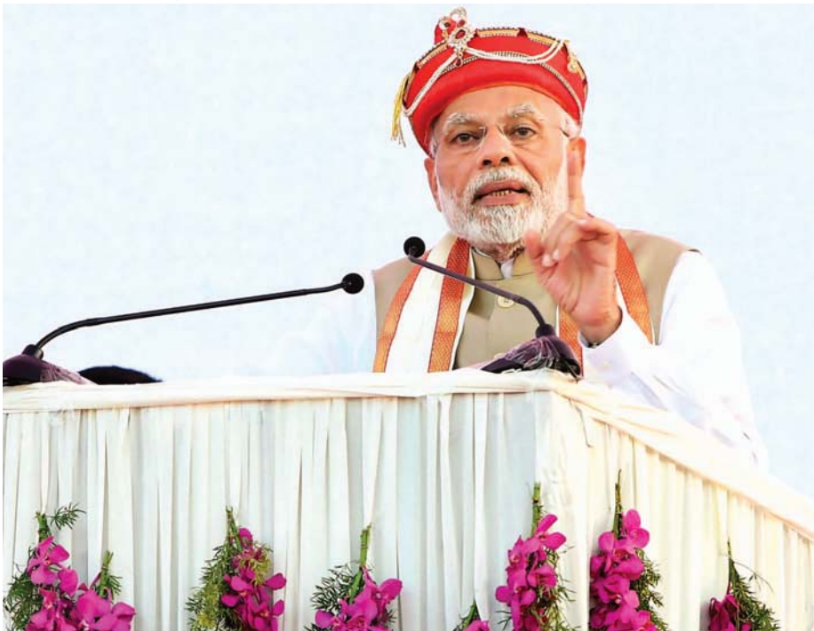
Prime Minister Narendra Modi addresses a gathering at the foundation stone laying ceremony of Metro Phase III via remote in Pune on Tuesday

"In 2014, 65 lakh entrepreneurs had registered themselves for the payment of taxes. However, ever since the introduction of GST, 55 lakh more entrepreneurs have come under the taxation net," said the Prime Minister.