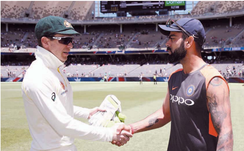
Australian skipper Tim Paine shake hands with counterpart Virat Kohli after the end of second Test

"I don't think we did touch to be honest. It got