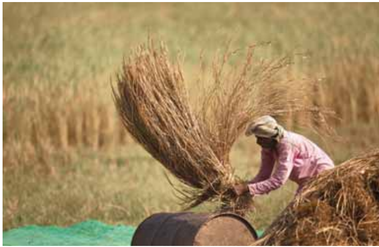
A farmer threshes his paddy harvest on the outskirts of Gauhati on Friday