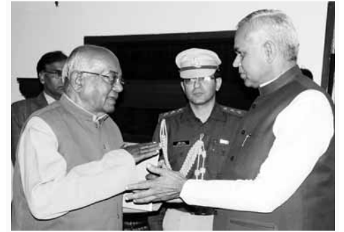
Chandigarh: Himachal Governor Acharya Devvrat on Friday called on Satyadev Narayan Arya, Governor of Haryana at Raj Bhawan Chandigarh. Officials said it was a courtesy call.