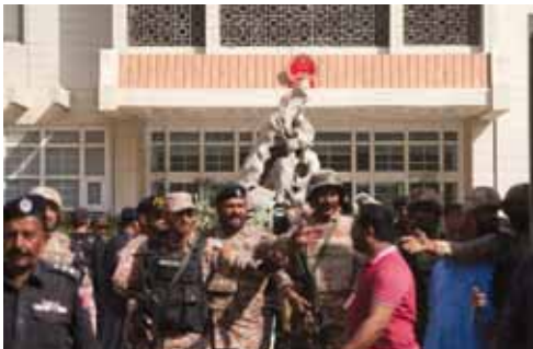
Pakistani troops move in the Chinese Consulate in Karachi on Friday

Two civilians, a father and his son, too were killed, officials said. The Sindh Government and the Pakistan Army confirmed that three terrorists were killed in the operation.