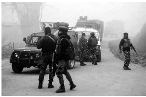
Security forces arrive to take positions near the house where ultras were hiding during an encounter at Bijbehara area of Anantnag district on Friday