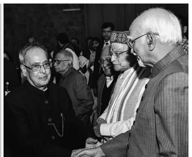
Former President Pranab Mukherjee with former Vice-President Hamid Ansari and BJP senior leader Murli Manohar Joshi during the National Conference on 'Towards Peace, Harmony and Happiness: Transition to Transformation' in New Delhi on Friday

Addressing the gathering, former Delhi Minister and rebel AAP legislator Kapil Mishra alleged Hindus were being treated as "second class citizen" in the country by successive Governments. He demanded a complete ban on export of beef. Speakers at the workshop demanded the Government set up a body with a seed money of at least ₹10,000 crore for restoration of dilapidated temples and heritage institutions.