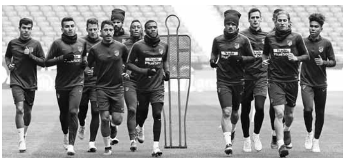
Atletico Madrid players train during practice session ahead of their La Liga clash against Barcelona