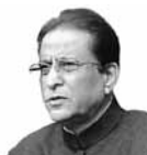
Samajwadi Party leader —Azam Khan

When power becomes the law, the law is reduced to nothing in front of such power. This is what leads to dictatorship.