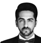
Actor —Ayushmann Khurrana

Life is never perfect. You have to celebrate its imperfections. Accept that there would be a void in life every time.