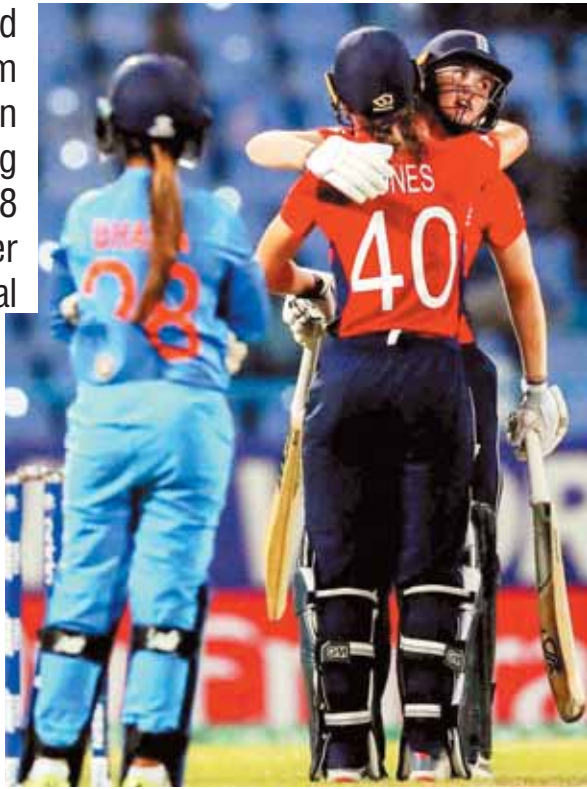
AE Jones and Natalie Sciver hug each other after England beat India in the second semifinal of Women's T20 World Cup at Sir Vivian Richards Stadium in North Sound, Antigua and Barbuda

On a track where the ball wasn't coming on to the bat, it was the Englishwomen, who came up trumps with left-arm spinners Kirstie Gordon (2/20 in 4 overs) and Sophie Ecclestone