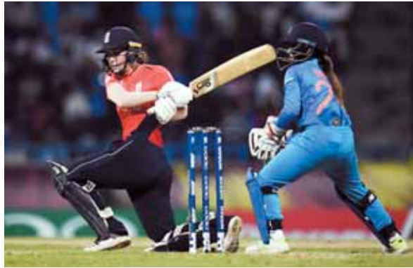
English batswoman plays a shot during second semifinal match against India

At Guyana, it was a slow track where the ploy of taking pace off the deliveries worked for the likes of Poonam Yadav (0/29 in 4 overs), Deepti (1/24 in 4 overs) and Anuja Patil (0/27 in 3.1 overs).