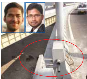
Spot where the bike hit a divider on Signature Bridge and the bikers (insets) fell off the bridge to their death