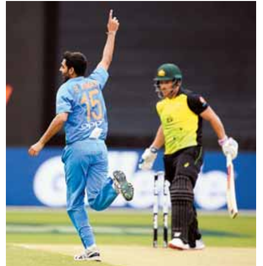
Bhuvneshwar Kumar celebrates after dismissing Aaron Finch for golden duck

Coulter-Nile hit two sixes and a four during his nine-ball stay. McDermott held one end together and put on 31 runs off 20 balls with Andrew Tye (12 not out), providing a little impetus to the innings before rain halted proceedings.