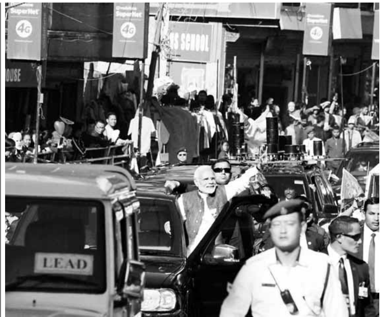
Prime Minister Narendra Modi waves during an election roadshow in Aizawl, Mizoram on Friday

According to official sources the formula of the ink is a closely guarded secret and have been sending ink to 30 countries, including India, Thailand, Singapore, Nigeria, Malaysia, Cambodia, and South Africa. The company has around 100 employees and making profit since 1995. Made in Karnataka ink is an indelible component in the election process of the country.