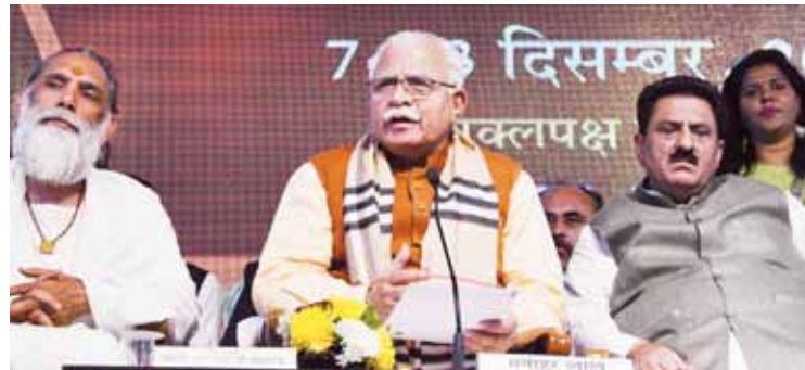
Haryana Chief Minister Manohar Lal at a press conference regarding International Gita Mahotsav (IGM), to be organised from December 7-23, at Kurukshetra

He said that the present State Government has been organising the Gita Mahotsav at international level since 2016. This year, the International Gita Mahotsav -2018 to be organised from December 7 to 23, would have Mauritius as partner country and Gujarat as partner state.