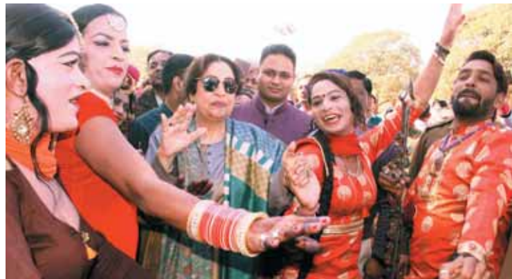
Chandigarh MP, Kirron Kher, at the inaugural function of the three-day Chandigarh Carnival which began at Leisure Valley, Sector-10 on Friday.

The floats designed on the Gandhi theme had different components depicting the lifestyle of the iconic leader. The colorful rally went around the