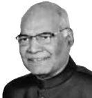
President —Ram Nath Kovind

Australian business-persons and investors looking to India should borrow from the methods of cricketers.