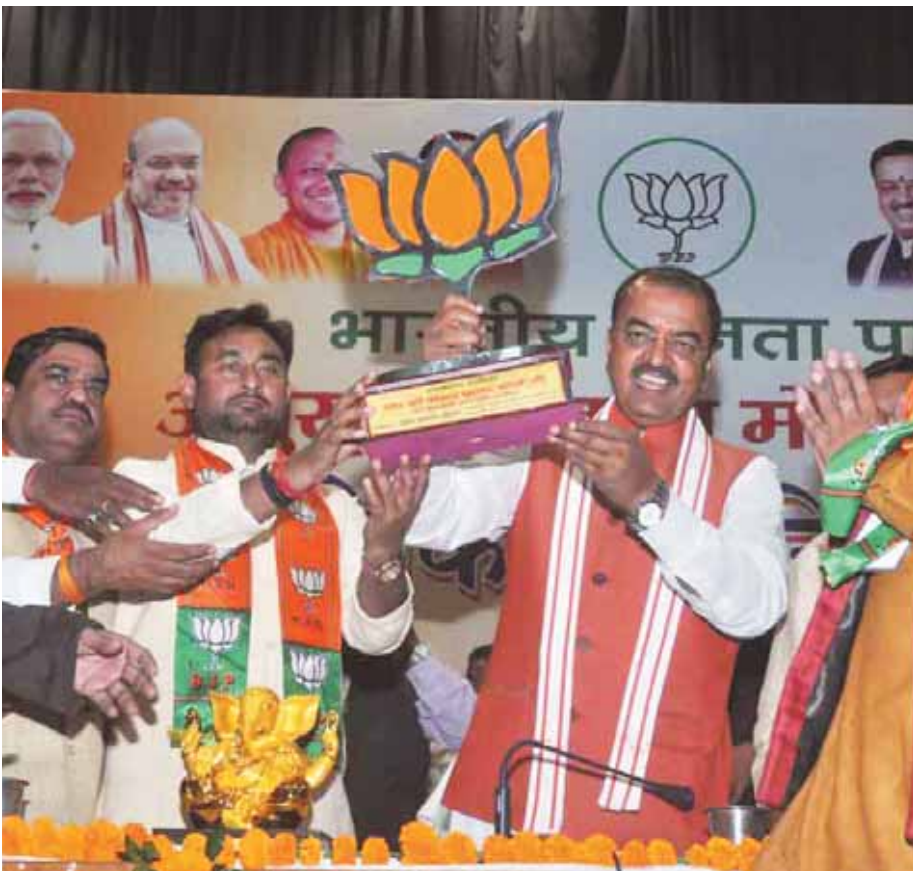
Deputy Chief Minister Keshav Prasad Maurya addressing the caste convention of the Dalit-Khatik on Tuesday.

He said for the first time free LPG connections had been provided to over 4 crore families across the country of which over 50 lakh benefited in UP alone. Continuing his tirade against the Opposition parties, particularly the Samjawadi Party and the Bahujan Samaj Party, the Deputy Chief Minister said: "Had the previous government taken care for the welfare of Dalits and other socially and economically backward communities, they have by now joined the economic mainstream of the country like rest of other communities."