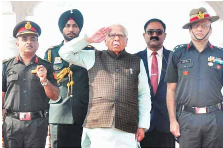
Governor Ram Naik taking salute of cadets on NCC Day at Riverfront on Tuesday