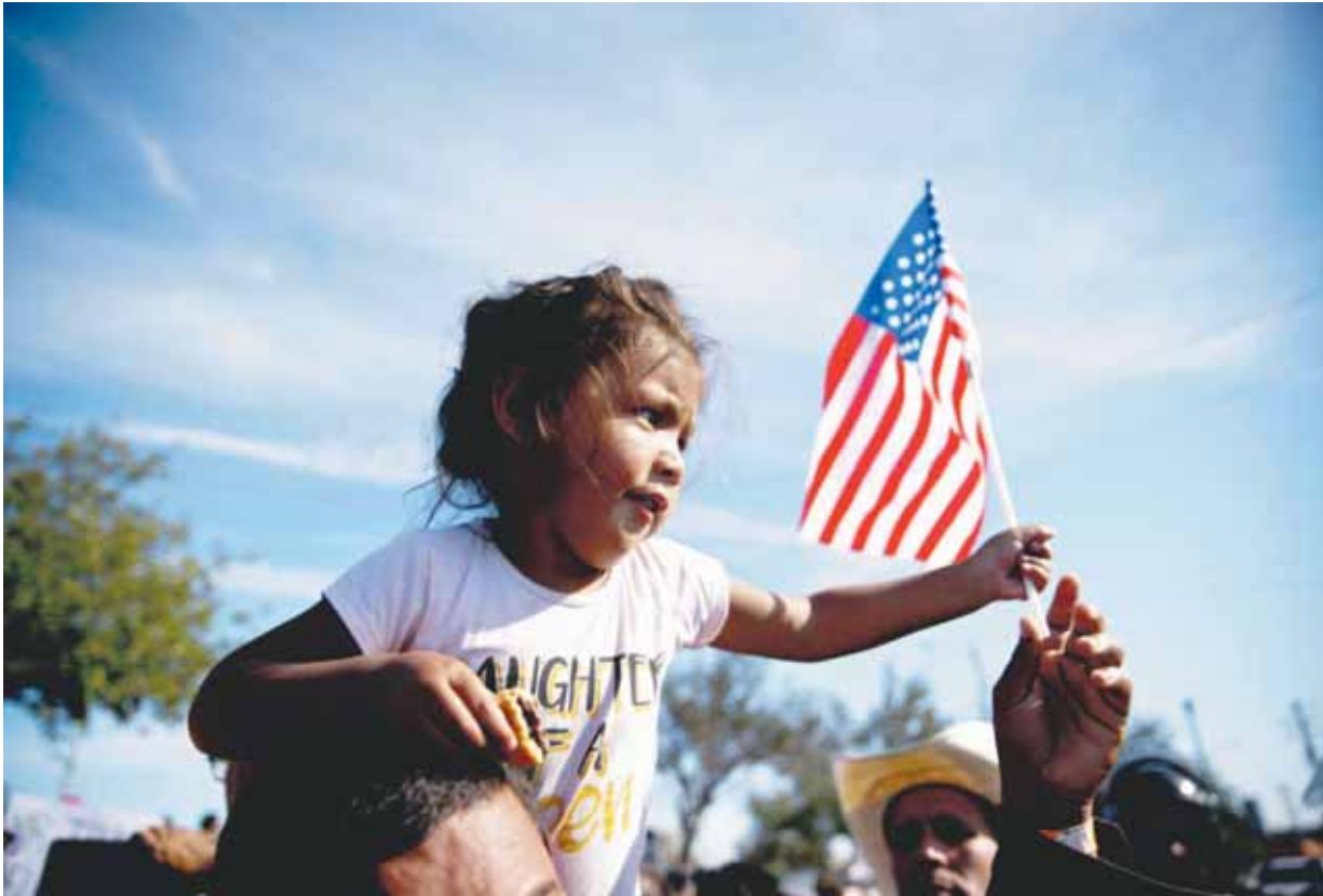
A migrant girl with a U.S. flag sits on the shoulders of a man marching with other migrants to the Chaparral border crossing in Tijuana, Mexico on Sunday as they try to reach the U.S. The mayor of Tijuana has declared a humanitarian crisis in his border city and says that he has asked the United Nations for aid to deal with the approximately 5,000 Central American migrants who have arrived in the city.

Also, some institutions and netizens in China are collecting donations to help the families of the policemen killed and injured in the attack. Resource-rich Balochistan is at the heart of the Beijing’s ambitious China-Pakistan Economic Corridor (CPEC). The BLA is opposed to the CPEC, which connects Gwadar Port in Balochistan with China’s Xinjiang province, alleging that the project was aimed at exploiting the resources of the province.