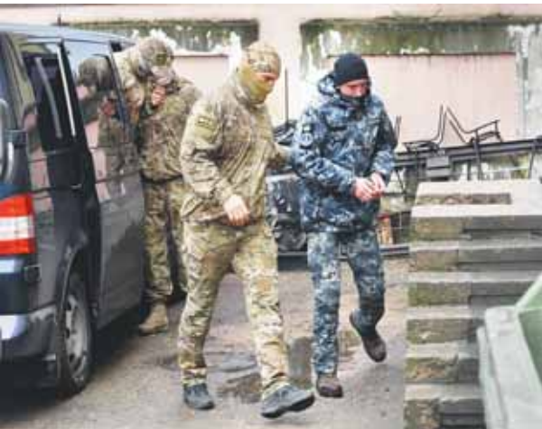
A Ukrainian sailor, right, is escorted by a Russian intelligence agency FSB officer to a court room in Simferopol, Crimea on Tuesday.

Moscow has accused Kiev of planning Sunday's confrontation as a provocation aimed at drum-