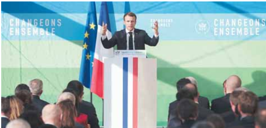
French President Emmanuel Macron delivers a speech on ‘The presentation of the strategy for ecology transition’, at the Elysee Palace in Paris on Tuesday.

Follow-up studies will examine whether the method developed by the chemists in Halle can also be used for large-scale removal of pollutants.