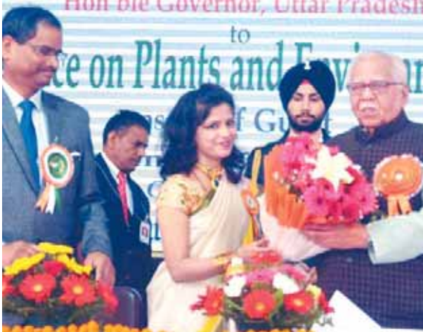
Governor Ram Naik at the conference on Tuesday