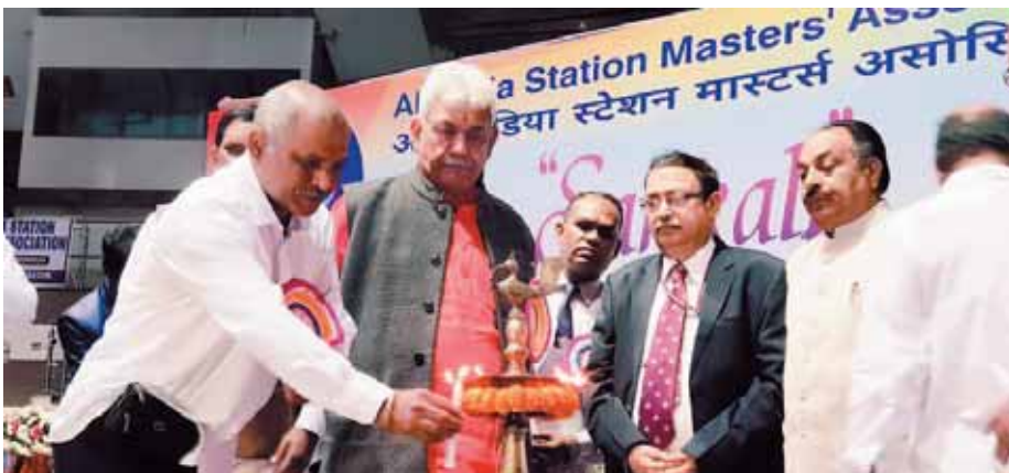
Minister of State (MoS) for Railways Manoj Sinha on Tuesday inaugurated the General Meeting of All India Station Masters' Association (AISMA) in the national Capital. Over 3,000 station masters, including Lady Station Masters from across 7,500 stations of 68 divisions of Indian Railways' network, participated in the two-day event. Minister for Heavy Industries (State) Babul Supriyo, national vice-president BJP Shyam Jajoo, Chairman Railway Board Ashwani Lohani and Secy General AIRF Shiv Gopal Mishra and other Railway Board dignitaries were present on the occasion

“The two sides reiterated the need for a comprehensive reform of the United Nations, including its Security Council,” the statement said. Romania will take over the Presidency of the European Council in January 2019. The Romanian Foreign Minister also met the deputy national security advisor during his visit from November 23-27. PTI