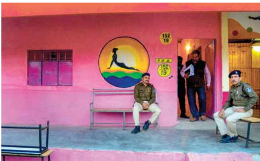
Security personnel outside a 'pink' polling booth ahead of Madhya Pradesh Assembly election in Bhopal on Tuesday. About 500 'pink' polling booths, to be managed by all-woman staff, have been set up in MP for the Assembly elections