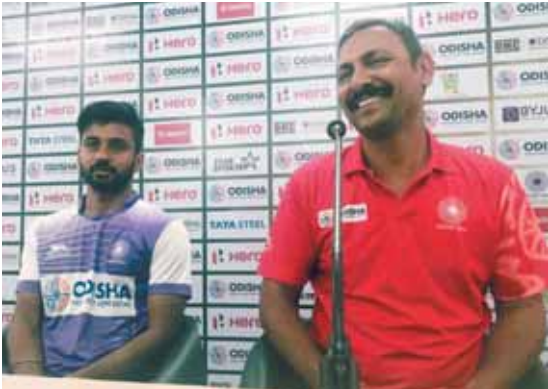
Indian skipper Manpreet Singh and coach Harendra Singh speak during pre-match press conference