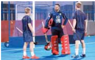
South African players chat during practice session ahead of opening game against India

into the tournament is to become the most successful South African hockey playing nation in the history of the World Cup.