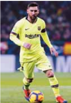
Lionel Messi dribbles during La Liga game against Atletico; (right) Mo Salah celebrates after scoring

A look at the four Champions League groups on Wednesday.