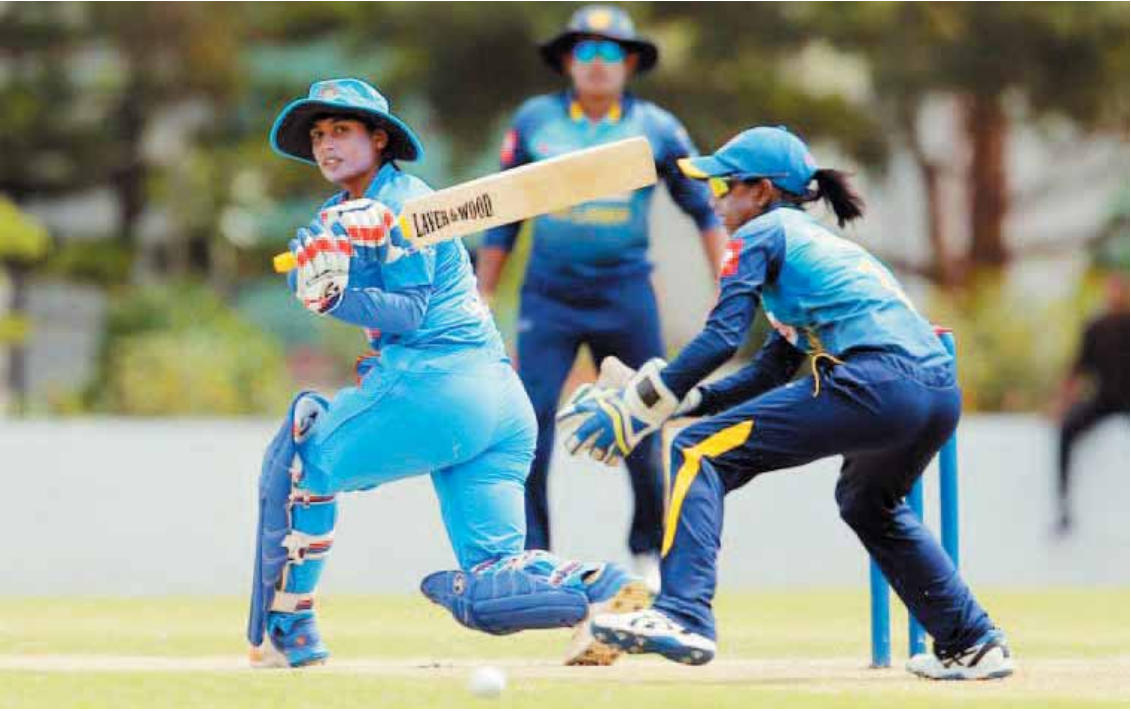
Mithali Raj bats during Asia Cup match against Sri Lanka

"My issues with the coach started immediately as we landed in the West Indies. At first there were small signs