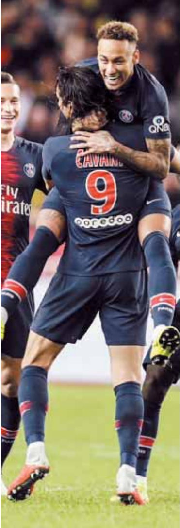
Edinson Cavani hugs teammate Neymar Jr after Brazilian playmaker scores against Lille in Ligue 1 clash

Schalke hasn't made it to the knockout stage since 2014-15.