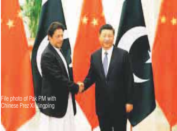
File photo of Pak PM with Chinese Prez Xi Jinping

“Pakistan has made it clear that they will get to the bottom of this attack, crack-down on the terrorist organisation and enhance the secu-