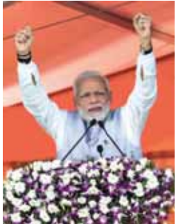
PM Narendra Modi addresses an election rally in Nizamabad on Tuesday