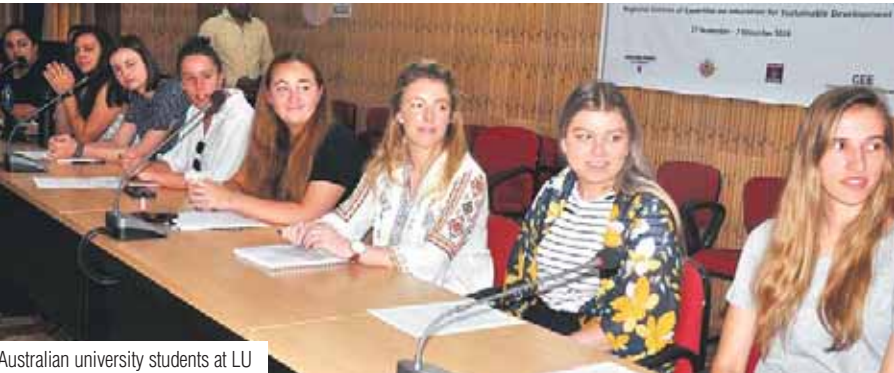
Australian university students at LU

A sustainability exchange programme was inaugurated at Uma Hari Krishana Awasthi Hall of Lucknow University on Tuesday. Students of western Sydney, Australia, and