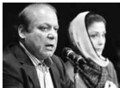
sentenced the trio on July 6.

The accountability court judge Mohammad Bashir had