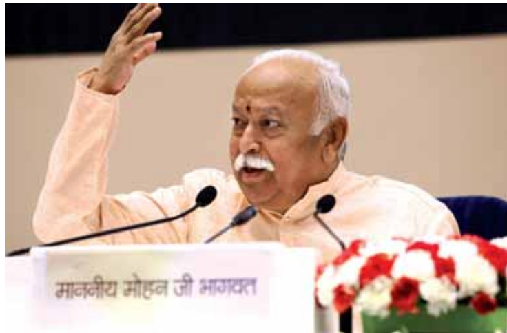
RSS chief Mohan Bhagwat speaks on the last day at the event titled 'Future of Bharat: An RSS perspective' in New Delhi on Wednesday

Bhagwat said the RSS was ready to offer its "swayamsevak" to any other political party other than the BJP if so