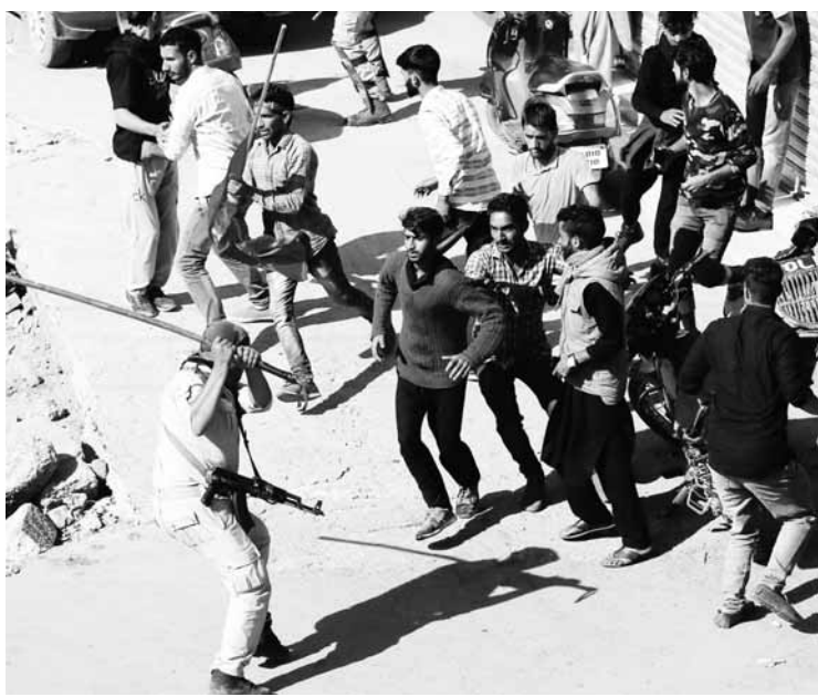
Kashmiris clash with policemen during a Muharram procession in Srinagar on Wednesday