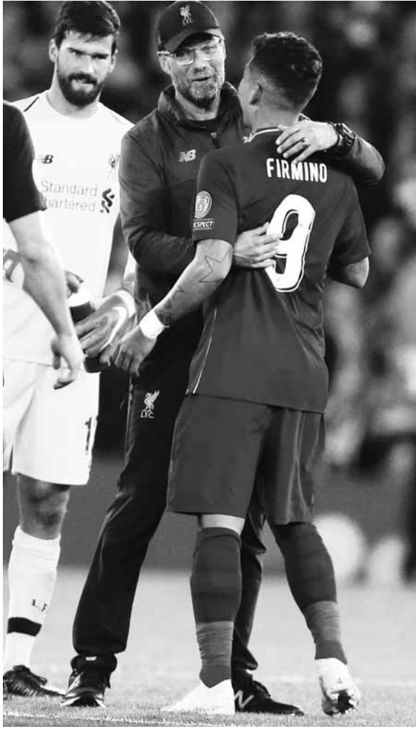
Liverpool manager Jurgen Klopp hugs Roberto Firmino after game against PSG