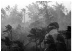
Uttarakhand on September 22 and 25.

According to information provided by the State Meteorological Centre, current meteorological analysis and model predictions suggest that the south-west monsoon is likely to become active from September 22 onward for the next three to four days in Uttarakhand. Under the influence of this condition light to moderate rain/thunderstorm is very likely to occur at many places on September 22, 23, 24 and 25 in the State. Further, heavy rainfall is also likely to occur at isolated places in