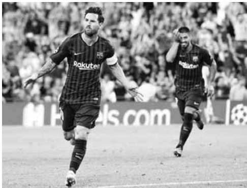
Lionel Messi celebrates after scoring against PSV in Champions League

While Pulisic spared Dortmund's blushes in Belgium on his 100th appearance for the club, it was a bad night for Mario Goetze.