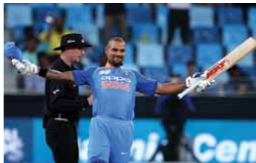
Shikhar Dhawan celebrates after scoring century against Hong Kong

The win over Hong Kong was a rather hard-fought win for one of the tournament favourites and once again questions were raised about the Indian middle-order's frailties,