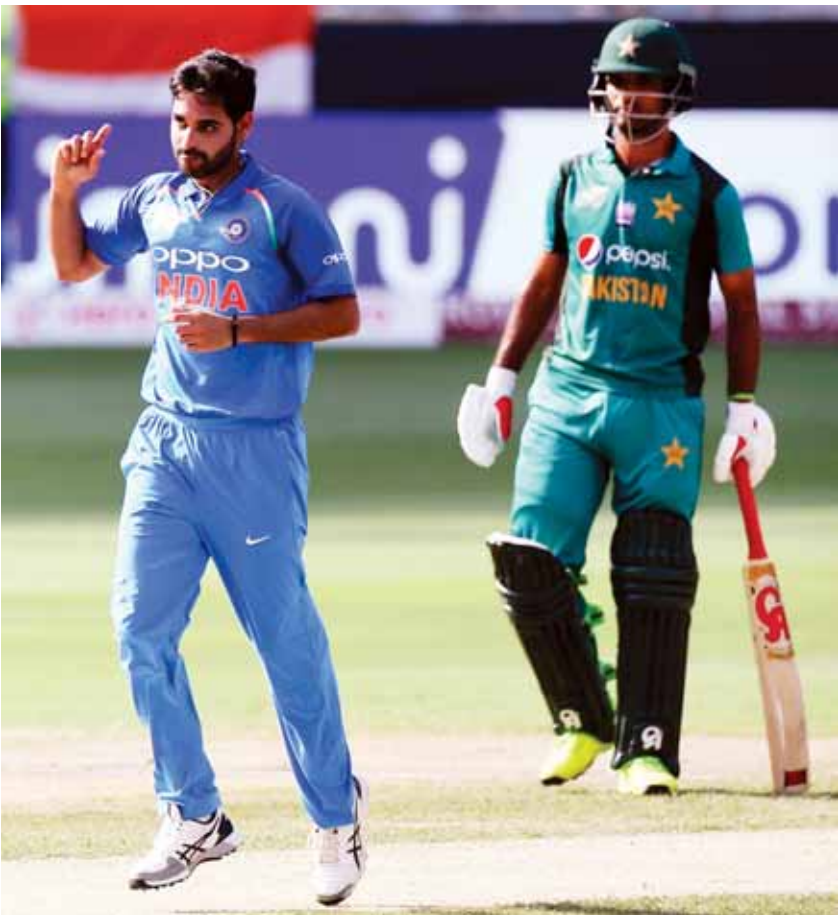
Bhuvneshwar Kumar, left, celebrates after dismissing Imam-ul-Haq during the Asia Cup match between India and Pakistan; Kedar Jadhav celebrates after Shoaib Malik's runout

Imam charged to a short of length delivery that climbed on him and the thickish outside edge was taken by Dhoni. Zaman, India's tormentor in the Champions Trophy, mistimed a pull-shot and Yuzvendra