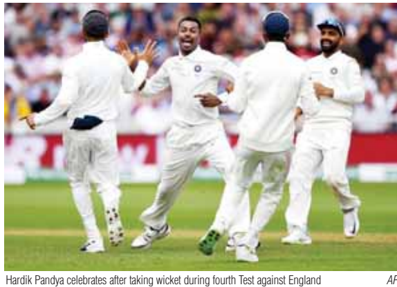
Hardik Pandya celebrates after taking wicket during fourth Test against England

Faheem and Aamir did try their bit as Pakistan crossed the 150-run mark before Bhuvneshwar and Bumrah wrapped up the tail in the 44th over.