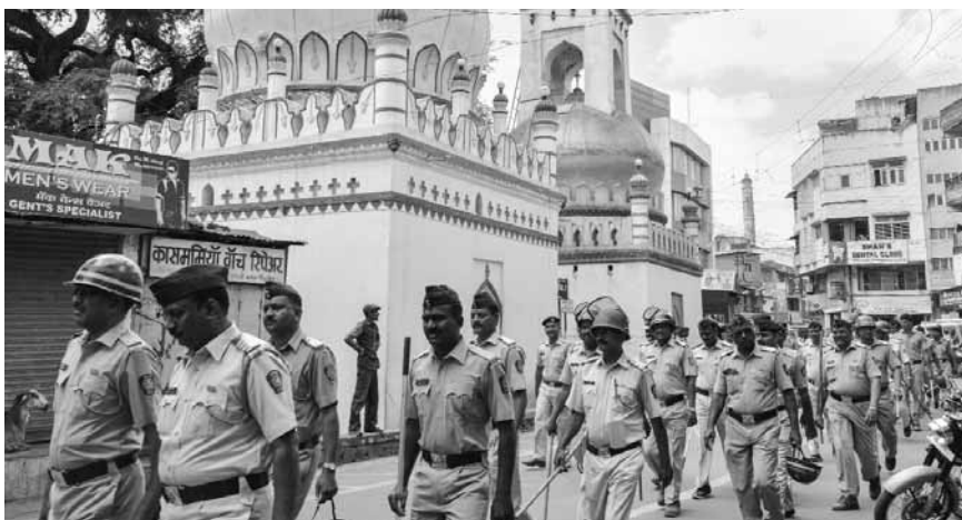
Police conduct march in a sensitive locality on the eve of Muharram in Karad, Maharashtra on Wednesday