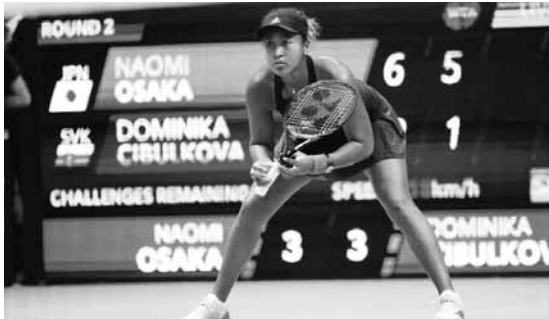
Naomi Osaka plays against Dominika Cibulkova during the second round match

But she made hard work of it, trashing a racquet in frustration as she slipped behind 4-1 in the deciding set before clawing her way back.