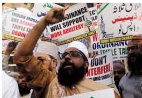
Muslim men shout slogans against Ordinance in Mumbai on Wednesday

Briefing the media, Union Law Minister Ravi Shankar Prasad said this Ordinance was "compelling necessity" to protect the rights of Muslim women. Under the proposed Ordinance, giving instant triple talaq will be illegal and void