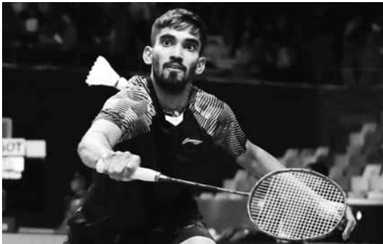
Indian shuttler Kidambi Srikanth plays a shot during World Championship