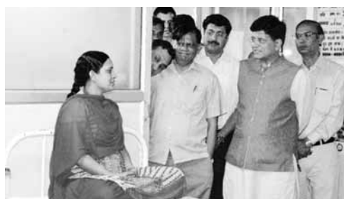
Minister of Railway and Coal Piyush Goyal on Wednesday visited Northern Railway Central Hospital, New Delhi as part of 'Swachchhata Hi Sewa' programme on Sewa Divas. During his visit, he inspected the quality of healthcare that is being extended to the railway staff

Video consumption in India has increased 5X between 2016 and 2017, with smaller cities registering up to 22X growth. In the first-of-its-kind initiative, Bajaj Finserv will take its first step towards leveraging the remarkable growth in online video consumption.