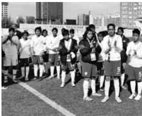
Indian women players celebrates after win

"This is exactly what the fans want to see," said Inter coach Luciano Spalletti. Icardi scored a magnificent goal. The team had a great game and really went for it in the end."