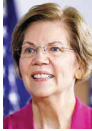
Senator Elizabeth Warren

Leading Democratic presidential aspirants – Senators Bernie Sanders and Elizabeth Warren – and two other US lawmakers have come out in support of Indian-American Congresswoman Pramila Jayapal, who claims External Affairs Minister S Jaishankar cancelled his meeting with a Congressional committee as she was invited to be a part of that group.