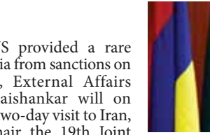
Ministry said in another statement.

The Chabahar port -- jointly being developed by India, Iran and Afghanistan -- is considered a gateway to golden opportunities for trade with central Asian nations by the three countries. It is located on the Indian Ocean in the Sistan and Baluchestan province of Iran.