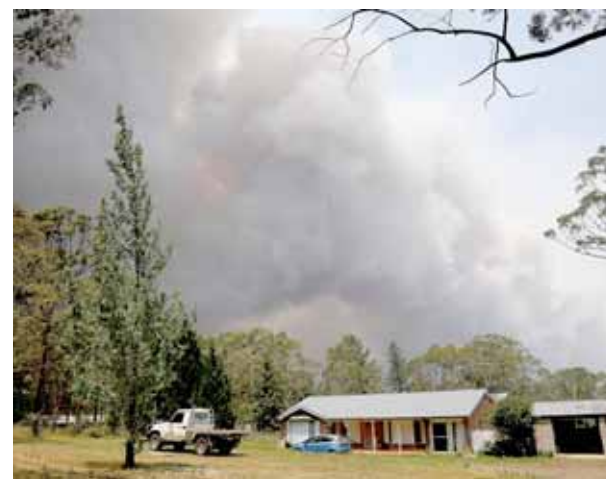
A home stands as smoke from the Grose Valley fire rises in the distance in Bilpin, west of Sydney, on Saturday.