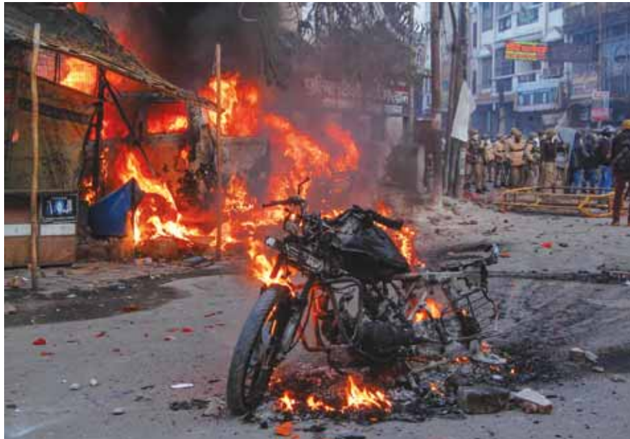
A vehicle torched by protesters during a demonstration against the Citizenship Amendment Act, in Kanpur on Saturday.

Police post torched in Kanpur, 57 cops receive gunshot injuries; internet curbs extended in 15 dists till Monday