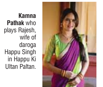
Kamna Pathak who plays Rajesh, wife of daroga Happu Singh in Happu Ki Ultan Patlan.