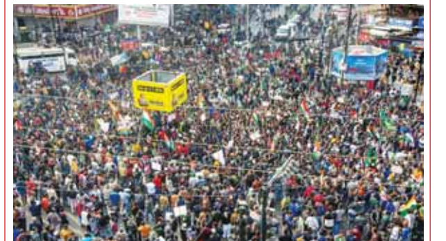
Protesters take part in a demonstration against NRC and Citizenship Amendment Act in Patna on Saturday.