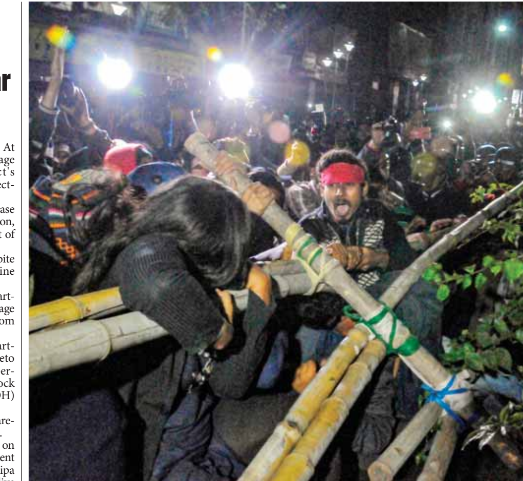
Jadavpur, Presidency and other college and university students break the barricade in front of State BJP headquarters during their protest rally against CAA (Citizen Amendment Act) and NRC in Kolkata on Saturday.