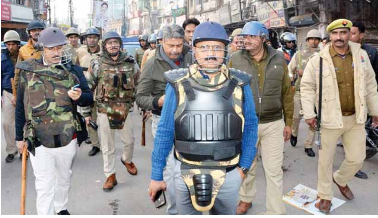
Senior police officers conducting a route march near Akbari Gate on Saturday

A large number of people, including women, assembled near Akbari Gate around 11 am to hold a demonstration against police atrocities. The protest remained peaceful till 3 pm after which the protesters started shouting anti-government slogans on seeing a police team approach them. Sources said only mild force was used to disperse the protesters to prevent the situation going out of control. There were no reports of injuries or damage to the property.