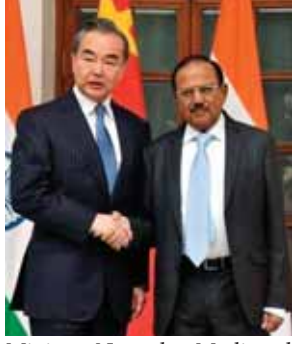
Minister Narendra Modi and Chinese President Xi Jinping held the second informal summit in Mamallapuram in October as well as after New Delhi pulled out of the proposed Regional Comprehensive Economic Partnership (RCEP). Doval and Wang are the designated Special Representatives of the two countries for the boundary talks.

It is the first high-level visit from China to India after Prime Minister Narendra Modi and Chinese President Xi Jinping at Wuhan in April 2018 had led to "strategic guidance" to the two militaries to actively defuse troop confrontations during patrolling in accordance with existing protocols and mechanisms.