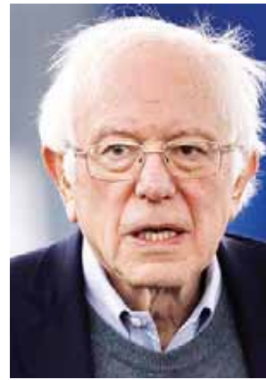
Senator Bernie Sanders