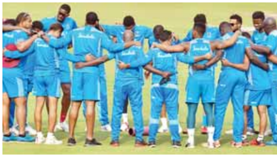
Windies players chat during team's practice session at Barabati stadium

"I think all the guys know we want to play our best tomorrow (on Sunday) and even though we play our best,