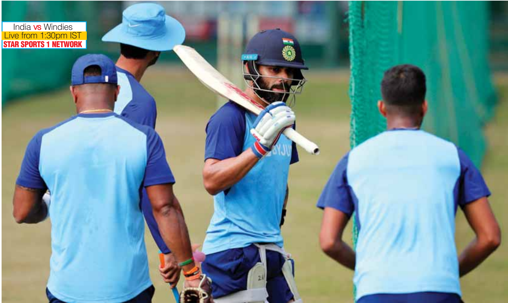
Indian captain Virat Kohli, center, gestures during a training session ahead of final ODI between Indian and West Indies at Barabati stadium in Cuttack

Hetmyer, who struck a career-best 139 in Chennai, was over the moon and danced in excitement after being bought for ₹7.75 crore by Delhi Capitals in the IPL auction. His teammate Sheldon Cottrell also took home a hefty paycheck after the left-arm pacer was bought for ₹8.5 crore by Kings XI Punjab, and the Windies duo will