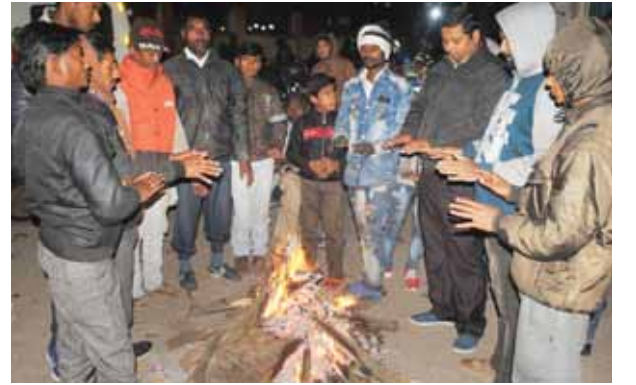
The chill was back in the evening on Saturday and people were seen around bonfires at various points

Sunny skies brought in some relief to residents on Saturday though the chill made a comeback in the evening. The state capital recorded the maximum temperature at 20.3 degree Celsius, which was four notches below normal. The minimum temperature at 7.1 degree Celsius was a couple of notches below normal.