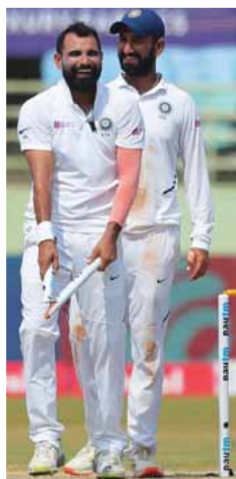
Mohd Shami celebrates after taking wicket