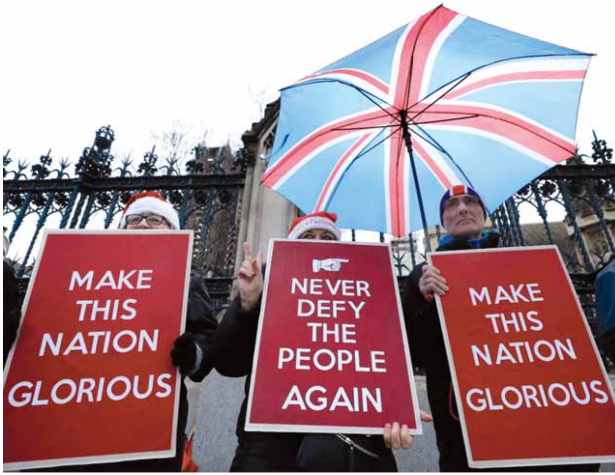
Pro-Brexit demonstrators hold banners outside Parliament in London on December 20, 2019

Now what lies ahead for Corbyn and his Labour Party? After the shocking election debacle, his party has claimed it won the argument and dismissed those who voted against it as morally inferior. Now, the Labour MPs and their supporters are likely to fight for an alternative brand of leadership as he has already signalled that he is not going to be the party face in future elections.