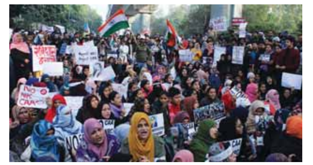
Protesters hold placards as they raise slogans during a demonstration against the CAA outside Jamia Millia Islamia in New Delhi on Saturday.

Thousands of students of Jamia Millia Islamia on Saturday staged a demonstration yet again outside the campus. The protesters were joined