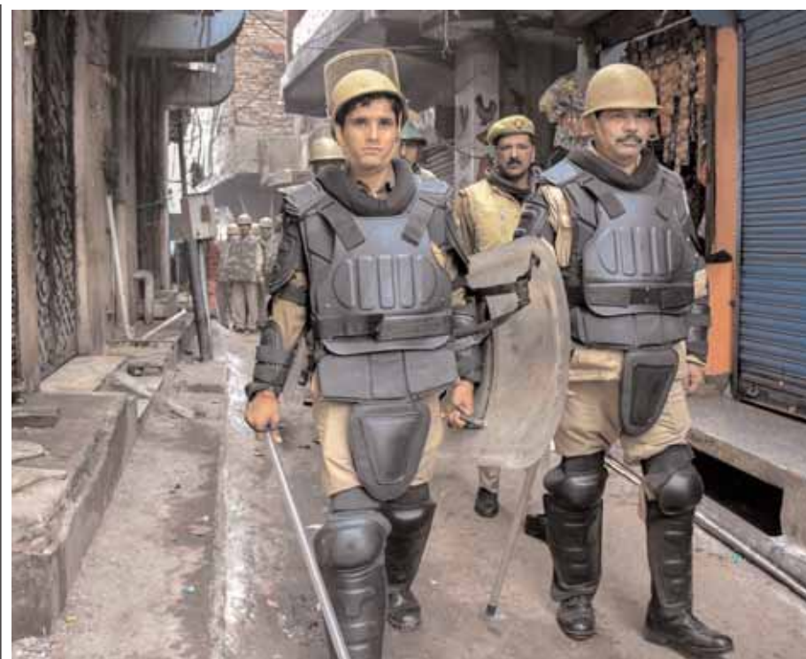
Police personnel conduct a flag march during the ongoing protest against Citizenship (Amendment) Act in Mathura on Saturday