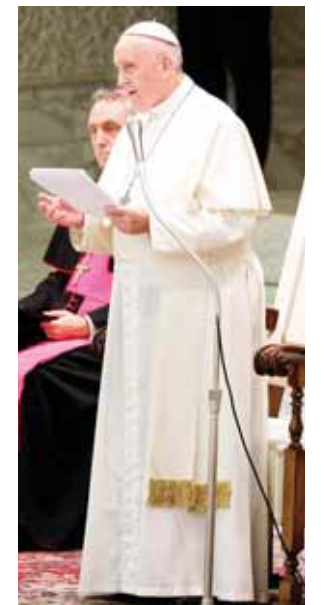
Pope Francis delivers his message on the occasion of his Christmas greetings to Vatican employees, in the Pope Paul VI Hall, at the Vatican, on Saturday.

Morrison, who critics have deemed a climate change skeptic, conceded earlier this month that "climate change along with many other factors" has contributed to the wildfires.