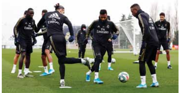
Real Madrid players train ahead of La Liga clash against Athletic Bilbao