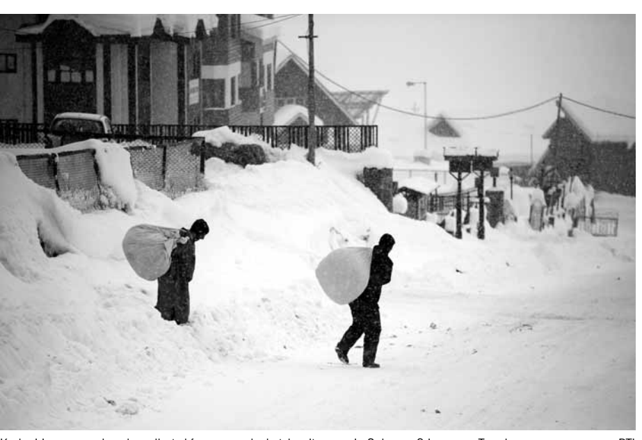
Kashmiri men carry laundry collected from a near by hotel as it snows in Gulmarg, Srinagar on Tuesday

still has the backing of 74 MLAs. The BJP has 61 members and the party has support from 12 MLAs of the Bodoland People's Front and the sole Independent member. The Opposition Congress and the All India United Democratic Front (AIUDF) have 25 and 13 members respectively. "The BJP won many seats in the Assembly elections (in 2016) only due to the AGP. The AGP protested against the bill ever since it was proposed," the AGP founder said. The controversial Citizenship (Amendment) Bill