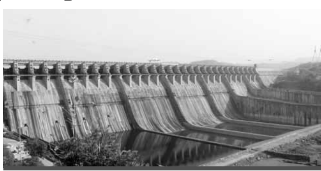
These projects include — Sardar Sarovar in Gujarat, Indira Sagar Polavaram project in Andhra Pradesh, Gosikhand irrigation project in Maharashtra, Shahipur Kandi dam in Punjab, Saryu Nahar Pariyojna in Uttar Pradesh, Teesta Barrage in West Bengal, Dhansiri project in Assam, Kosi Barrage in Bihar, Gumani Barrage in Jharkhand and Rukura Indira Irrigation project in Odisha

As many as 100 irrigation-related projects pending for about two decades now due to several issues, including political, have cost the Government exchequer a mind-boggling ₹1,20,772.05 crore. These projects include some of the famous and significant ones like Sardar Sarovar in Gujarat, Indira Sagar Polavaram project in Andhra Pradesh, Gosikhand irrigation project in Maharashtra, Shahipur Kandi dam in Punjab, Saryu Nahar Pariyojna in Uttar Pradesh, Teesta Barrage in West Bengal, Dhansiri project in Assam, Kosi Barrage in Bihar, Gumani Barrage in Jharkhand and Rukura Indira Irrigation project in Odisha. A performance audit of the Accelerated Irrigation