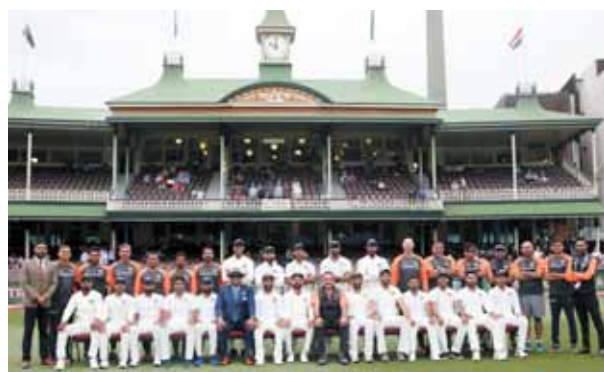
The Indian cricket team and support staff pose for a photo

Although Cheteshwar Pujara was adjudged man of the series for being the series' top-scorer, India's traditionally