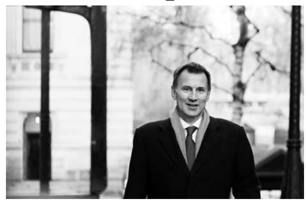
Britain's Foreign Secretary Jeremy Hunt arrives for a cabinet meeting in Downing street in London on Tuesday

"Article 50 will not be extended. We are leaving the EU on the 29th of March this year, because that's what Article