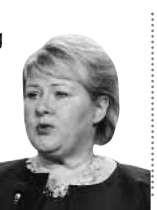
Norway Prime Minister —Erna Solberg

We (Norway) will intensify cooperation on issues relating to the sea, including a new joint task force on the blue economy focussing on integrated ocean management.