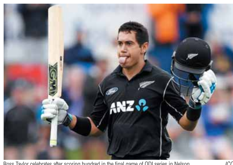
Ross Taylor celebrates after scoring hundred in the final game of ODI series in Nelson ICC