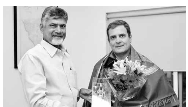
Andhra Pradesh Chief Minister N Chandrababu Naidu met Congress president Rahul Gandhi at latter's residence in New Delhi and is learnt to have discussed plans of uniting all Opposition parties against the BJP. Naidu also met Delhi Chief Minister Arvind Kejriwal, NCP's Sharad Pawar and NC leader Abdullah. Ever since the TDP moved out of the NDA, Naidu has been seeking to forge an anti-BJP front