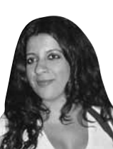
Filmmaker —Zoya Akhtar

Actors get paid a lot while technicians don't get paid enough. This should change because a good film needs every single member of that team.