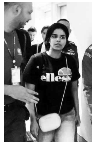
to reach Australia.

The official did not confirm or deny if the visa had been revoked, but said it would make no difference to her bid