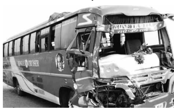
PNS ■ CUTTACK/ JAJPUR/ DHENKANAL

At least five persons were killed and 16 others sustained injuries in separate road accidents in Cuttack, Jajpur and Dhenkanal districts on Tuesday. A speeding container truck hit an iron-laden stationary trailer from rear on NH-16 near Bainchua village in Cuttack district killing the driver and helper of the truck. Fire Services personnel and police recovered the bodies from the mangled vehicle using gas cutter and sent the victims to the SCB Medical College Hospital, Cuttack, for postmortem. In another incident, a person died and 15 others were injured when a bus by which they were travelling rammed into a truck from rear on the Brahmani river bridge under