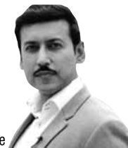
I&B Minister —Rajyavardhan Rathore

The decision to allow private FM channels to broadcast AIR news empowers me as a citizen. What else does a democracy need?