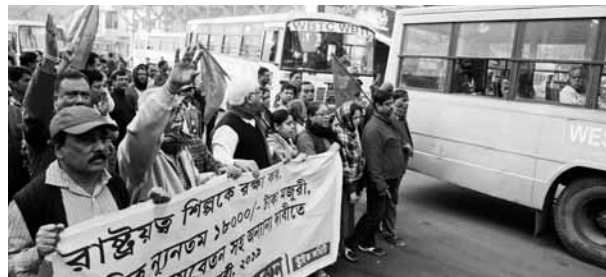
Left-sponsored trade union activists participate in a demonstration on the first day of a two-day general strike called by various trade unions in Kolkata on Tuesday

Railway services particularly the suburban train ser-