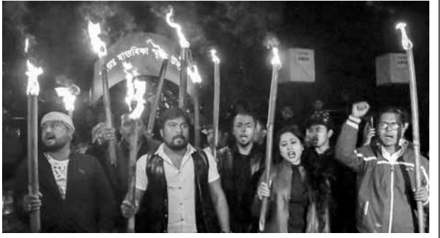
Activists take out a torch light vigil in protest against Citizenship (Amendment) Bill, 2016 in Guwahati on Tuesday

Guwahati: A day after pulling out of the BJP-led Government in Assam over the Citizenship Amendment Bill, the AGP on Tuesday demanded the resignation of Chief Minister Sarbananda Sonowal and dared the saffron party to face fresh polls. The Sonowal Government has no moral right to continue and if the Bharatiya Janata Party (BJP) has the courage, it should face fresh election, senior Asom Gana Parishad (AGP) leader and former chief minister Prafulla Kumar Mahanta said here. "The BJP-led Government was formed in Assam on the basis of a pre-poll alliance with the AGP. As this alliance no longer exists now, we demand that the current Assam Government be dissolved," Mahanta told reporters. Accusing the BJP of adopting an anti-Assam policy, Mahanta said, "Let the BJP form a new Government alone. We will welcome that". Withdrawal of the AGP, which has 14 MLAs in the 126-member Assembly, would not have any immediate effect on the future of the Sarbananda Sonowal-led Government that