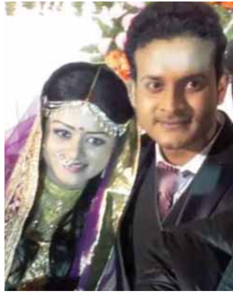
Lipan was remanded in judicial custody on the evening after he was denied bail by a lower court.

Basing on circumstantial evidences and the statements given by the family members and neighbours, police found Lipan guilty in the death of the TV serial actress.