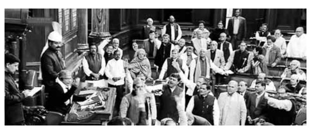
A view of the Rajya Sabha Session on Tuesday