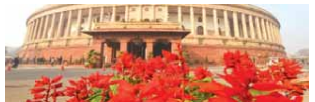
Flowers blossom at Parliament house during the ongoing Winter Session of Parliament in New Delhi on Tuesday

Gehlot claimed that the Bill is in line with Prime Minister Narendra Modi's assertion when he assumed power in 2014 that his Government would be devoted to the cause of the poor and work for "sabka saath sabka