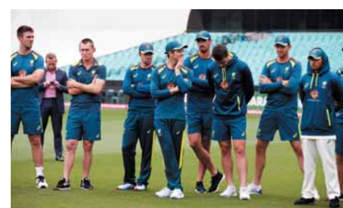
Australian team members stand by as India's Virat Kohli accepts the winners trophy

That the IPL will stay in the country was first hinted by BCCI officials during the players' auction in Jaipur last month.