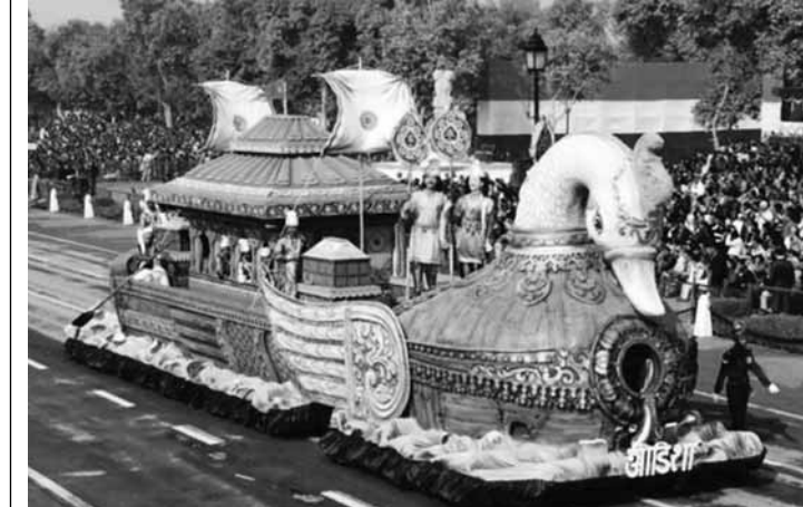
PNS ■ BHUBANESWAR

In a major disappointment for the people of Odisha, no tableau of the State will be displayed in the Republic Day parade at Rajpath in New Delhi on January 26. A special committee of the