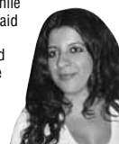
Filmmaker —Zoya Akhtar

Actors get paid a lot while technicians don't get paid enough. This should change because a good film needs every single member of that team.