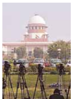
passed an order on October 29 relating to the hearing of the matter.

As many as 14 appeals have been filed in the apex court against the 2010 Allahabad High Court judgment, delivered in four civil suits, that the 2.77-acre land be partitioned equally among the three parties -- the Sunni Waqf Board, the Nirmohi Akhara and Ram Lalla.