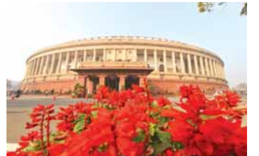
Flowers blossom at Parliament house during the ongoing Winter Session of Parliament in New Delhi on Tuesday

Gehlot claimed that the Bill is in line with Prime Minister Narendra Modi's assertion when he assumed power in 2014 that his Government would be devoted to the cause of the poor and work for "sabka