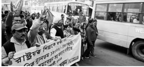
Left-sponsored trade union activists participate in a demonstration on the first day of a two-day general strike called by various trade unions in Kolkata on Tuesday

Railway services particularly the suburban train ser-