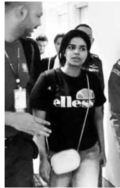
to reach Australia.

The official did not confirm or deny if the visa had been revoked, but said it would make no difference to her bid