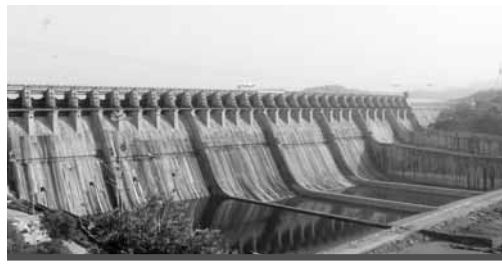
These projects include — Sardar Sarovar in Gujarat, Indira Sagar Polavaram project in Andhra Pradesh, Gosikhand irrigation project in Maharashtra, Shahipur Kandi dam in Punjab, Saryu Nahar Pariyojna in Uttar Pradesh, Teesta Barrage in West Bengal, Dhansiri project in Assam, Kosi Barrage in Bihar, Gumani Barrage in Jharkhand and Rukra Indira Irrigation project in Odisha

According to performance audit, the cost of Sardar Sarovar project was revised from ₹39,240.45 crore in May 2010 to ₹54,772.94 crore with stipulated completion by March 2020. This led to an increase in project cost by ₹15,532.49 crore (40 per cent) of which increase of ₹5,722.29 crore alone was