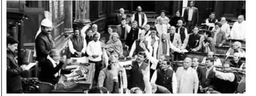
A view of the Rajya Sabha Session on Tuesday