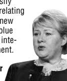
Norway Prime Minister —Erna Solberg

We (Norway) will intensify cooperation on issues relating to the sea, including a new joint task force on the blue economy focussing on integrated ocean management.