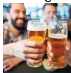
and clubs in the national Capital on December 31," the official said.

"16,59,636 bottles of liquor were sold by all entities, including liquor shops, resto-bars