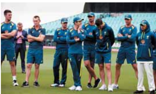
Australian team members stand by as India's Virat Kohli accepts the winners trophy

That the IPL will stay in the country was first hinted by BCCI officials during the players' auction in Jaipur last month.