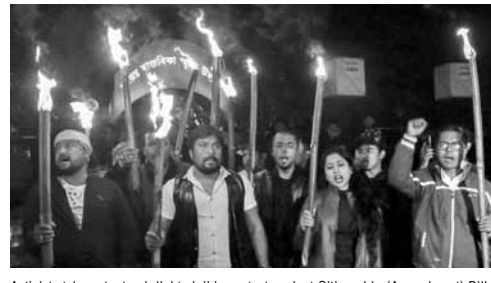
Activists take out a torch light vigil in protest against Citizenship (Amendment) Bill, 2016 in Guwahati on Tuesday

Guwahati: A day after pulling out of the BJP-led Government in Assam over the Citizenship Amendment Bill, the AGP on Tuesday demanded the resignation of Chief Minister Sarbananda Sonowal and dared the saffron party to face fresh polls. The Sonowal Government has no moral right to continue and if the Bharatiya Janata Party (BJP) has the courage, it should face fresh election, senior Asom Gana Parishad (AGP) leader and former chief minister Prafulla Kumar Mahanta said here. "The BJP-led Government was formed in Assam on the basis of a pre-poll alliance with the AGP. As this alliance no longer exists now, we demand that the current Assam Government be dissolved," Mahanta told reporters. Accusing the BJP of adopting an anti-Assam policy, Mahanta said, "Let the BJP form a new Government alone. We will welcome that". Withdrawal of the AGP, which has 14 MLAs in the 126-member Assembly, would not have any immediate effect on the future of the Sarbananda Sonowal-led Government that