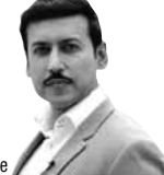
I&B Minister —Rajyavardhan Rathore

The decision to allow private FM channels to broadcast AIR news empowers me as a citizen. What else does a democracy need?