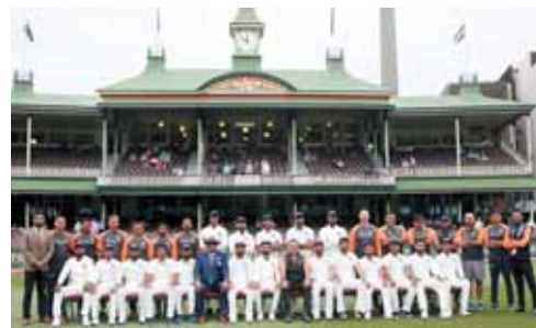
The Indian cricket team and support staff pose for a photo

Although Cheteshwar Pujara was adjudged man of the series for being the series' top-scorer, India's traditionally