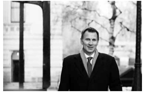
Britain's Foreign Secretary Jeremy Hunt arrives for a cabinet meeting in Downing Street in London on Tuesday.

"Article 50 will not be extended. We are leaving the EU on the 29th of March this year, because that's what Article