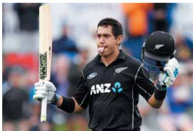
Ross Taylor celebrates after scoring hundred in the final game of ODI series in Nelson