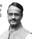
UP Deputy CM —Dinesh Sharma

We will not hesitate in imposing the NSA on those who run gangs that aid the use of unfair means during board exams and mass-copying antics.