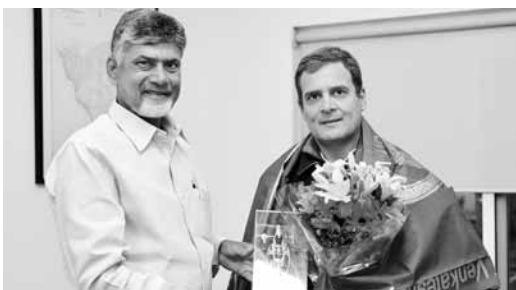
Andhra Pradesh Chief Minister N Chandrababu Naidu met Congress president Rahul Gandhi at latter's residence in New Delhi and is learnt to have discussed plans of uniting all Opposition parties against the BJP. Naidu also met Delhi Chief Minister Arvind Kejriwal, NCP's Sharad Pawar and NC leader Abdullah. Ever since the TDP moved out of the NDA, Naidu has been seeking to forge an anti-BJP front

In few parts of Odisha too, bird flu has taken its toll on poultry birds. The State Government has declared areas in Kendrapara district bird flu hit and had vaccinated 35,000 poultry birds. As a precautionary measure, the Naveen Patnaik Government has asked schools and Anganwadi Centres not to provide eggs to children. Similarly, sale of eggs and chicken has been banned in Krushna Prasad block for next few days, said an official from the State Government.