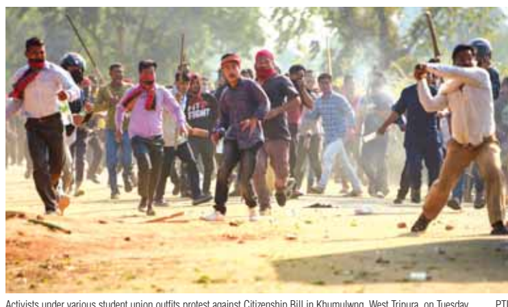
Activists under various student union outfits protest against Citizenship Bill in Khumulwng, West Tripura, on Tuesday

Piloting the Citizenship (Amendment) Bill 2019, Union Home Minister Rajnath Singh told the Opposition that the Bill was not against the provisions of the Constitution and would give succour to persecuted