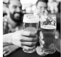
and clubs in the national Capital on December 31, the official said.

PTI ■ NEW DELHI Delhiites partied hard to welcome 2019, gulping down over 16.5 lakh liquor bottles on the eve of New Year.