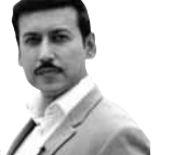
I&B Minister —Rajyavardhan Rathore

The decision to allow private FM channels to broadcast AIR news empowers me as a citizen. What else does a democracy need?