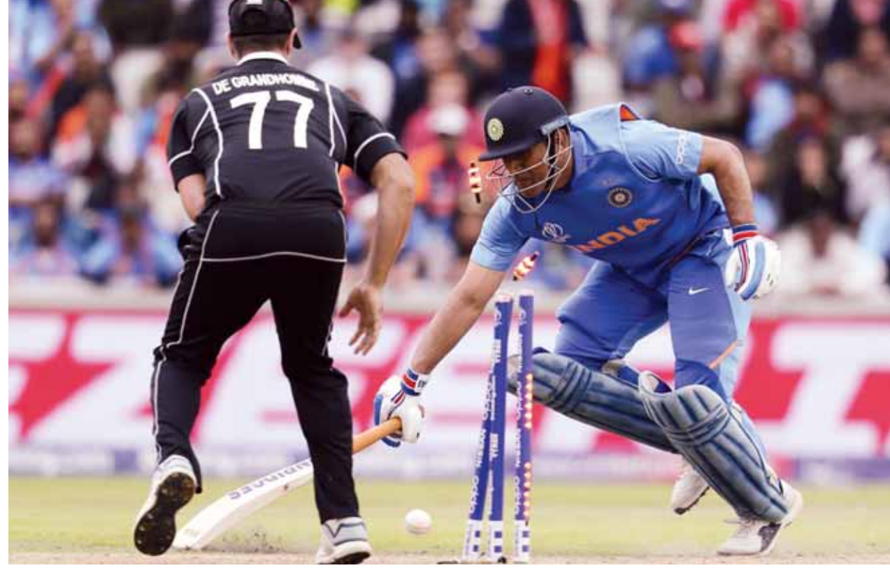
Mahendra Singh Dhoni is run out via a direct throw from Martin Guptill during the Cricket World Cup first semifinal match between India and New Zealand at Old Trafford in Manchester on Wednesday

or what could have been more fickle than England's weather, the