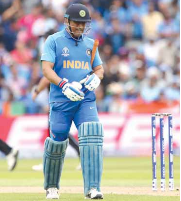
MS Dhoni leaves the field after being dismissed during Cricket World Cup semi-final match at Old Trafford in Manchester on