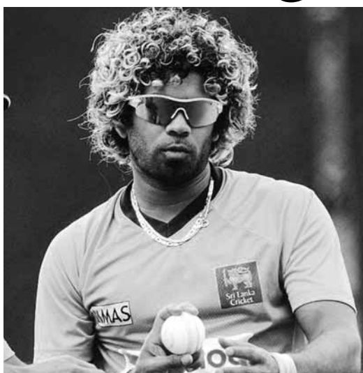
Lasith Malinga during practice session

cerned about. Whoever is batting or bowling, he has to have a perfect game. "We need a must-win game in this competition, we need a must-win game tomorrow. We will try our best in accuracy and tactically, everything hopefully will be there tomorrow. "The most important thing we need is patience, patience is very important. We know these conditions, we can have someone get 60, 70 runs and still some balls can move. "We have to have a bit of patience; we have to analyse the conditions. Whoever is the batsman, he has to finish the game. It's down to whoever is there, he has to finish the game. "Whoever takes responsibility, bowler or batsman, whoever is the best tomorrow will win. Afghanistan have good experience players because most of the players play in franchise cricket. They have that experience, they know how to accelerate and