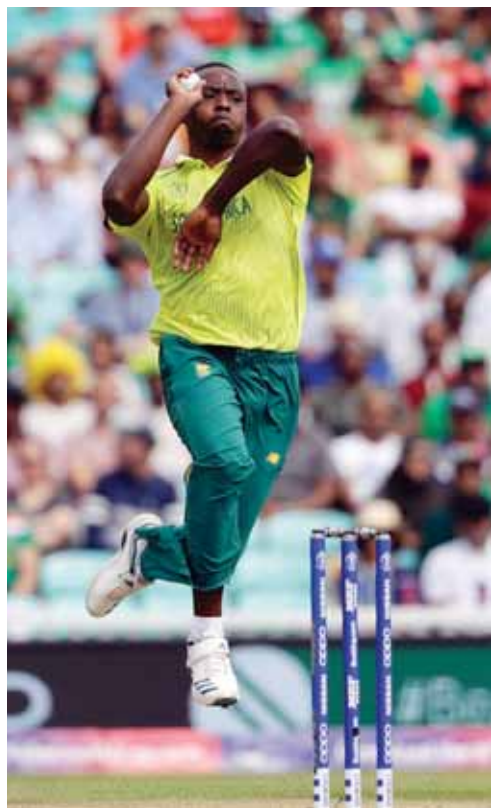
Kagiso Rabada in action during Bangladesh clash at The Oval on Sunday

When asked about his perfect executions at the death, Rabada said that more than all the homework done, it is all about what works at any given moment.