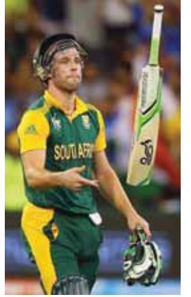
AB de Villiers in a file picture