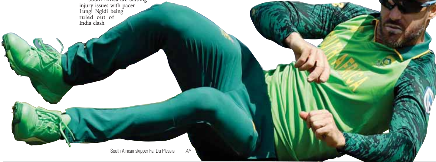
South African skipper Faf Du Plessis

Al Hasan (75 off 84) and Mustafizur Rahman (3/67), who starred for Bangladesh in their 21-run win.