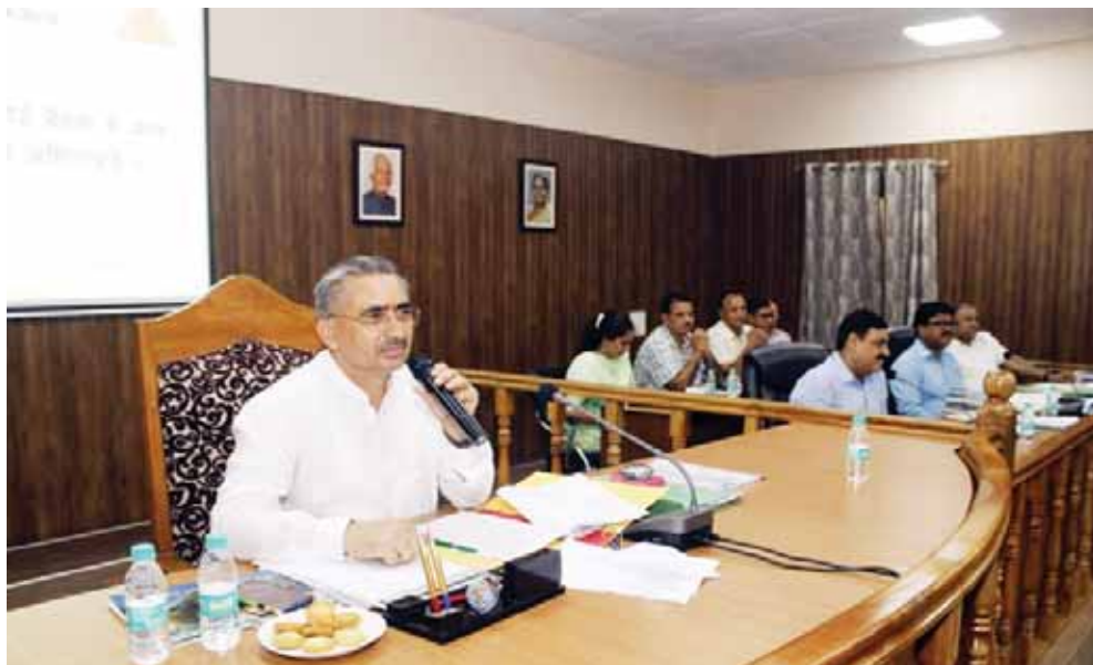
Mayor Sunil Uniyal 'Gama' presides over MCD board meeting on Monday