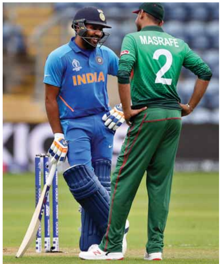
Rohit Sharma, left, interacts with Bangladesh's captain Mashrafe Mortaza during the warm up match between Bangladesh and India ahead of the main tournament at Sophia Gardens in Cardiff on May 28

"There are so many things to prove in this tournament, and we were upto the challenge. The boys were confident,