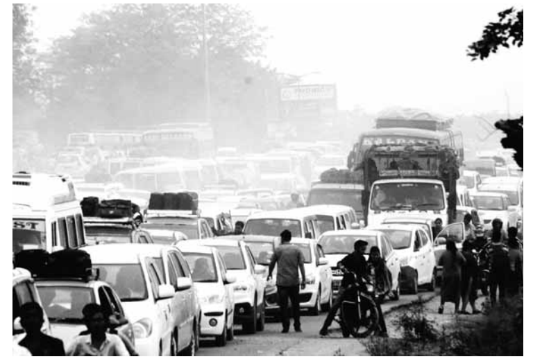
Vehicles crawl in Haridwar with lakhs of people arriving on Somvati Amavasya

merit by taking holy dip. The merit gained is even more than performing 'Ashwamedh yajna'.