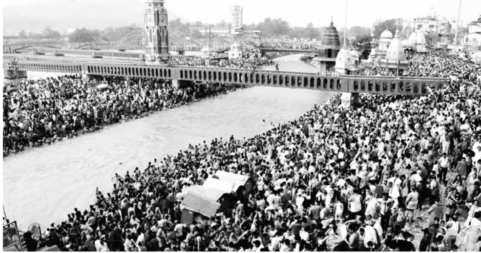
Multitudes throng Har Ki Paudi for a dip on Somvati Amavasya

The period of merit on Somvati Amavasya started on Monday morning and lasted till late evening. Pilgrims from all parts of the country thronged the Ganga river here to gain the merit of having snan on Somvati Amavasya. The people performed tarpan (offering to the ancestors) at Narayani Shila and Kushawart Ghat. It is believed that whatever one offers on this day to the deceased family members, reaches them and one earns