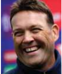
JACQUES KALLIS Former SA All-Rounder

INDIA WILL MAKE SOUTH AFRICA PAY IF THEY COMMIT ANY SILLY MISTAKE. WE'VE GOT TO PLAY ALL OUR CARDS AND WE CAN'T AFFORD ANYMORE SILLY MISTAKES AT VITAL STAGES — THESE ARE THE BEST SIDES IN THE WORLD AND THEY'LL ALWAYS PUNISH YOU