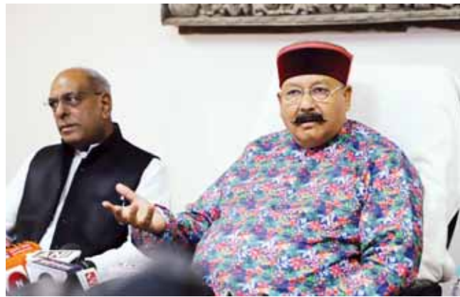
Tourism minister Satpal Maharaj addresses the media along with high commissioner of Mauritius in India, J Goburdhun