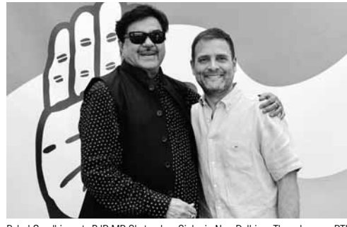
Rahul Gandhi meets BJP MP Shatrughan Sinha in New Delhi on Thursday

Lok Sabha MP Shatrughan Sinha on Thursday ended speculation over his joining the Congress after meeting party president Rahul Gandhi and both sides announced that the BJP rebel will induct himself in Congress next week. Sources said that the joining which was to happen on Thursday itself had to be delayed due to revival of the tension within the RJD and Congress in the Bihar mahagathbandhan. After meeting Rahul Gandhi, Sinha announced he will join the Congress. "Joining will happen soon, we will give you a positive news during Navaratri. I will join Congress now," Sinha said talking to media later. AICC incharge of Bihar Shaktisinh Gohil tweeted that Sinha will join the party on April 6. Sources said that Sinha's joining was marred by the immediate friction between the two major grand alliance partners while RJD complaining that Sinha could have been even RJD's bet. Sinha, Congress and RJD finally decided to abort the move to join and buy peace for sometime. "RJD was said to be keen on having Sinha as its candidate from Patna Sahib constituency. Sinha and RJD supreme Lalu Prasad share a cordial relation. But the Congress has always contested the Patna Sahib seat whenever it allied with the RJD in Bihar. So, the party wanted to field Sinha on its own symbol. This tug-of-war had apparently caused the delay in decision of Sinha joining the grand old party," said a senior Congress leader. Sinha is a two-time sitting BJP MP from Patna Lok Sabha