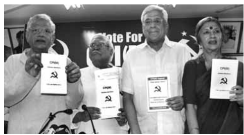
CPI(M) general secretary Sitaram Yechury with party leaders Prakash Karat, Brinda Karat release party's manifesto in on Thursday

New Delhi: The CPI(M) on Thursday proposed curbing of mass surveillance, statutory minimum wage of not less than ₹18,000 per month and checking monopolies over telecom and internet service platforms in its manifesto for the coming Lok Sabha elections.