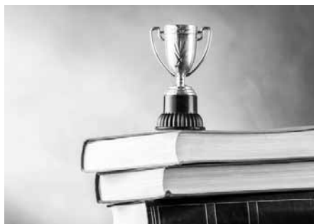
ic adviser to the Government of India). The jury will announce the list of ten titles on September 4, followed by the short list of five titles on October 4. The winner of the ₹25 lakh prize will be announced at the awards dinner on November 2. If the winning work is a translation, the translator will be awarded an additional ₹10 lakh. Each of the five shortlisted authors will receive ₹1 lakh; if a short-listed work is a translation, the translator will receive ₹50,000.