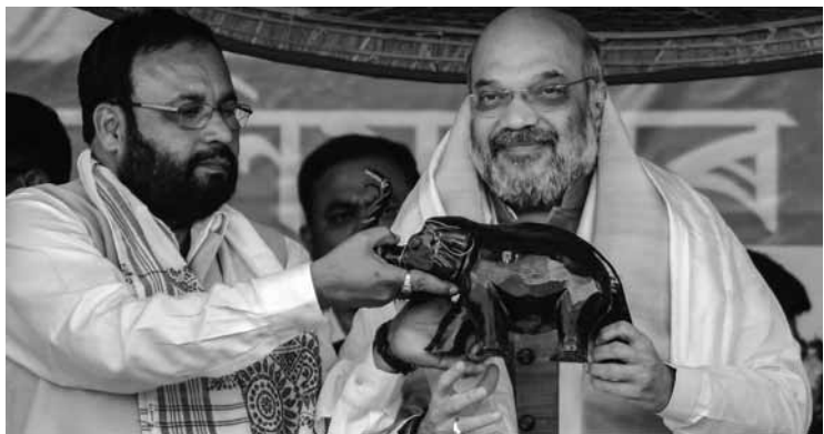
BJP president Amit Shah being felicitated during an election rally ahead of the Lok Sabha elections, in Nagaon, on Thursday

RJD leaders close to him say he is not happy the way Tejashwi Yadav has been given command of the party and with the latter's style of functioning. Tejashwi Yadav is the Leader of Opposition in the Bihar Assembly.