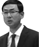
Chinese Foreign Ministry spokesman —Geng Shuang

The US must act cautiously and avoid forcefully moving forward a draft resolution in the UN to blacklist Masood Azhar.