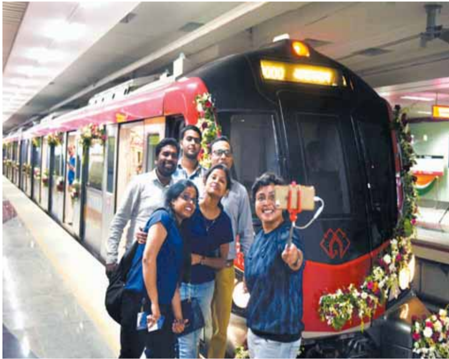
People taking selfies in the back of Metro train in Lucknow on Friday

Gliding past the stations where Metro officials stood in a saluting pose, the train reached Hussainganj underground station at 3:13 pm, Sachivalaya at 3:16 pm and Charbagh at 3:17 pm. The underground stretch remained dark outside as the train smoothly glided through the tunnel and till it finally emerged in front of the DM office at 3:18 pm at KD Singh Babu stadium. The sparkling images of the monuments and