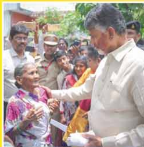
December 2018 onwards. Rs. 24,618 crores disbursed as pensions to 54 lakh beneficiaries till date. Ten-fold increase in pensions under this Government.

The Government of Andhra Pradesh is committed to secure dignified life to all the poor and vulnerable, particularly the old and infirm and to support their minimum needs to bring happiness in their lives. In pursuit of this overarching goal, in spite of the challenging financial conditions, the government increased pensions five-fold as soon as it came into power and recently orders were issued for enhancing the NTR Bharosa Pension amount from Rs. 1000 to Rs. 2000 per month to old age persons, widows, toddy tappers, weavers, single women, fishermen, ART (PLHIV) persons, differently abled persons with 40% to 79% degree of disability, and from Rs. 1,500 to Rs. 3,000 per month to disabled persons with 80% above degree of disability, transgender category and also from Rs. 2,500 to Rs. 3,500 per month to people affected with chronic kidney disease who are undergoing dialysis in both Government and network hospitals. Also, monthly pension of Rs. 3000 for Dappu Artists and Rs. 2000 for traditional cobblers. The new enhanced scale of pension came into effect from