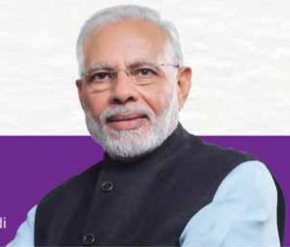
Narendra Modi Prime Minister

“ Self Help Groups give our Nari Shakti the much needed confidence to make their own decisions ”