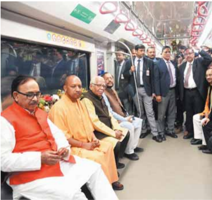
Chief Minister Yogi Adityanath took the inaugural ride of Lucknow Metro along with Governor Ram Naik on Friday after it was inaugurated by Prime Minister Narendra Modi from Kanpur through video-conferencing. The CM and Governor attended Prime Minister's all three functions at Varanasi, Kanpur and Ghaziabad. On return, the CM and Governor took the Metro from the airport and got down at Sachivalaya station. The CM went to Lok Bhawan for Cabinet meeting while the Governor went to Raj Bhawan. It was around 20-minute non-stop ride. There was no rush at the station since the commercial run will begin from Saturday.

She said EIB had the target of having 35 per cent of their lending outside the European Union. "We are working towards the climate agenda," she said. "European Investment Bank welcomes opening of Lucknow Metro, financed with Rs 33 billion long-term loan by us. The construction of the 23-km new Metro line and purchase of a fleet of Metro trains was finished four years ahead of schedule. The line is the first part of an expected broader Metro network planned for Lucknow. Metro is expected to increase the use of public transport from 10% to an estimated 27% in the city with a population of three million," she said.