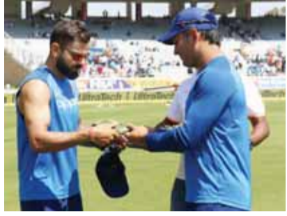
MS Dhoni hands camouflage cap to Virat Kohli BCCI