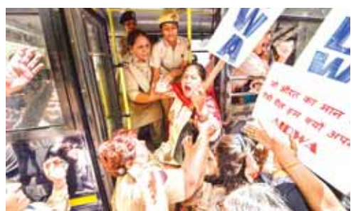
Women being detained for protest against Supreme Court In-house Committee's clean chit to the CJI in the sexual harassment case in New Delhi on Tuesday

Meanwhile, 55 protesters, mostly women lawyers and activists, were detained outside the SC for protesting against the procedure adopted to deal with a sexual harassment case against the CJI. "If the Supreme Court itself is violating the