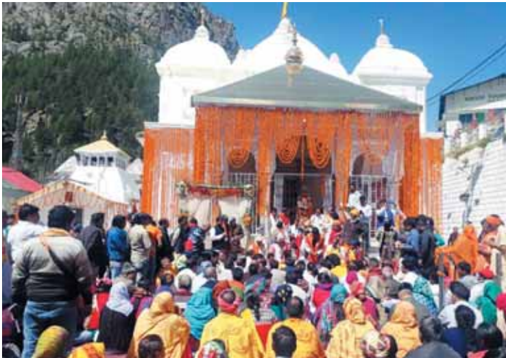
Devotees at the Gangotri shrine during its reopening for the public