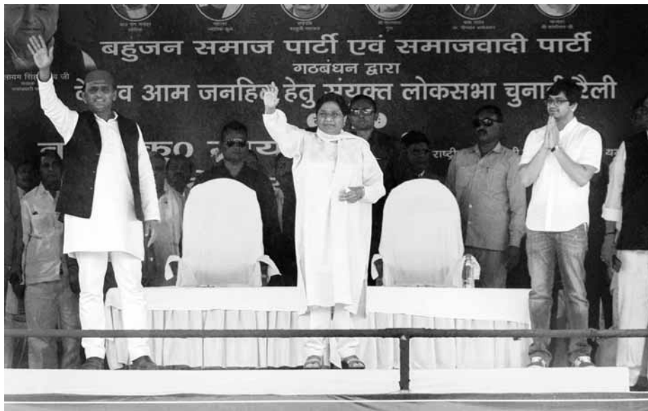
BSP supremo Mayawati and Samajwadi Party president Akhilesh Yadav wave at the supporters during an election campaign rally for the Lok Sabha elections, in Bhadohi, on Tuesday

Referring to the Congress' Nyaya scheme, she said the party which is claiming to provide Rs 6,000 every