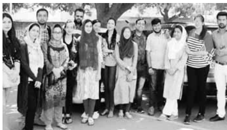
Students of Shri Mata Vaishno Devi University during the industrial visit to Semi-Conductor Laboratory, Chandigarh

He presented a short video clip pertaining to major