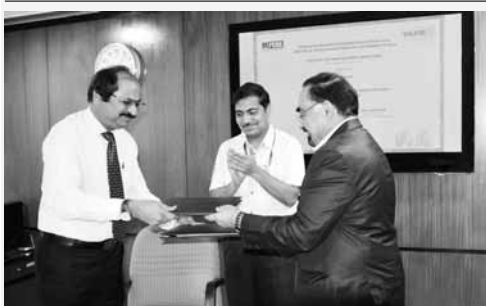
Petroleum Conservation Research Association (PCRA), Ministry of Petroleum & Natural Gas, Government of India and world's third largest tractor manufacturer by volumes, TAFE Tractors and Farm Equipment Limited, signed an MoU to aid conservation of resources across the country