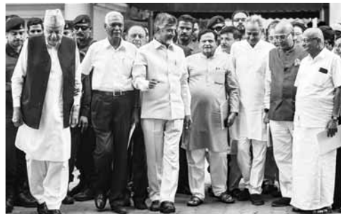
Opposition leaders (L-R) Farooq Abdullah, D Raja, N Chandrababu Naidu, Ahmed Patel, Ashok Gehlot, Abhishek Manu Singhvi and others after meeting with Chief Election Commissioner (CEC) at Nirvachan Bhawan in New Delhi on Tuesday

The Supreme Court has directed the EC to count VVPAT