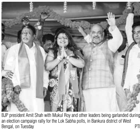
BJP president Amit Shah with Mukul Roy and other leaders being garlanded during an election campaign rally for the Lok Sabha polls, in Bankura district of West Bengal, on Tuesday

A video had appeared in the social media that showed Banerjee stopping her car at a