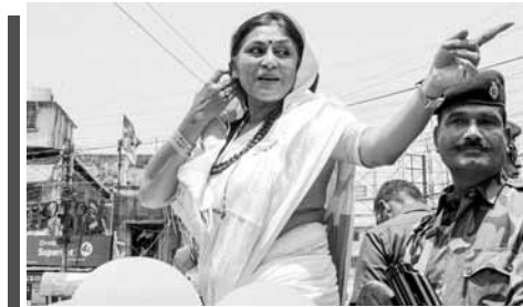
BJP MP Rupa Ganguly during an election campaign roadshow in favour of the party candidate from Jadavpur parliamentary constituency Anupam Hazra (unseen) for the Lok Sabha polls, at Sonarpur in South 24 Parganas district of West Bengal, on Tuesday