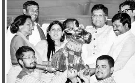
Union Minister and BJP leader Piyush Goyal with party candidate from Allahabad Parliamentary constituency Riba Bahuguna Joshi and other leaders during an election campaign rally, in Prayagraj, on Tuesday