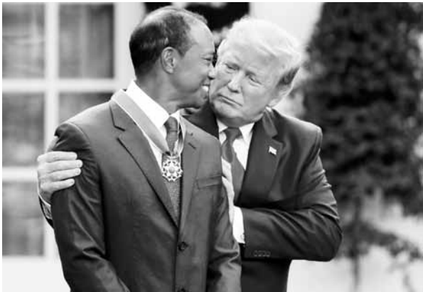
US President Donald Trump presents the Presidential Medal of Freedom to Tiger Woods during a ceremony in the Rose Garden of the White House on Monday

"You have seen the good and the bad, the highs and the lows," said Woods, who battled back from injury to win the Masters last month, his first