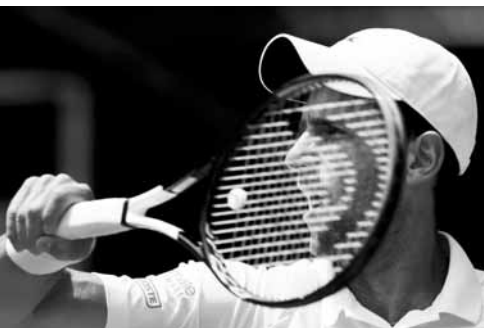
Novak Djokovic returns the ball to Taylor Fritz during the Madrid Open match

"It's a massive week and that's why we need to move on, try to recover as soon as possible and be ready again but whatever happens I am going to feel proud."