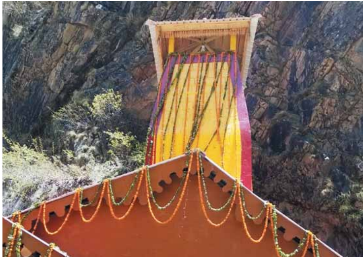
Devotees through the Yamunotri shrine on Tuesday