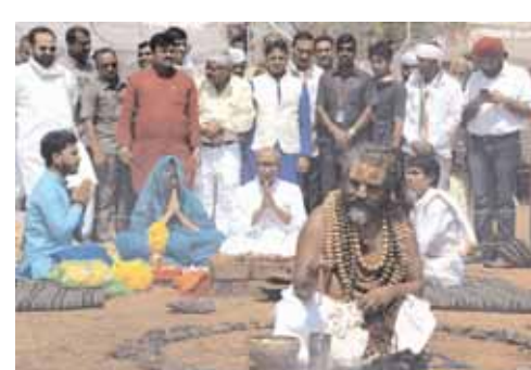
Bhopal Spiritual leader Namdev Das Tyagi, popularly known as Computer Baba, performs puja at the election campaign venue of Congress candidate for Bhopal Lok Sabha seat Digvijaya Singh, in Bhopal on Tuesday