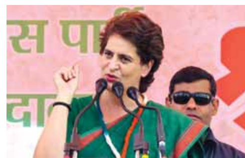
Congress general secretary Priyanka Gandhi Vadra addresses an election rally in Hisar on Tuesday

The Congress leader also dared Modi to fight the Lok Sabha elections on issues like development rather than