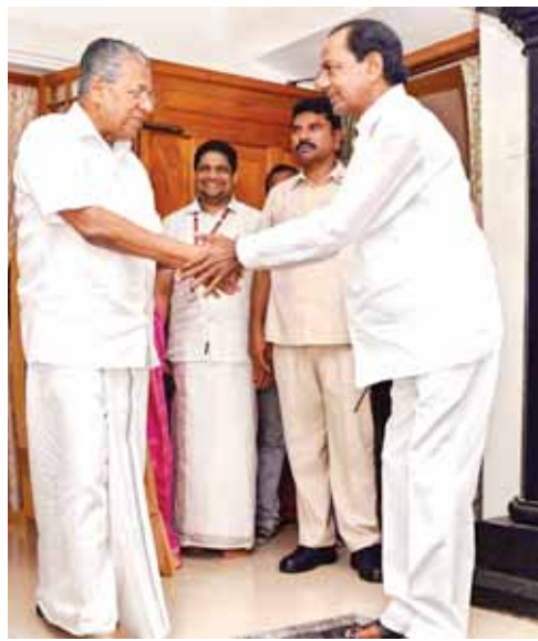
Telangana Chief Minister K Chandrashekar Rao meets his Kerala counterparty Pinarayi Vijayan at latter's residence in Thiruvananthapuram

In March, KCR had mooted the idea of a "federal front" and initiated efforts to provide an alternative to both the BJP and the Congress and subsequently met leaders of Trinamool Congress, Biju Janta Dal, Samajwadi Party, Janata Dal (S) and DMK. Sources said he also invited the YSR