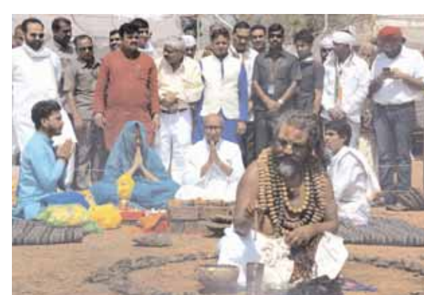
Bhopal Spiritual leader Namdev Das Tyagi, popularly known as Computer Baba, performs puja at the election campaign venue of Congress candidate for Bhopal Lok Sabha seat Digvijaya Singh, in Bhopal on Tuesday

bestowed Minister of State status by the then BJP-led Government in Madhya Pradesh and appointed on a panel to clean the Narmada.