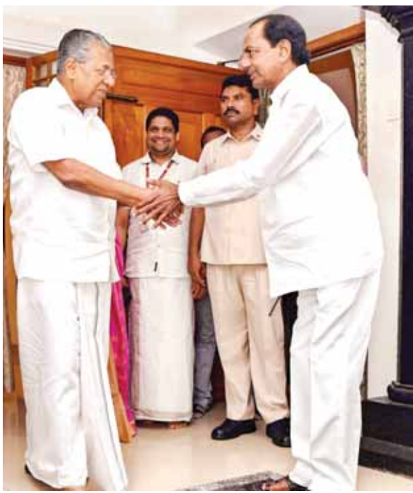
Telangana Chief Minister K Chandrashekar Rao meets his Kerala counterpart Pinarayi Vijayan at latter's residence in Thiruvananthapuram

In March, KCR had mooted the idea of a "federal front" and initiated efforts to provide an alternative to both the BJP and the Congress and subsequently met leaders of Trinamool Congress, Biju Janta Dal, Samajwadi Party, Janata Dal (S) and DMK. Sources said he also invited the YSR