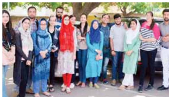
Students of Shri Mata Vaishno Devi University during the industrial visit to Semi-Conductor Laboratory, Chandigarh

He presented a short video clip pertaining to major