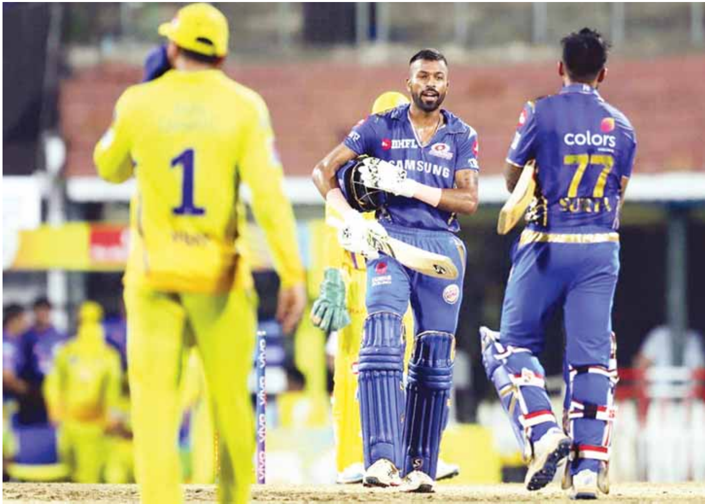
Hardik Pandya celebrates with Mumbai Indians teammate Suryakumar Yadav after he completes single to help his side advance into the final

When Tahir fled, he would whip him through mid-wicket. Deepak Chahar after getting Rohit's wicket erred in line and proved to be costly. Harbhajan Singh (1/25 in 4 overs) finished his quota primarily when at least one left-hander was