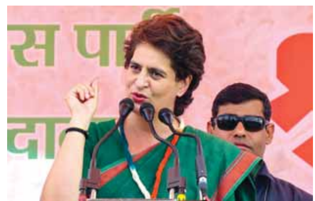
Congress general secretary Priyanka Gandhi Vadra addresses an election rally in Hisar on Tuesday

The Congress leader also dared Modi to fight the Lok Sabha elections on issues like development rather than