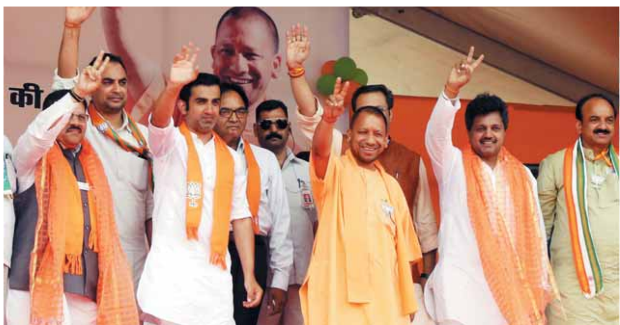
UP CM Yogi Adityanath with party's East Delhi candidate Gautam Gambhir and others during an election rally in New Delhi on Tuesday

He said that Kejriwal attacked the same Congress over corruption and dishonesty before gaining power in Delhi and now it was desperate to "make alliance" with the party. "Their reality is before the public," he said.