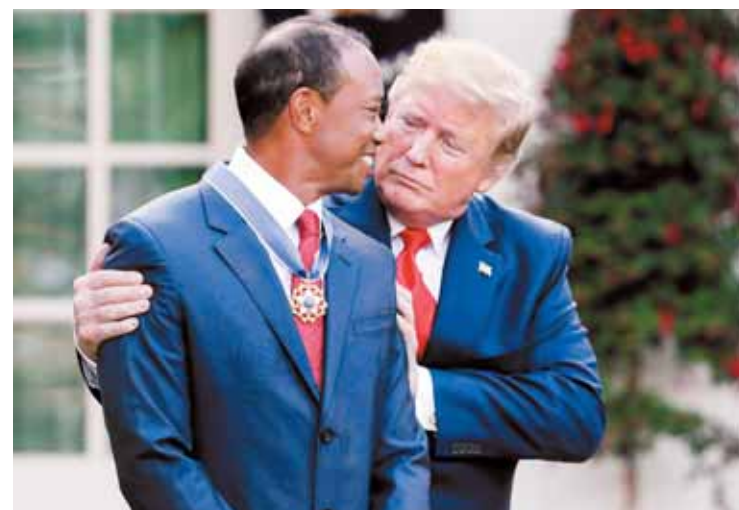
US President Donald Trump presents the Presidential Medal of Freedom to Tiger Woods during a ceremony in the Rose Garden of the White House on Monday

Woods, 43, choked up as he thanked his mother, his two children, his girlfriend and his caddy during the ceremony in the White House Rose Garden. "You have seen the good and the bad, the highs and the lows," said Woods, who battled back from injury to win the Masters last month, his first