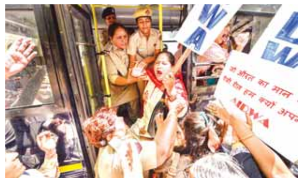
Women being detained for protest against Supreme Court in-house Committee's clean chit to the CJI in the sexual harassment case in New Delhi on Tuesday

Meanwhile, 55 protesters, mostly women lawyers and activists, were detained outside the SC for protesting against the procedure adopted to deal with a sexual harassment case against the CJI. "If the Supreme Court itself is violating the