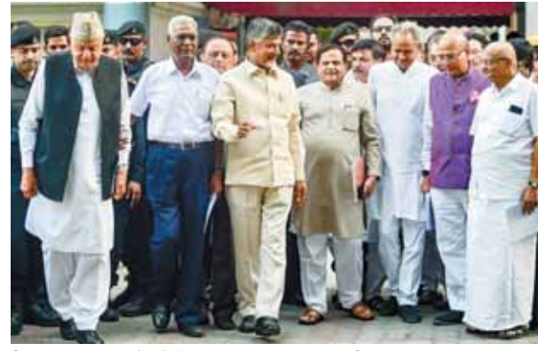
Opposition leaders (L-R) Farooq Abdullah, D Raja, N Chandrababu Naidu, Ahmed Patel, Ashok Gehlot, Abhishek Manu Singhvi and others after meeting with Chief Election Commissioner (CEC) at Nirvachan Bhawan in New Delhi on Tuesday

New Delhi: A delegation of 22 opposition parties, led by Andhra Pradesh Chief Minister N Chandrababu Naidu, on Tuesday approached the Election Commission requesting for verification of all Voter-Verified Paper Audit Trail (VVPATs) in an assembly segment if discrepancy is found in counting of VVPAT slips of five random machines.