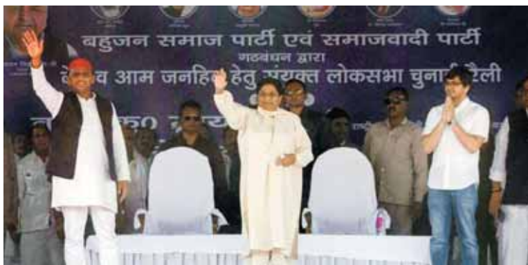
BSP supremo Mayawati and Samajwadi Party president Akhilesh Yadav wave at the supporters during an election campaign rally for the Lok Sabha elections, in Bhadohi, on Tuesday.

BSP supremo Mayawati and SP chief Akhilesh Yadav on Tuesday said their alliance will "shake the very roots" of the BJP and dislodge the "chowkidar of capitalists" from the Prime Minister's chair. Addressing election rallies in favour of Mahagathbandhan candidates in Machchlisahr and Jaunpur seats, they also targeted the Congress, alleging that it is "anti-dalit" like the BJP and wants the people to remain poor. "BJP's guru and chela are all set to be out of power at the Centre," Mayawati said at a rally in Bhadohi, attacking Prime Minister Narendra Modi and BJP chief Amit Shah. "This alliance is so strong that in the 2022 Assembly elections in UP, it will send Yogi baba back in his mutt," Mayawati said, referring to Uttar Pradesh Chief Minister Yogi Adityanath. The BSP supremo alleged that the BJP tried to break their alliance, but she "exposed" it in the media and gave a "befitting reply" to the saffron party. "The BJP is going out of power in these elections... It has failed to fulfil the promises made to the poor and the middle classes in 2014 elections... Despite all this the Prime Minister is seeking