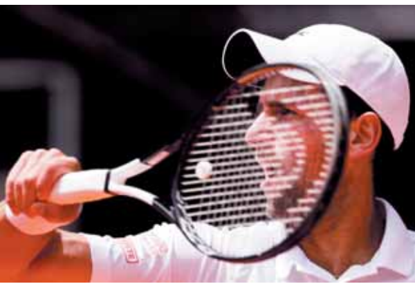
Novak Djokovic returns the ball to Taylor Fritz during the Madrid Open match