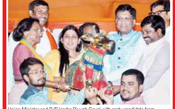
Union Minister and BJP leader Piyush Goyal with party candidate from Allahabad Parliamentary constituency Rita Bahuguna Joshi and other leaders during an election campaign rally, in Prayagraj, on Tuesday.