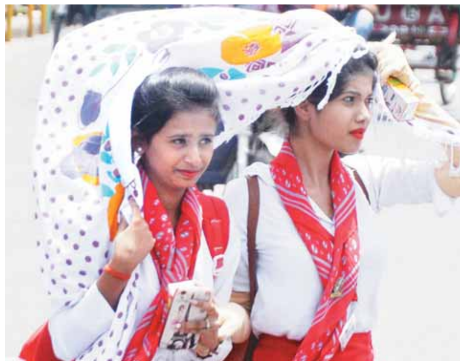
Girls braving hot weather conditions in Lucknow on Wednesday

means a total of 45 VVPAT slips will be counted during the process."