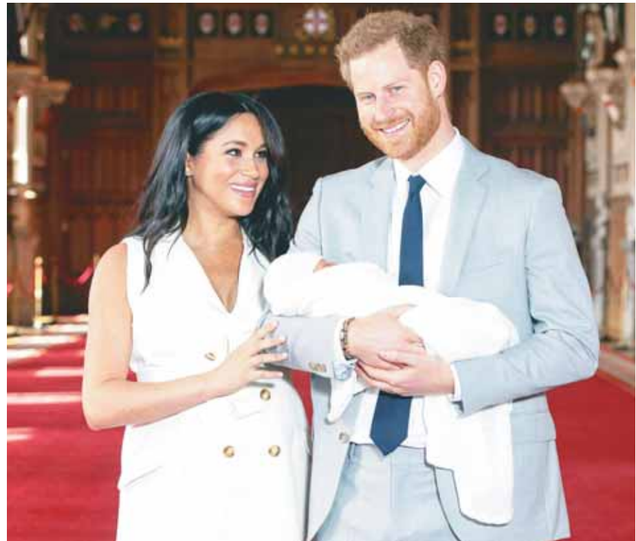
Britain's Prince Harry and Meghan, Duchess of Sussex, during a photocall with their newborn son, in St George's Hall at Windsor Castle, Windsor, south England, Wednesday. Baby Sussex was born Monday at 5:26 a.m. (0426 GMT; 12:26 a.m. EDT) at an as-yet-undisclosed location. An overjoyed Harry said he and Meghan are "thinking" about names.

"Their case is emblematic of investigative journalism's importance for the functioning of democracies. We hail the role played by all those civil society actors who, both in Myanmar and internationally, never forgot the fate of these two journalists and kept fighting for them until this successful outcome," he said.