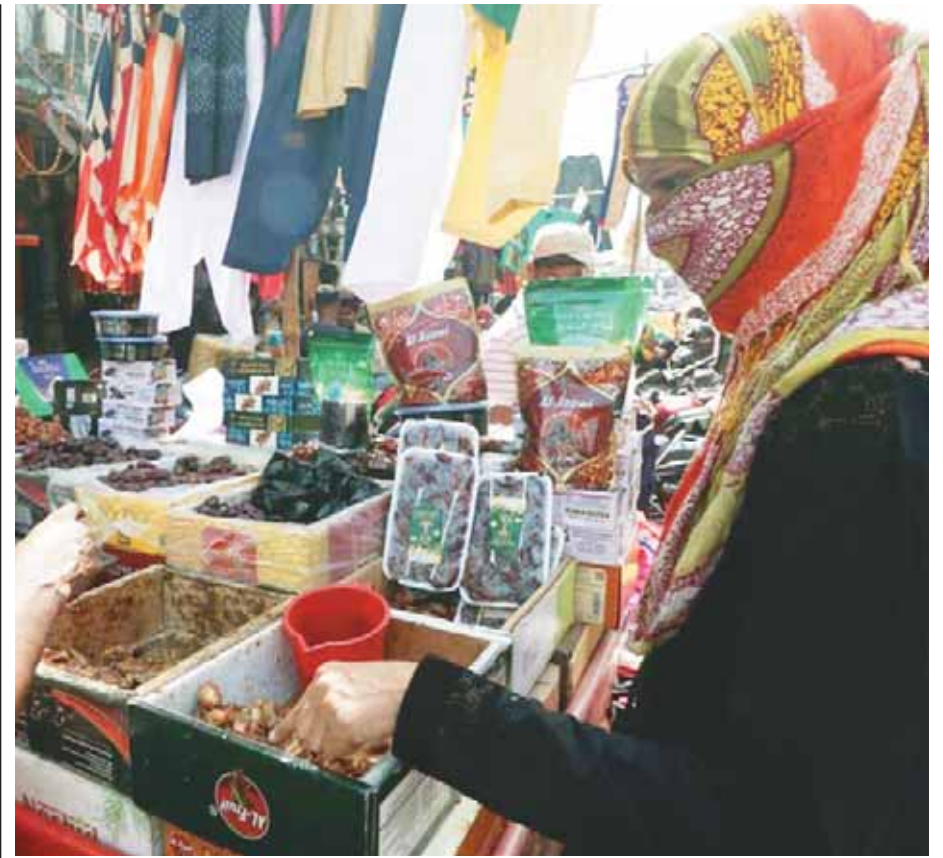
A woman buying dates, consumed at Iftar during Ramadan, in Lucknow on Wednesday