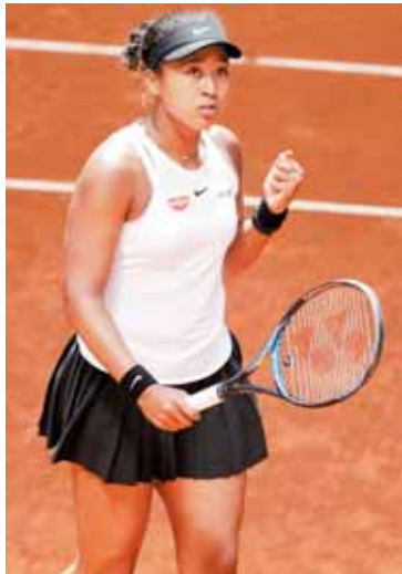
2006, 2009, and 2012.

Federer skipped the dirt for two full seasons to concentrate on his grass court form, winning Wimbledon in 2017. He claimed the Madrid title in