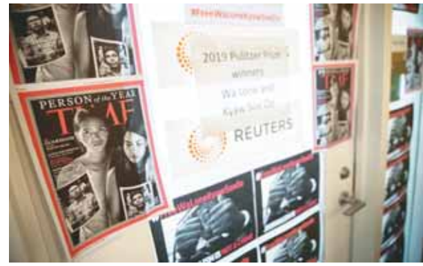
The door to the Reuters news agency office at United Nations headquarters is decorated Tuesday.

The two men were released as part of an amnesty of 6,520 prisoners by the country's President Win Myint. "Jailed for over 500 days since December 2017 for reporting on atrocities against the Rohingya, we are delighted they will be reunited with their families," White House Press Secretary Sarah Sanders said Tuesday. The two journalists from the London-based news agency won