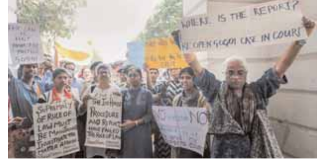
All India Democratic Women Association (AIDWA) members protest against the clean chat to CJI in sexual harassment case in New Delhi on Wednesday