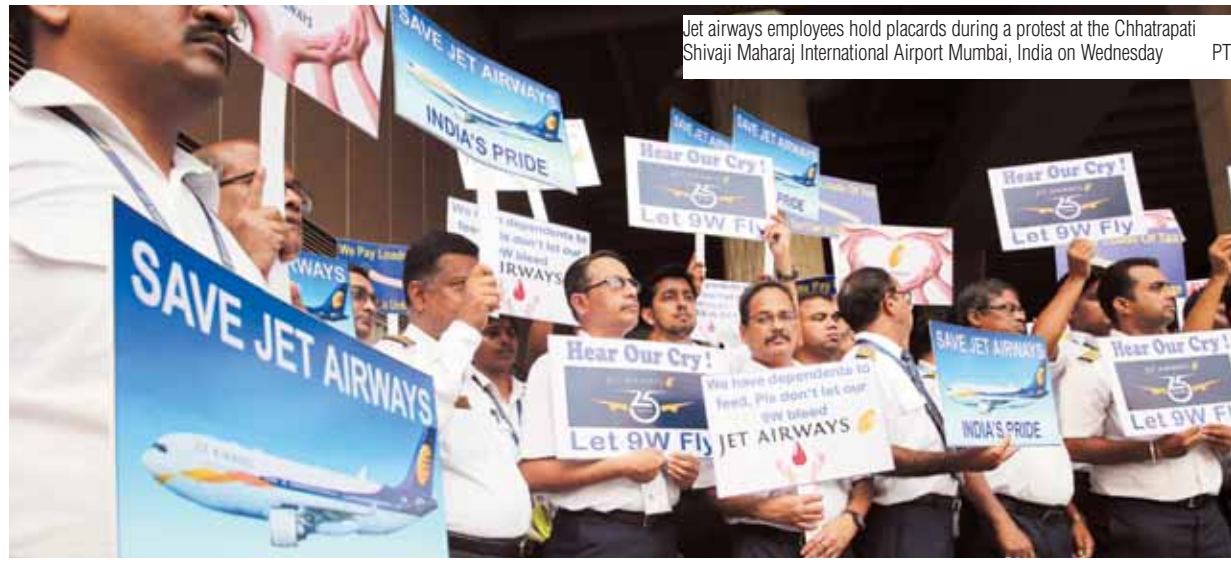
Jet airways employees hold placards during a protest at the Chhatrapati Shivaji Maharaj International Airport Mumbai, India on Wednesday

At another rally at Hura in the same district, she said the government is planning an airport at Charra to connect the district with Kolkata and other places. She urged the electorate to help TMC wrest all the 42 seats in the State.