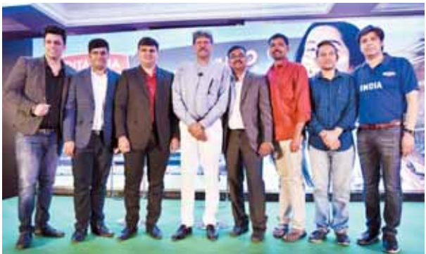
Kapil Dev poses for photo with the winners of 1st set of the Britannia Khao, World Cup Jao Campaign in New Delhi on Wednesday. 100 lucky winners will head on an all-expenses paid trip to England to watch the ICC Men's Cricket World Cup.