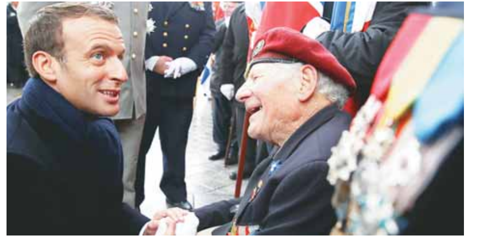
French President Emmanuel Macron greets a veteran during ceremonies marking the 74th anniversary of World War II victory in Europe, under the Arc de Triomphe Wednesday in Paris.

Thai considers the Election Commission's action as an intentional abuse of the law and against the constitution," it said in a statement.