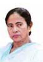
West Bengal CM —Mamata Banerjee

In 1942, Quit India movement was launched against the British, now we are fighting to oust a fascist Modi from power.