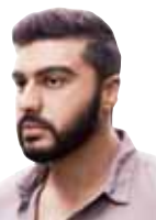
Actor —Arjun Kapoor

I am working now, I am not in the zone to get married. I don't care about what the world has to say. I think jumping the gun is silly.