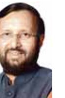
Union Minister —Prakash Javadekar

Rahul Gandhi had to apologise to the Supreme Court for attributing lies to it. Congress is a habitual liar. This is political bankruptcy. This is desperation.