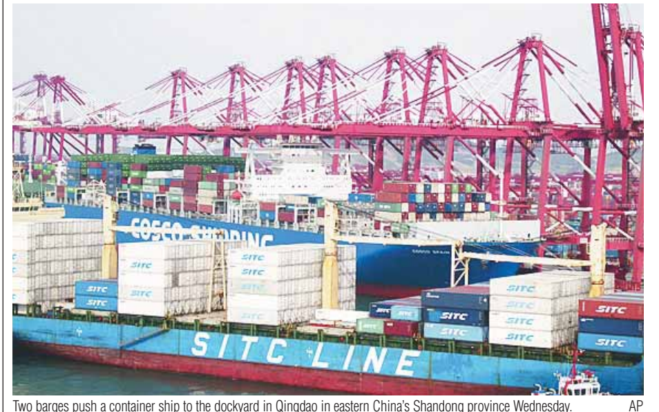
Two barges push a container ship to the dockyard in Qingdao in eastern China's Shandong province Wednesday.

Media reports suggest that the two sides are still discussing key issues on structural issues, such as the US accusation of unfair subsidies in China, a mechanism to verify compliance and what to do with the tariffs the two have already imposed on each other's goods.