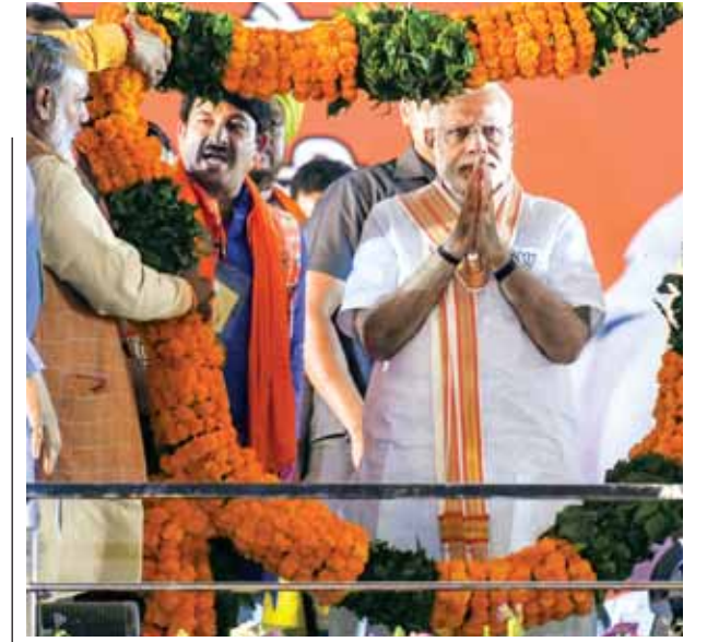
Prime Minister Narendra Modi being garlanded during an election campaign rally at Ramlila Maidan in New Delhi on Wednesday