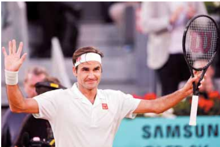
Roger Federer celebrates after winning his first match at Madrid Open against Richard Gasquet