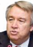
UN Secretary-General —Antonio Guterres

Detecting and disrupting terrorists and other high-risk criminals prior to them carrying out an attack is a high priority for the international community.