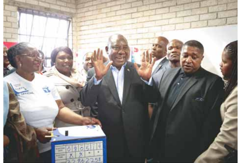
President Cyril Ramaphosa casts his vote at the Hitekani Primary School in Soweto, Johannesburg, South Africa Wednesday. South Africans are voting Wednesday in a national election that pits President Cyril Ramaphosa's ruling African National Congress against top opposition parties Democratic Alliance and Economic Freedom Fighters, 25 years after the end of apartheid.

Support for the ANC has fallen in every election since 2004 with the party taking 54 percent in 2016 municipal elec-