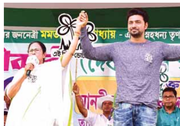
West Bengal Chief Minister and Trinamool Congress supreme Mamata Banerjee addresses an election campaign rally in favour of the party candidate from Ghatal constituency actor Dipak Adhikary, popularly known as Dev, for the Lok Sabha polls, at Debra in West Midnapore district on Wednesday

At Khandghosh in Burdwan, a CPI(M) polling agent was killed by alleged TMC miscreants for refusing to