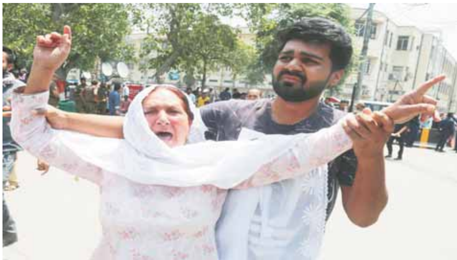
A police officer comforts a man who lost his family member and a mother mourns the death of her son Wednesday, May 8, 2019, outside a hospital in Lahore, Pakistan.

injuring four others critically. One security guard and three civilians are among the dead, he said.