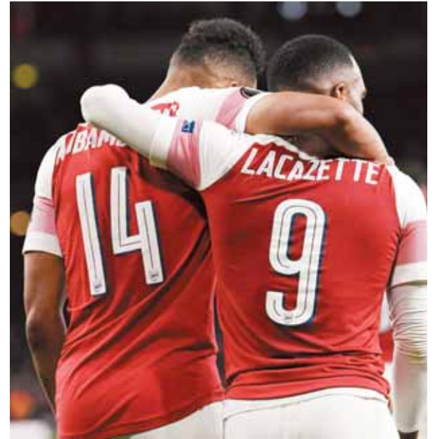
Valencia vs Arsenal Live from 12:30am IST SONY TEN 2 NETWORK

After a difficult first six months in England, many thought Aubameyang's arrival was ominous for Lacazette's