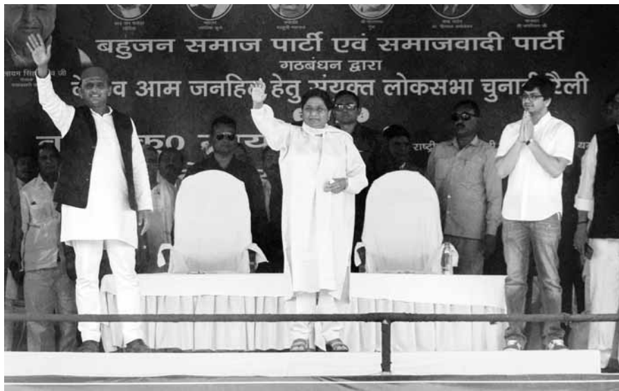
BSP supremo Mayawati and Samajwadi Party president Akhilesh Yadav wave at the supporters during an election campaign rally for the Lok Sabha elections, in Bhadohi, on Tuesday

Referring to the Congress' Nyaya scheme, she said the party which is claiming to provide Rs 6,000 every