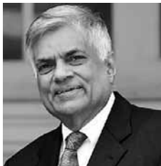
Addressing a press conference on Monday night, the tri-forces commanders and the police chief said the security of the country following the April 21 bombings has been ensured with adequate measures and steps have been taken to implement a special security plan.

Sri Lankan Prime Minister Ranil Wickremesinghe on Tuesday said that authorities have arrested or killed all the militants responsible for the deadly Easter blasts, but warned that the country still faces the threat of ISIS terror attacks.