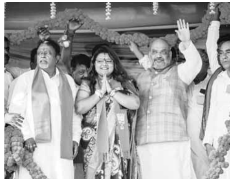
BJP president Amit Shah with Mukul Roy and other leaders being garlanded during an election campaign rally for the Lok Sabha polls, in Bankura district of West Bengal, on Tuesday

A video had appeared in the social media that showed Banerjee stopping her car at a