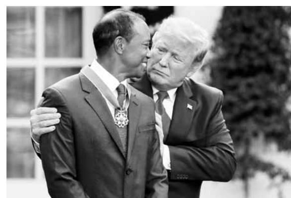
US President Donald Trump presents the Presidential Medal of Freedom to Tiger Woods during a ceremony in the Rose Garden of the White House on Monday

"These qualities embody the American spirit of pushing boundaries, defying limits and always striving for greatness," the president said. Trump congratulated Woods on "your amazing comeback and your amazing life and for giving sports fans a lifetime of memories. We can't wait to see what's next. Tiger," said Trump, an avid golfer and owner of several golf courses around the world. Woods, 43, choked up as he thanked his mother, his two children, his girlfriend and his caddy during the ceremony in the White House Rose Garden. "You have seen the good and the bad, the highs and the lows," said Woods, who battled back from injury to win the Masters last month, his first major title since the 2008 US Open. "I have tried to hang in there and I have tried to come back and play the great game of golf again," Woods said. "I have been lucky enough to have had the opportunity to do it again." He said his Masters victory was "probably the highlight of what I have accomplished so far in my life on the golf course. To have had that type of experience and to be able to come out on top and win," he said. Woods' Masters was his 15th major title, leaving him just three short of the record held by Nicklaus.