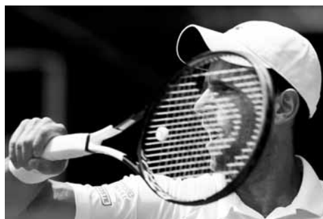
Novak Djokovic returns the ball to Taylor Fritz during the Madrid Open match

"We are in a position where it depends on us to be in the (Champions League) final or not and then it depends on us to finish in the top four. It's a massive week and that's why we need to move on, try to recover as soon as possible and be ready again but whatever happens I am going to feel proud."