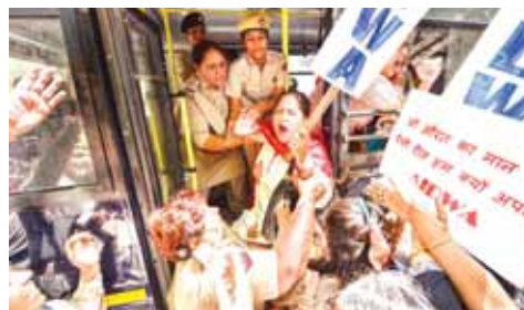
Women being detained for protest against Supreme Court In-house Committee's clean chit to the CJJ in the sexual harassment case in New Delhi on Tuesday

The woman complainant said, "The in-house proceeding rules are now being used to deny me and the public a right to the report... It appears from the press release that even I, the complainant, will not be provided with a copy of the report. I have a right to the report, the reasons for the same as well as copies of the depositions of any