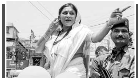
BJP MP Rupa Ganguly during an election campaign roadshow in favour of the party candidate for Lok Sabha constituency Anupam Hazra (unseen) for the Lok Sabha polls, at Sonarpur in South 24 Parganas district of West Bengal, on Tuesday

In this scenario, BJP's Ravi Kishan relies totally on Yogi Adityanath. Being a Bhojpur actor, he may draw crowd but will his charisma translate into votes, only time will tell.