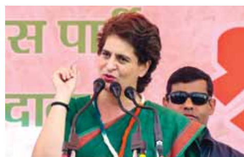
Congress general secretary Priyanka Gandhi Vadra addresses an election rally in Hisar on Tuesday

The Congress leader also dared Modi to fight the Lok Sabha elections on issues like development rather than