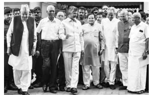
Opposition leaders (L-R) Farooq Abdullah, D Raja, N Chandrababu Naidu, Ahmed Patel, Ashok Gehlot, Abhishek Manu Singhvi and others after meeting with Chief Election Commissioner (CEC) at Nirvachan Bhawan in New Delhi on Tuesday

The Supreme Court has directed the EC to count VVPAT