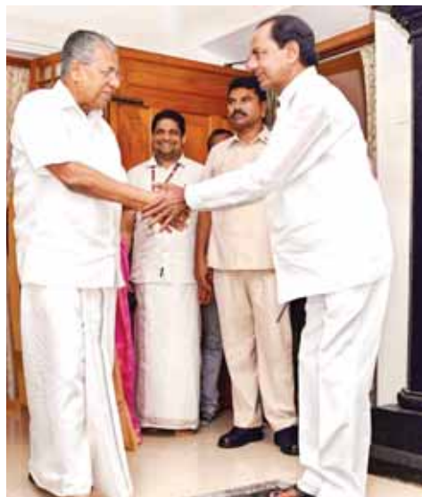
Telangana Chief Minister K Chandrashekar Rao meets his Kerala counterpart Pinarayi Vijayan at latter's residence in Thiruvananthapuram

In March, KCR had mooted the idea of a "federal front" and initiated efforts to provide an alternative to both the BJP and the Congress and subsequently met leaders of Trinamool Congress, Biju Janta Dal, Samajwadi Party, Janata Dal (S) and DMK. Sources said he also invited the YSR