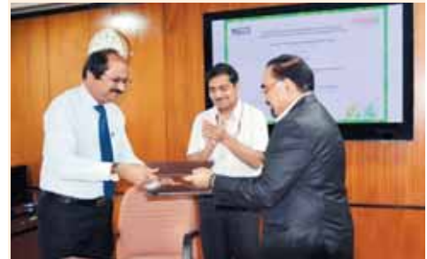
Petroleum Conservation Research Association (PCRA), Ministry of Petroleum & Natural Gas, Government of India and world's third largest tractor manufacturer by volumes, TAFE Tractors and Farm Equipment Limited, signed an MoU to aid conservation of resources across the country