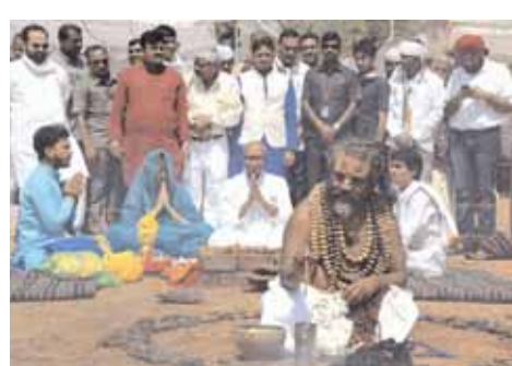
Bhopal Spiritual leader Namdev Das Tyagi, popularly known as Computer Baba, performs puja at the election campaign venue of Congress candidate for Bhopal Lok Sabha seat Digvijaya Singh, in Bhopal on Tuesday

Computer Baba told the media it was a fight of dharma and adharma. "Dharma was with Digvijaya Singh," he said.