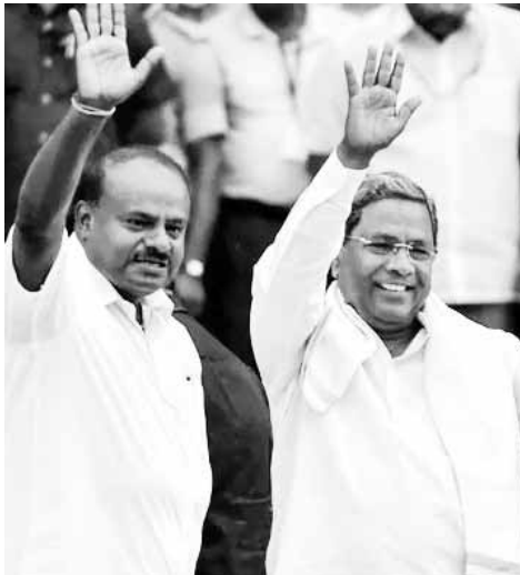
2018 Assembly elections, Kumaraswamy took over as the CM of the State. The coalition partners also fought the Lok Sabha elections together

After the Congress and JDS formed the coalition Government following the May