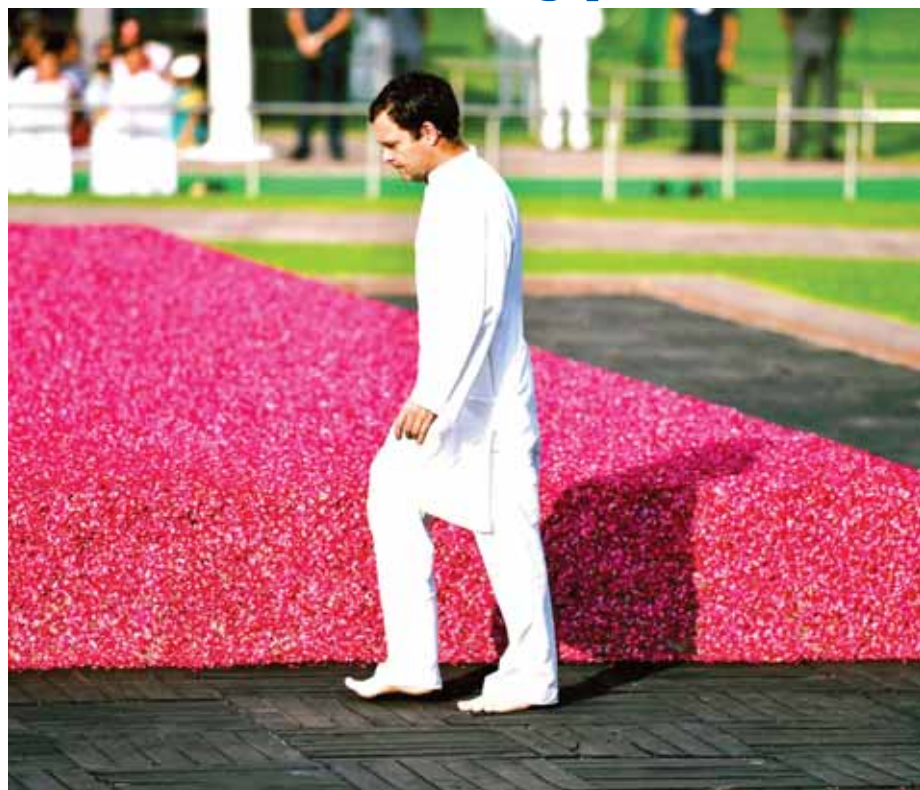
Congress president Rahul Gandhi after paying tribute to India's first Prime Minister and his great grandfather Jawaharlal Nehru on his 55th death anniversary at his memorial Shanti Van in New Delhi on Monday

While majority of the Congress leaders hoped that Rahul will "not abandon the post", sources close to him said he is determined not to take