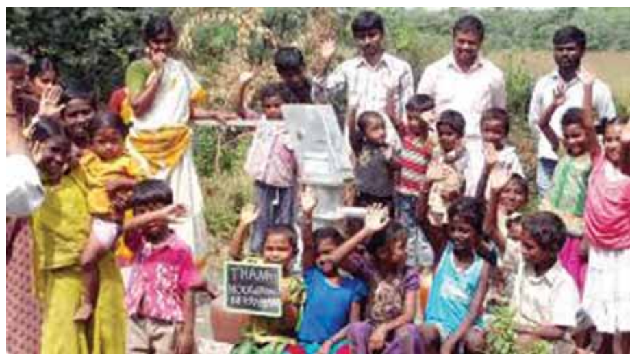
As per the government decision those people will be considered under EWS category,