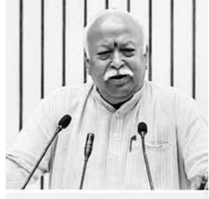
for the construction of Ram temple in Ayodhya, and had asked the Narendra Modi-led government to hasten the process of temple construction. The Ram Temple has been on the BJP manifesto since 2014.

Even before the Lok Sabha elections, the RSS had pitched