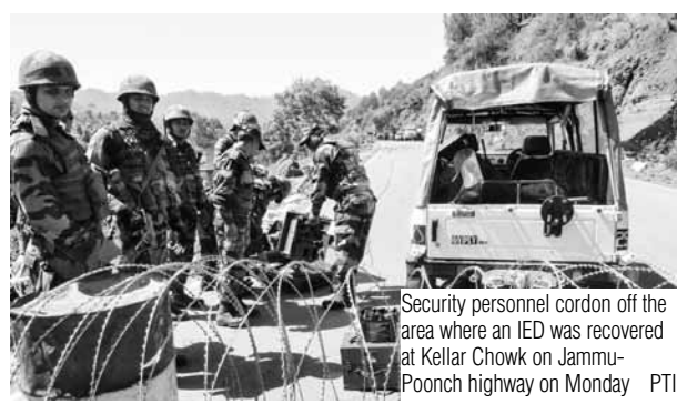
Security personnel cordon off the area where an IED was recovered at Kallar Chowk on Jammu-Poonch highway on Monday

PNS ■ JAMMU Security forces averted a mishap on Monday by timely detecting a suspected improvised explosive device (IED) near Kallar chowk along Jammu-Poonch highway in frontier Rajouri district.