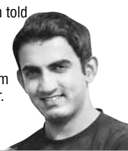
BJP MP — Gautam Gambhir

In Gurugram, Muslim man told to remove skullcap, chant Jai Shri Ram . It is deplorable. Exemplary action needed by Gurugram authorities. We are secular.