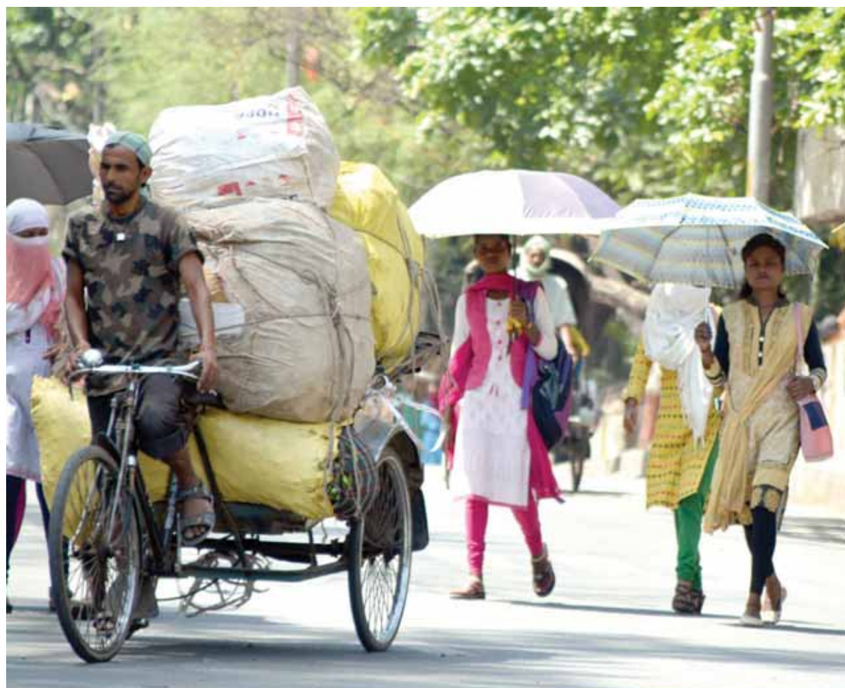
Girls walk under umbrella to protect themselves from scorching heat on a hot summer day in Ranchi on Monday

Manohar Lal has already directed all the MLAs to expedite the progress of various development works or projects in their constituencies and ensure to fix a deadline for the completion of key projects.