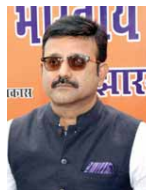
State BJP Spokesperson Pratul Shahdeo. File photo

State Bharatiya Janata Party (BJP) said on Monday that after getting crushing defeat in the election, the party had asked that Congress should play positive role of Opposition but the Congress leaders are still spitting venom on BJP leaders.