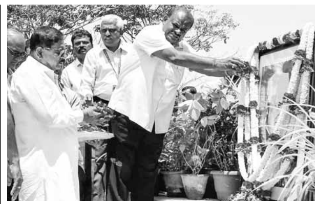
Karnataka Chief Minister HD Kumaraswamy, along with Deputy CM G Parameshwara, pays tribute to former Prime Minister Jawaharlal Nehru on his 55th death anniversary in Bengaluru, on Monday

"It seems that some miscreant placed a suspicious object in a disintegrated form to give it the shape of an IED to create social disorder", he added.