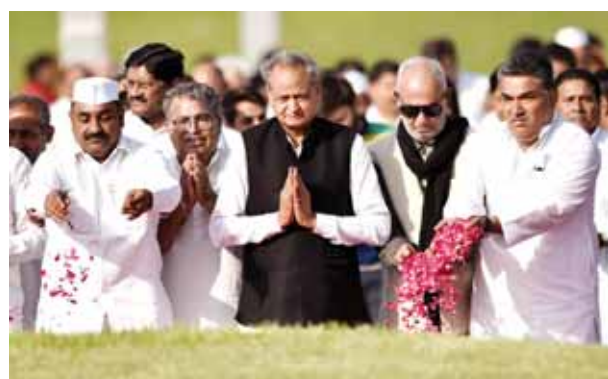
Rajasthan Chief Minister Ashok Gehlot and other leaders pay tribute to India's first Prime Minister Jawaharlal Nehru on his 55th death anniversary, at his memorial Shanti Van in New Delhi on Monday

The BSP has extended its support to the Congress in Rajasthan and Madhya