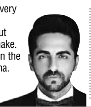
Actor — Ayushmann Khurana

I wanted to do something very relevant to society and to Indians, and not think about how much money it will make. For me, this has never been the benchmark for good cinema.