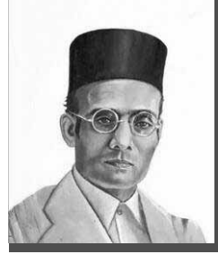
Now, in the textbooks it is mentioned Savarkar had described himself as "son of Portugal" when seeking clemency from the British Government in 1910-11

"Indira Gandhi had donated a sum of Rs 11,000 from her