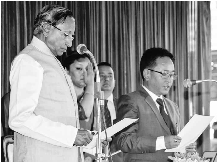
Governor Ganga Prasad administers the oath to Sikkim Krantikari Morcha (SKM) president Prem Singh Tamang as the new Chief Minister of Sikkim during a swearing-in-ceremony, at Paljor Stadium, in Gangtok, on Monday