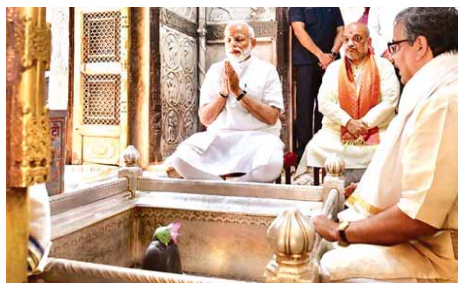
Prime Minister Narendra Modi, along with BJP president Amit Shah, offers prayers at Kashi Vishwanath Temple during a visit to his parliamentary constituency Varanasi on Monday

"The CWC held a collective deliberation on the performance of the party, the challenges before it as also the way ahead, instead of casting aspersions on the role or conduct of any specific individual. The gist of the deliberations was made public in the CWC resolution of May 25, 2019," the Congress leader said in a statement.