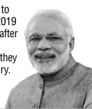
PM — Narendra Modi

UP is giving new direction to politics...2014, 2017 and 2019 hatrick is not small. Even after this, if the eyes of political pundits do not open, then they are living in the 20th century.