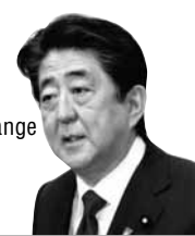
Japanese PM — Shinzo Abe

I feel I have to meet face-to-face with Chairman Kim without attaching any preconditions and exchange frank views with him.