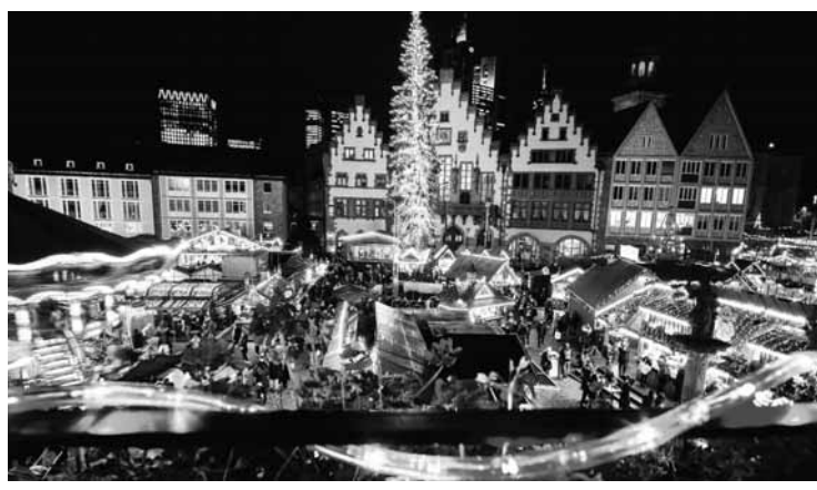
People gather on the Roemerberg Square to visit the traditional Christmas market in Frankfurt, Germany, on Tuesday

Washington: The House Judiciary Committee said Tuesday it would begin hearings on December 4 in the next phase of the impeachment inquiry into Donald Trump — inviting the US president and his lawyer to attend, Jerry Nadler, chairman of the Democratic-controlled committee, said the first hearing would begin at 10:00 am (1500 GMT). "The Committee looks forward to your participation in the impeachment inquiry as the Committee fulfils its constitutional duties," Nadler said. AFP