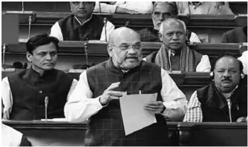
Union Home Minister Amit Shah speaks in the Lok Sabha during the Winter Session of Parliament in New Delhi on Wednesday

"Impression is being created that the SPG Act is amended to withdraw security from the Gandhi family. This is not the fact. Security of the Gandhi family has not been withdrawn but changed to 'Z-plus' with advance security liaison and ambulance that will be given across the country," he said.