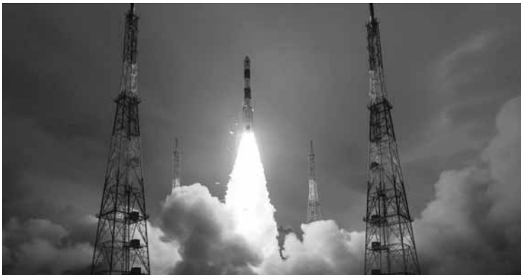
Indian Space Research Organisation (ISRO) Polar Satellite Launch Vehicle, PSLV-C47 carrying India's earth observation satellite Cartosat-3 and 13 nano-satellites from the US lifts-off from Sriharikota, in Andhra Pradesh on Wednesday

"After separation of the CARTOSAT-3, its solar arrays were deployed automatically and the ISRO's Telemetry Tracking and Command Network at Bengaluru assumed control of the satellite," ISRO