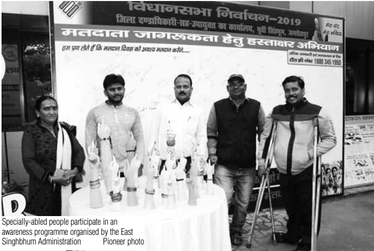
Specially-abled people participate in an awareness programme organised by the East Singhbhum Administration.

Social organisations like Jharkhand Viklang Sansthan and Jharkhand Viklang Manch have decided to provide vehi-