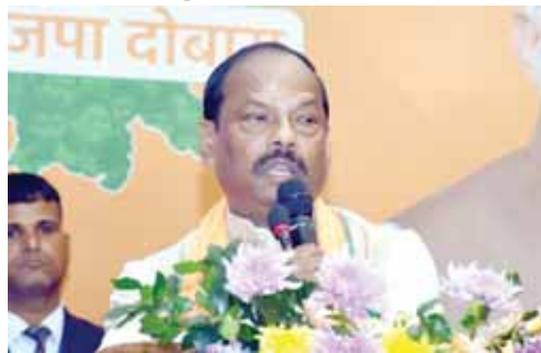
Chief Minister Raghubar Das during the release of BJP's manifesto for State Assembly elections in Ranchi on Wednesday.

Vice-President M Venkaiah Naidu this year in August launched the Mukhya Mantri Krishi Ashirwad Yojana (MMKAY). Farmers having