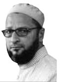
AIMIM chief —Asaduddin Owaisi

When a ship sinks in the middle of a sea, the captain evacuates everyone safely but Gandhiji is a captain who himself left after seeing the Congress sinking.