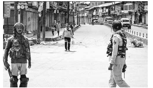
National Conference leaders expressed regret over the continued detention of political leaders and common citizens, saying the situation had touched the lowest depths

The NC said such harsh measures would further alienate the people and delay restoration of normalcy in