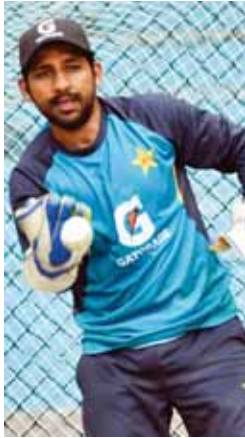
■ KARACHI

Head coach-cum-chief selector Misbah-ul-Haq is extremely disappointed with the attitude of some Pakistani players, who shy away from proper training, lack discipline and don't adhere to professional standards.