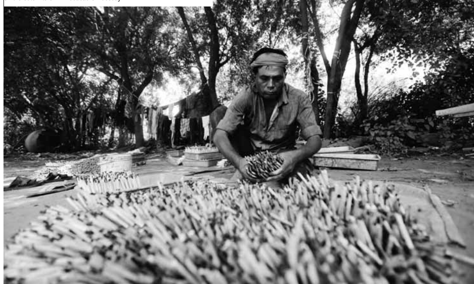
A worker makes firecrackers for the upcoming festival Diwali at a factory on the outskirts of Ahmedabad on Tuesday

This will not only increase trips but also earn revenue from the otherwise stationed coaches, he added. Dr Harsh Vardhan appreciated the work being done in all areas with a special mention of the up-gradation of stations in the National Capital Region.