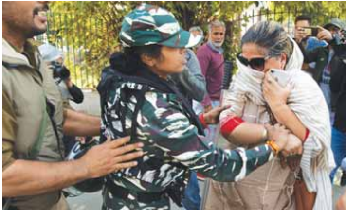
A paramilitary woman detains a Kashmiri woman who was among the protesters in Srinagar on Tuesday