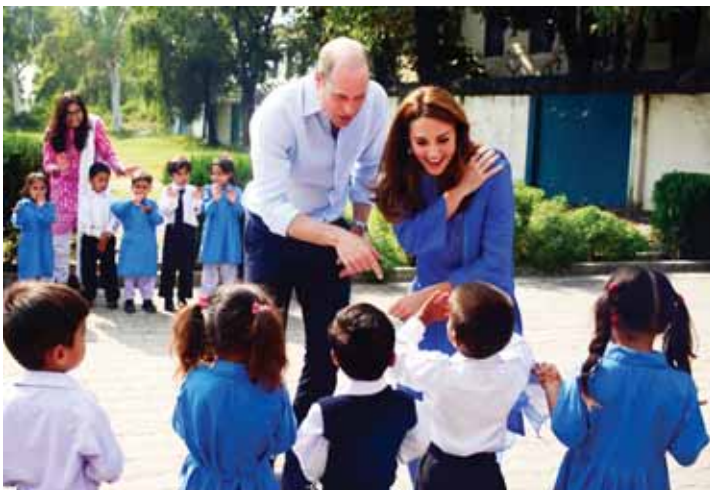
Britain's Prince William and his wife Kate interact with students during their visit to a school outside Islamabad, Pakistan on Tuesday

Sd/- Executive Engineer-cum- Resident Engineer Bihar Bhawan, New Delhi