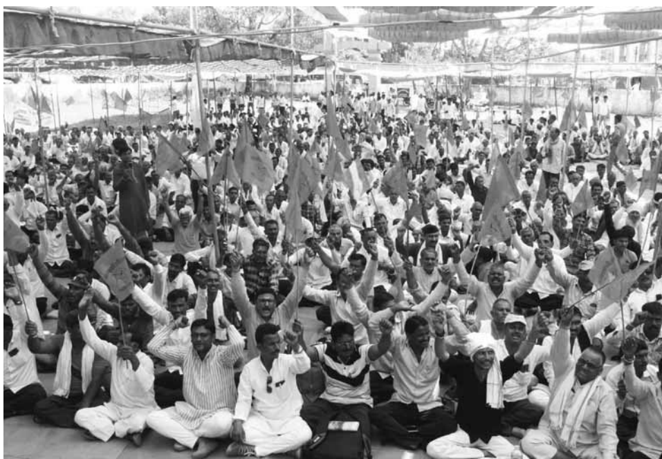
Farmers under the banner of Bharatiya Kisan Sangh stage a protest against Congress-led State Government demanding waiver of loans in Bhopal on Tuesday