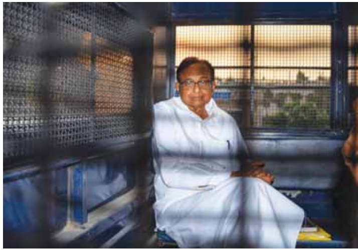
Senior Congress leader and former Finance Minister P Chidambaram after being produced in the Rouse Avenue Court in connection with the INX Media corruption case in New Delhi on Tuesday