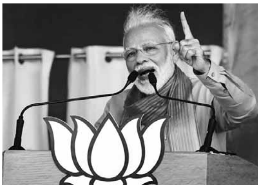
Prime Minister Narendra Modi in his rallies in Haryana on Tuesday

The PM who spoke about the steps that his Government