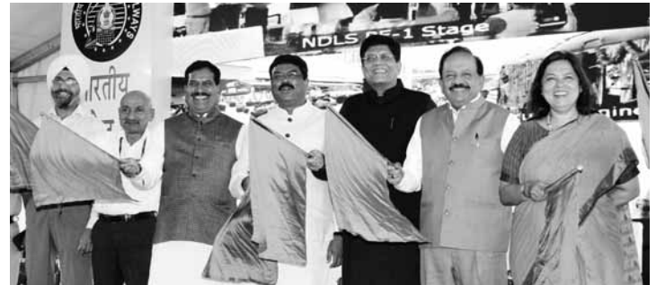
Minister of Railways Piyush Goyal, Union Minister of Petroleum & Natural Gas Dharmendra Pradhan, Union Minister for Health and Family Welfare Dr Harsh Vardhan, MoS Railway Suresh C Angadi and Meenakshi Lekhi, flagged off the inaugural run of Delhi — Shamli train service in a ceremony held at New Delhi Railway station on Tuesday

To provide better travel opportunities to passengers who have to travel to neighboring towns and cities mainly for livelihood and education purposes the Railways has initiated nine new Sewa Services spread across eight states of India. These daily or six days a week short distance services will be a boon to the daily