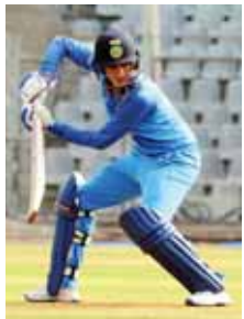
Smriti Mandhana in a file picture.

Among others batters, skipper Mithali Raj moved down to the seventh spot while her Harmanpreet Kaur rose in the rankings to the occupy the 17th place.