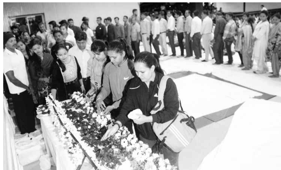
Players of Madhya Pradesh Sports Academy pay tributes to the hockey players who were killed in a road accident on Monday in Hoshangabad district, at a condolence meeting organised to pay homage at TT Nagar stadium in Bhopal on Tuesday. Four national-level hockey players of Madhya Pradesh Hockey academy lost their lives when the car in which they were travelling met with an accident

For the introduction of the subject, 5 minutes have been set by ACS / PS for the presentation of sector wise possibilities in the state, 10 minutes for the speakers and 10 minutes for the question and answers. High Tea will be organized after the end of the special session. There will be cultural programme from 7 pm to 9.30 pm.