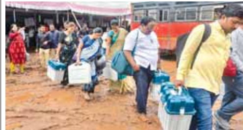
Election officials walk through a damp field as they leave for their respective polling stations on the eve of Maharashtra Assembly elections in Sangli on Sunday.