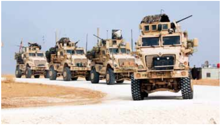
American military convoy stops near the town of Tel Tamer, north Syria on Sunday

That brought the Turkish military's death toll to seven