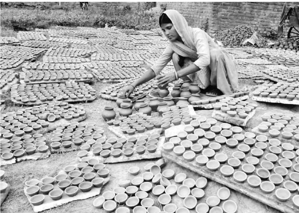
A woman busy in making earthen lamps in preparation for the Diwali festival in Moradabad district of Uttar Pradesh on Sunday

A new tourist season has begun, and the number of vehicles bringing in tourists via the Yamuna Expressway or the Agra-Lucknow Expressway,