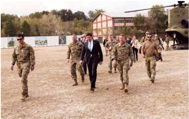
US Defense Secretary Mark Esper walks Gen. Scott Miller chief of the US-led coalition in Afghanistan, at the US military headquarters in Kabul, Afghanistan on Sunday