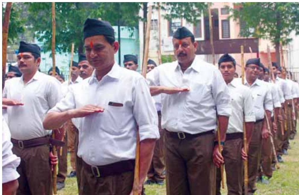
RSS volunteers take part in a path march in Bhopal on Sunday