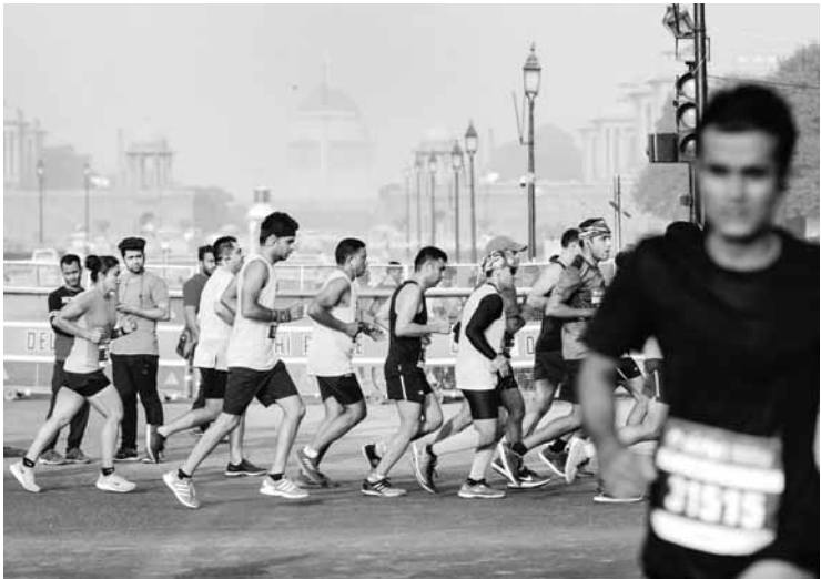
Participants seen at Rajpath during the 15th Airtel Delhi Half Marathon on Sunday in New Delhi

Not many overseas Indians turn up to cast their votes as they do not want to spend foreign currency to come to India for the purpose, officials said.