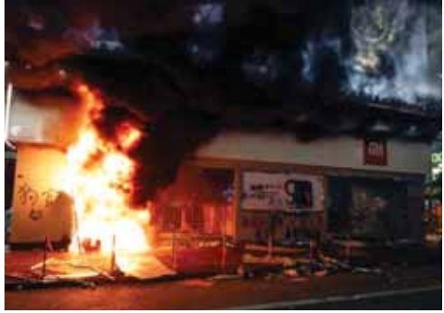
Protesters set fire to a Xiaomi shop at Nathan road in Hong Kong on Sunday