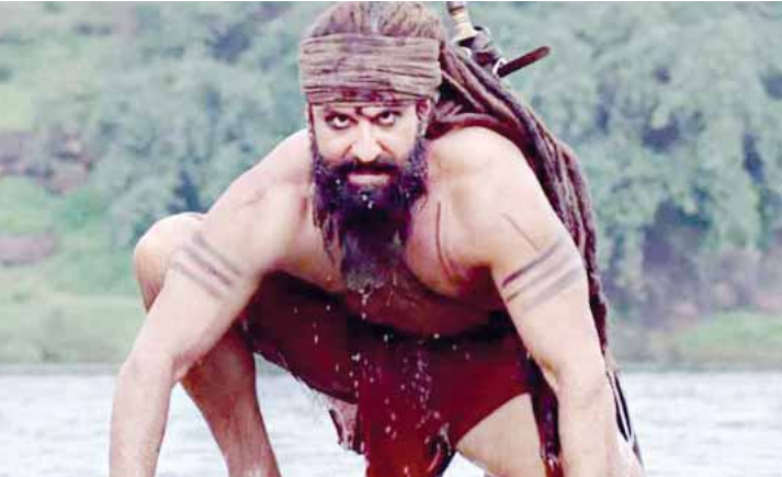
LAAL KAPTAAN *ing: Saif Ali Khan, Manav Vij, Zoya Hussain, Deepak Dobriyal, Simone Singh, Sonakshi Sinha Rated: 6/10

There are a few problems that Laal Kaptaan has. First, the look that Saif Ali Khan supports. While the make-up artist who painstakingly worked on giving this look to the actor, there is need to understand that there is no need to copy. Some elements are familiar — inspired from Captain Jack Sparrow. We fell in love with that look but it doesn't mean we want it replicated. Second, from the opening scene we understood that the film is about revenge and that the victim needs to meet his Maker in the manner that was avowed. What follows in the next 155 minutes leads to sheer boredom. Third, the storyline is weak and is stretched out. Some slick editing could have taken Laal Kaptaan on a fasttrack. Fourth, a big disappointment is