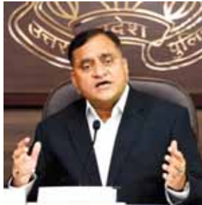
UP DGP OP Singh addresses the media on the murder of Kamlesh Tewari, in Lucknow on Saturday

The UP DGP claimed that the suspects were "radicalised"