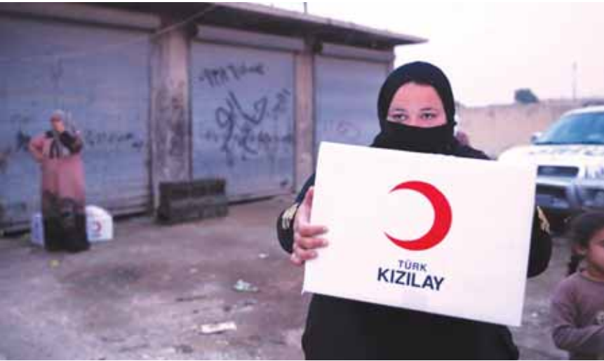
a woman carries aid being distributed by Turkish Red Crescent in Ras Al-Ayn, Syria on October 19, 2019

kered with Ankara. "The combination of a US pullback and the escalating Turkish-Kurdish hostilities is creating a strategic nightmare for our country," McConnell wrote in his opinion piece. "Even if the five-day ceasefire announced on Thursday holds, events of the past week have set back the US' campaign against the Islamic State and other terrorists," he said. McConnell did not mention Trump by name, though he did liken the Syria withdrawal to the foreign policy of Trump's Democratic predecessor Barack Obama. "We saw the Islamic State flourish in Iraq after President Barack Obama's retreat. We will see these things anew in Syria and Afghanistan if we abandon our partners and retreat from these conflicts before they are won," McConnell wrote. "America's wars will be 'endless' only if America refuses to win them," he added in an apparent jab at Trump's insistence that the withdrawal was necessary "to get out of these ridiculous Endless Wars." AFP