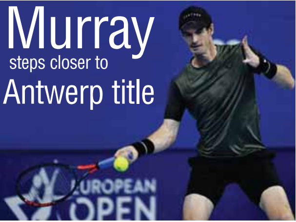
Andy Murray plays a return shot during Antwerp Open quarterfinal match