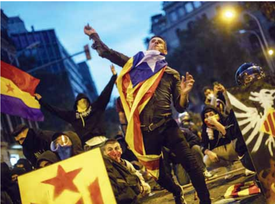
A Catalan pro-independence protestor throws a stone during clashes with police in Barcelona, Spain on Friday

not made sufficient progress in four parameters — international cooperation, supervision, legal persons and arrangements and targeted financial sanctions on proliferations (North Korea and Iran), the daily said. At its meeting at Buenos Aires, Argentina in October 2017, the FATF listed Sri Lanka as a jurisdiction with strategic AML/CFT deficiencies which is more commonly identified as “Grey List” and provided a time-bound action plan, the report said.