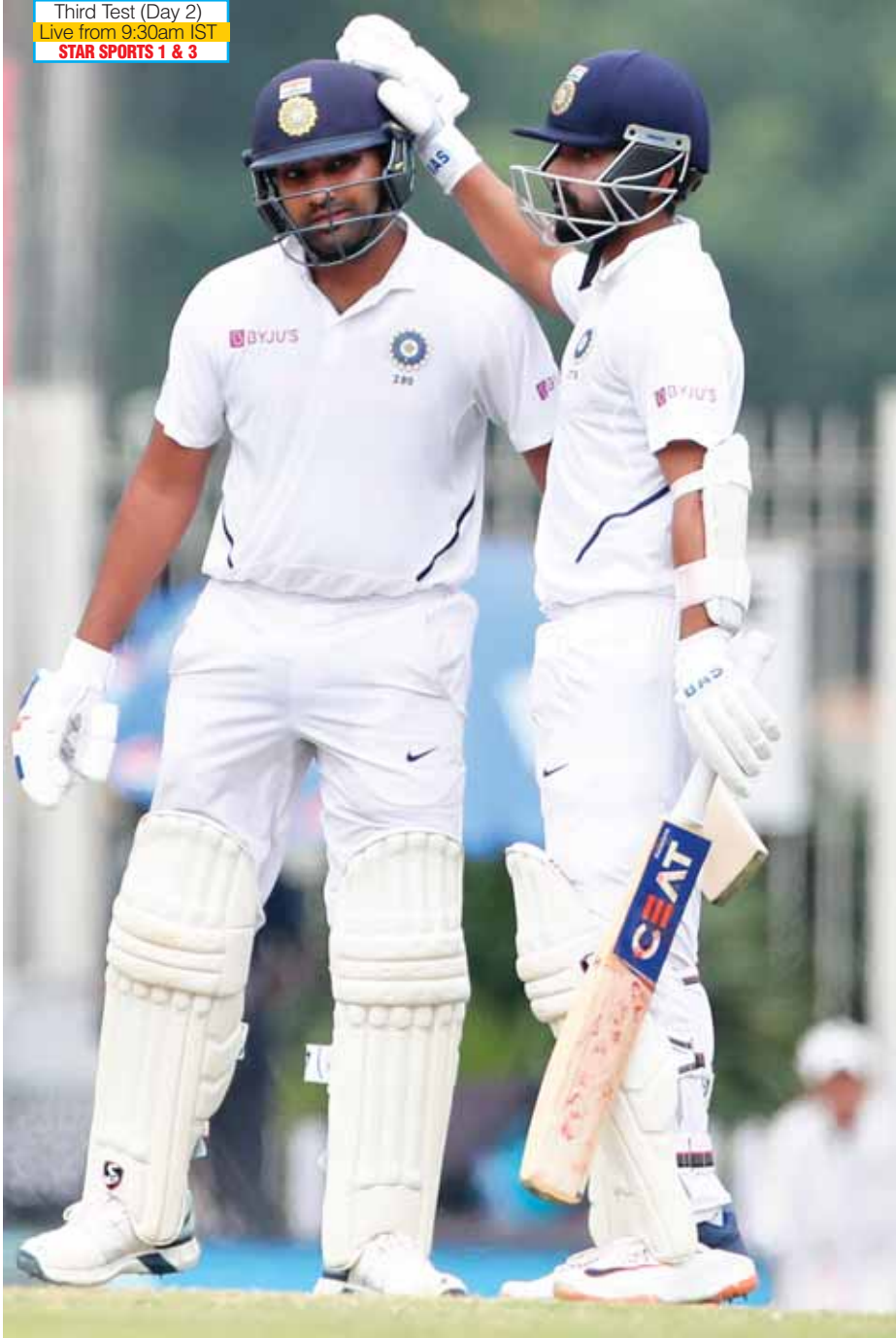
Ajinkya Rahane, right, pats on the helmet of teammate Rohit Sharma to congratulate him on scoring century

Kohli took the review but only to be turned down with an umpire's call and the skipper went back to the pavillion frustrated.