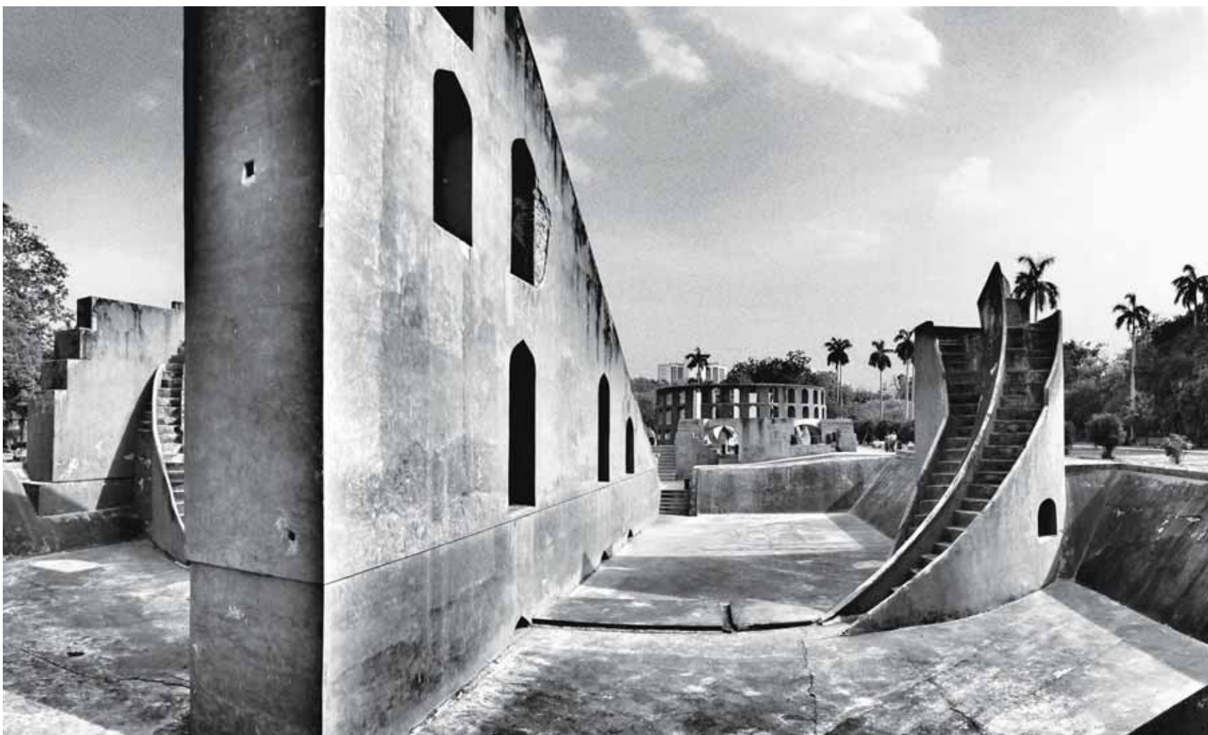
Jantar Mantar, Delhi; Archival Pigment Print