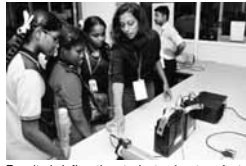
Faculty briefing the students about projects

A total of around 14 labs were set up with various kinds of instruments, prototypes and equipment to help students understand the intricacies of electronics and instrumentation engineering. A few of these dis-