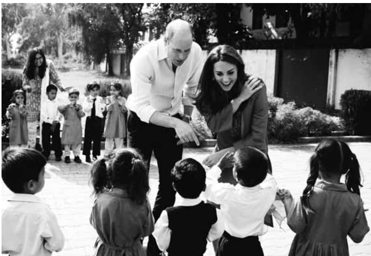
Britain's Prince William and his wife Kate interact with students during their visit to a school outside Islamabad, Pakistan on Tuesday

Using a dense network of tunnels, berms and trenches, Kurdish fighters from the Syrian Democratic Forces (SDF) have been mounting a desperate defence of Ras al-Ain.