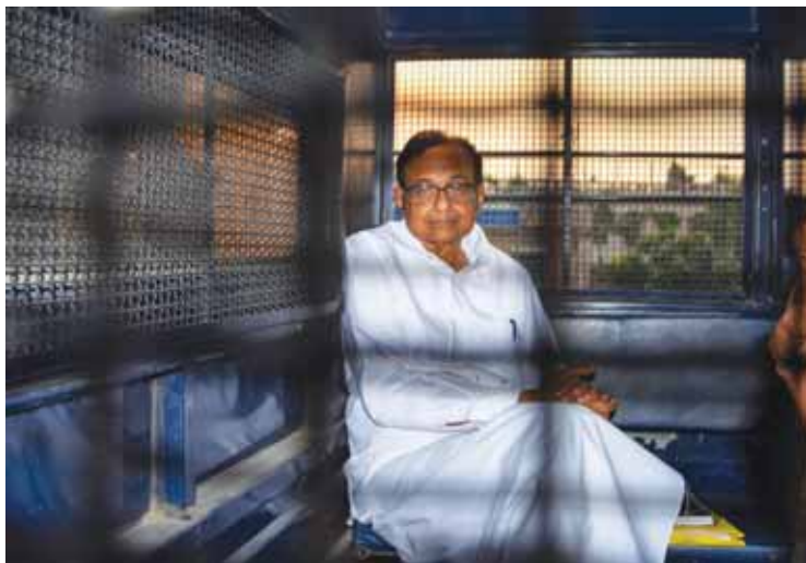
Senior Congress leader and former Finance Minister P Chidambaram after being produced in the Rouse Avenue Court in connection with the INX Media corruption case in New Delhi on Tuesday