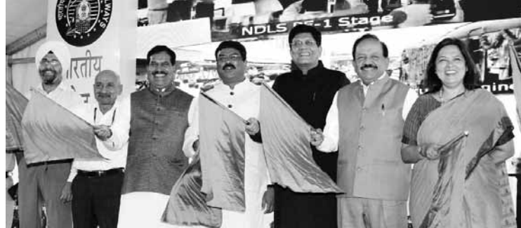
Minister of Railways Piyush Goyal, Union Minister of Petroleum & Natural Gas Dharmendra Pradhan, Union Minister for Health and Family Welfare Dr Harsh Vardhan, MoS Railway Suresh C Angadi and Meenakshi Lekhi, flagged off the inaugural run of Delhi — Shamli train service in a ceremony held at New Delhi Railway station on Tuesday

To provide better travel opportunities to passengers who have to travel to neighboring towns and cities mainly for livelihood and education purposes the Railways has initiated nine new Sewa Services spread across eight states of India. These daily or six days a week short distance services will be a boon to the daily