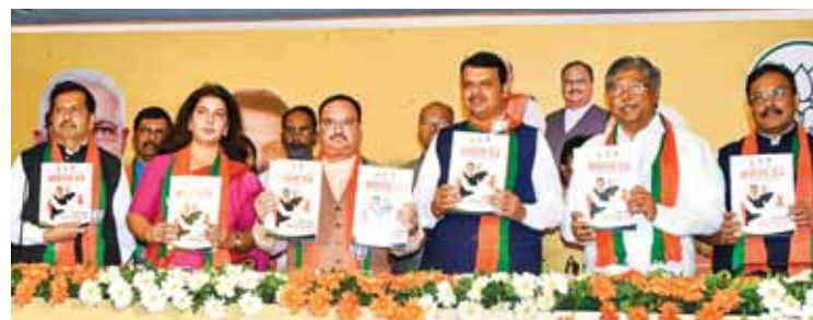
Maharashtra Chief Minister Devendra Fadnavis, BJP working president JP Nadda, State BJP president Chandrakant Patil and other leaders release BJP's manifesto ahead of Maharashtra Assembly elections in Mumbai on Tuesday

Releasing "Sankalp Patra" along with the party's working president JP Nadda, Chief Minister Devendra Fadnavis said, "On our return to power in the State, we will recommend to the Centre a proposal to bestow 'Bharat Ratna' upon social reformers Jyotiba