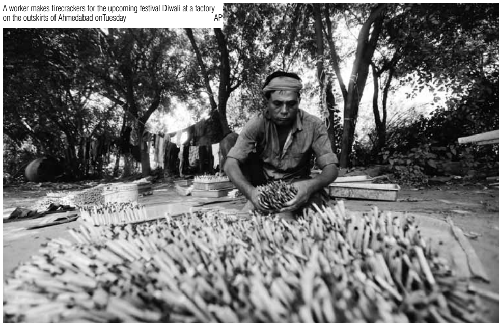
A worker makes firecrackers for the upcoming festival Diwali at a factory on the outskirts of Ahmedabad on Tuesday

This will not only increase trips but also earn revenue from the otherwise stationed coaches, he added. Dr Harsh Vardhan appreciated the work being done in all areas with a special mention of the upgradation of stations in the National Capital Region.