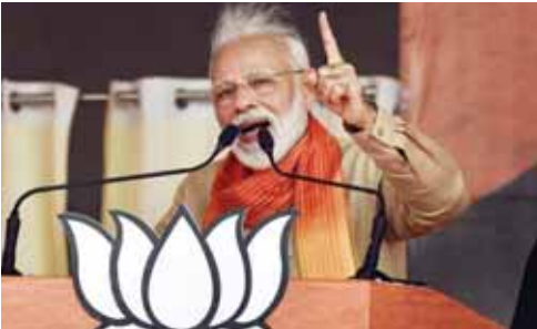
Prime Minister Narendra Modi in his rallies in Haryana on Tuesday

The PM who spoke about the steps that his Government had taken for ex-servicemen and defence personnel, told farmers that he had started working on stopping water flowing into Pakistan that rightfully belongs to the people of Haryana and Rajasthan. He said India would not allow its water to flow to Pakistan. "For 70 years, the water which belongs to India and the farmers of Haryana flowed to Pakistan. Modi will stop this water (from flowing into Pakistan) and bring to your houses," the Prime Minister said in an election meeting.