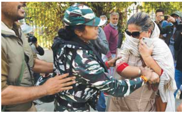
A paramilitary woman detains a Kashmiri woman who was among the protesters in Srinagar on Tuesday