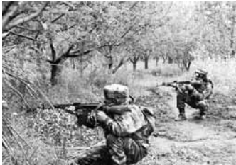
Mnzoor Hussain and Naseema Akhtar.

As heavy shelling continued in the forward areas, another couple hailing from Qasba village of Poonch sector received injuries and was rushed to the nearby hospital. The injured were identified as