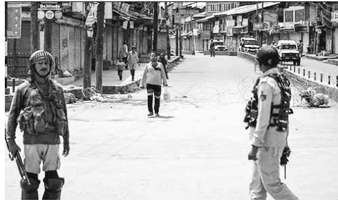
National Conference leaders expressed regret over the continued detention of political leaders and common citizens, saying the situation had touched the lowest depths

The NC said such harsh measures would further alienate the people and delay restoration of normalcy in