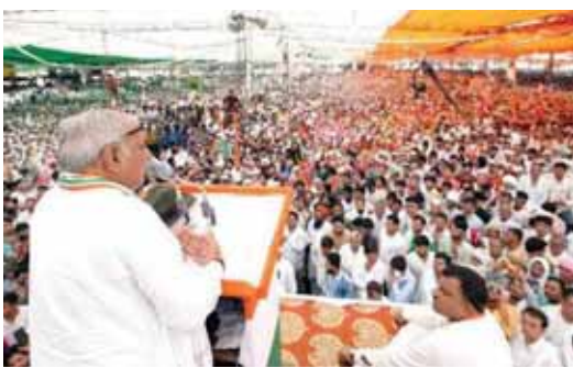
CHANDIGARH

They are the show stoppers for their respective parties BJP and Congress—Manohar Lal Khattar and Bhupinder Singh Hooda—in Haryana and they are leaving nothing in their campaign ahead of the October 21 elections. Khattar on Thursday addressed as many as eight rallies starting from 10.20 am to 9.30 pm from various parts of the State including Ateli, Loharu, Kilo, Pundri, Siwan, Kaithal, Asandh and Karnal. In his rallies, Chief Minister Khattar is focussing on equal development of state without any regional discrimination claiming that even opposition leaders are astonished the way development in Haryana has taken place in the last five years.