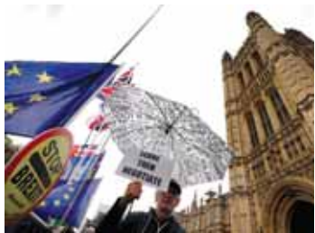
A demonstrator holds a placard as flags and banners are tied to railings near Parliament in London on Thursday

Normally, tomato production is around 20 million tonnes a year. Thankfully, Tomato is a year-long crop and the country has enough supply to meet its requirement.