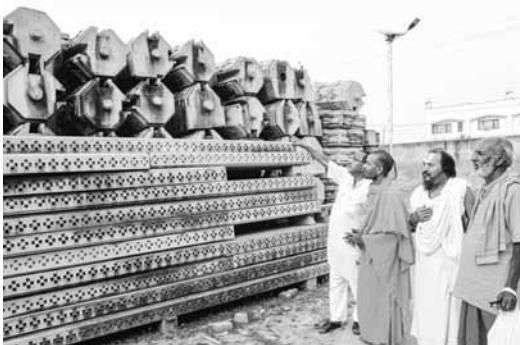
Sadhus look at stone slabs, carved-out for the construction of Ram Temple, at Shri Ram Jambhoomi Karayashala (workshop) in Karsawapuri, Ayodhya on Thursday

Located in the northern fringes of Kolkata, Bhatpara municipality falls under Barrackpore Lok Sabha constituency, which is now represented by Arjun Singh of BJP.