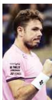
Stan Wawrinka celebrates after win