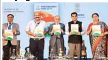
NITI Aayog Vice-chairman Rajiv Kumar, with others, launches the India Innovation Index prepared by NITI Aayog in New Delhi on Thursday