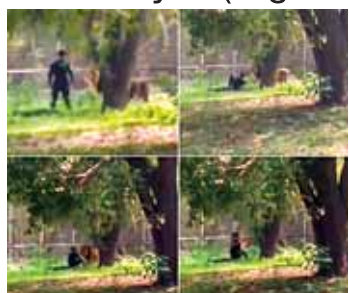
A 25-year-old (above) mentally-unstable man leapt into the enclosure of a lion at the Delhi Zoo on Thursday, and came face to face with the big cat and moved around unconcerned about the lurking danger, before the zoo staff rescued him after tranquillising the lion. (Left) The combo of 4 photos show the man inside the lion's enclosure at Delhi Zoo on Thursday