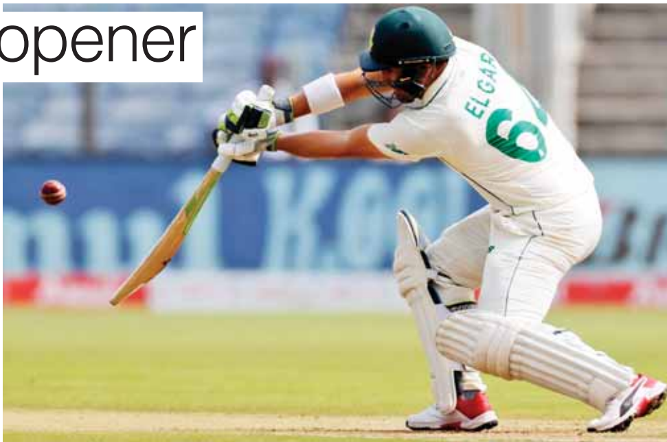
South Africa's Dean Elgar bats during fourth day of second Test between India and South Africa in Pune

lowing our process against India in the last Test. That's something we can't neglect going into this game. There is still a lot to play for," he added. Elgar, who became the first South African batsman to score a