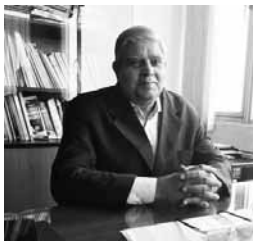
including Union Home Minister Amit Shah.

The Governor had on Tuesday said that he was deeply hurt at the treatment allegedly meted out to him at the Durga Puja Carnival on Red Road on October 11. Usually governors are given state police cover.