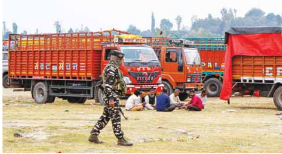
A security person patrols as trucks stand parked at a safe zone for fruit dealers in Shopian on Saturday

On an average, one truck carries 800 to 1,000 apple boxes. Transporters are charg-