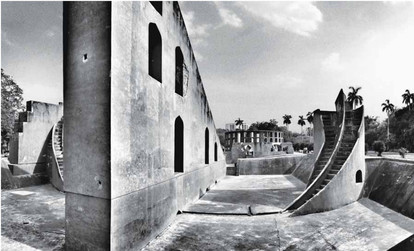
Jantar Mantar, Delhi; Archival Pigment Print