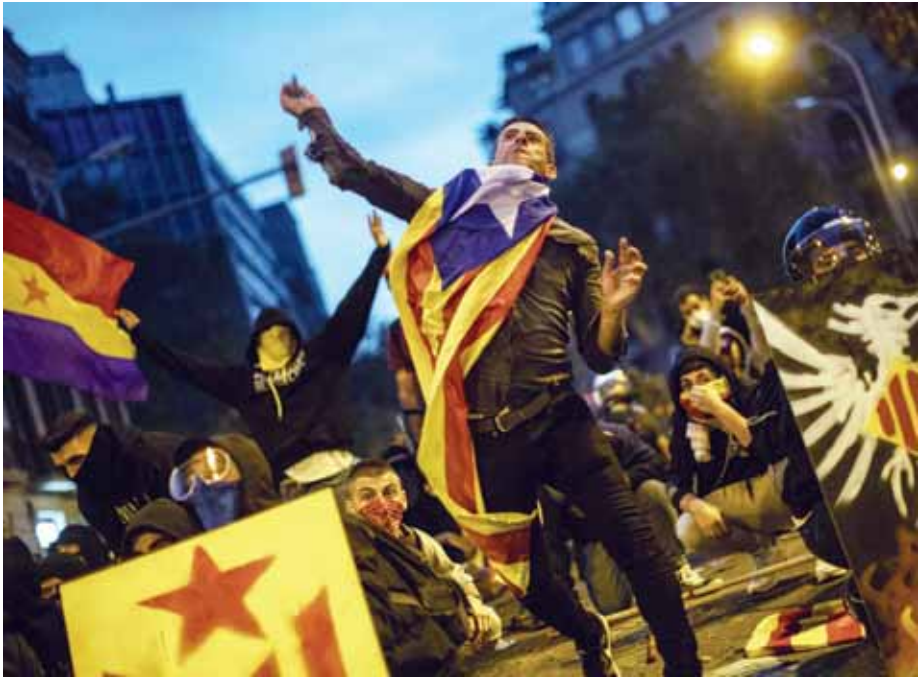
A Catalan pro-independence protestor throws a stone during clashes with police in Barcelona, Spain on Friday

In Congress, at least one Republican, Rep. Francis Rooney of Florida, spoke out publicly, telling reporters that he and others were concerned by Mulvaney's remarks. Rooney said he's open to considering all sides in the impeachment inquiry. He also said Mulvaney's comments cannot simply be undone by a follow-up statement. "It's not an Etch-A-Sketch," said Rooney, a former ambassador to the Holy See under President George W. Bush. "The only thing I can assume is, he meant what he had to say — that there was a quid pro quo on this stuff," he said. The tumult over Mulvaney's remarks capped a momentous week in the impeachment investigation as the admission, from highest levels of the administration, undercut the White House defense and pushed more evidence into the inquiry. GOP leaders tried to contain the fallout. But four weeks into the inquiry, the events around Trump's interaction with the Ukraine president, which are at the heart of impeachment, have upended Washington. A beloved House chairman, Rep. Elijah Cummings, D-Md., a leading figure in the investigation, died amid ongoing health challenges.