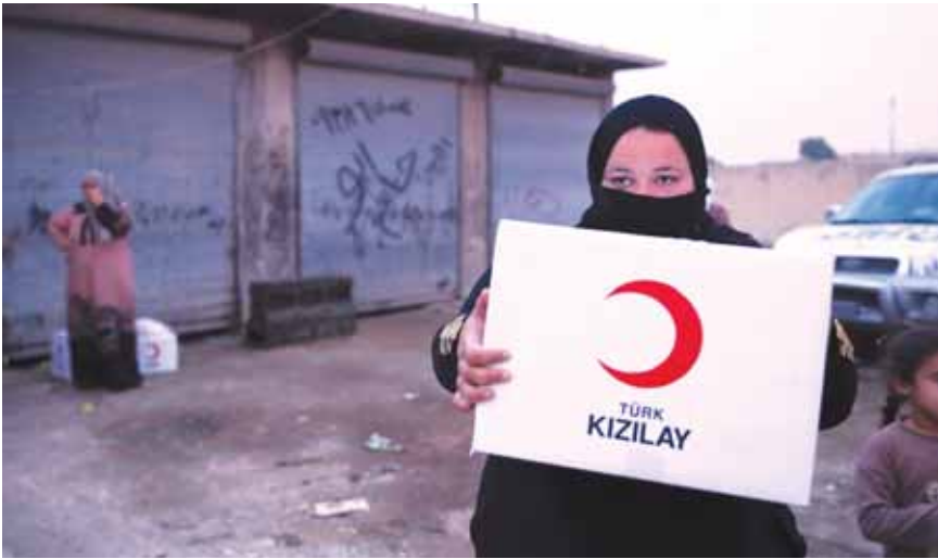
In this image provided by Turkish Red Crescent, a woman carries aid being distributed by Turkish Red Crescent in Ras Al-Ayn, Syria on October 19, 2019

kered with Ankara. "The combination of a US pullback and the escalating Turkish-Kurdish hostilities is creating a strategic nightmare for our country," McConnell wrote in his opinion piece. "Even if the five-day ceasefire announced on Thursday holds, events of the past week have set back the US' campaign against the Islamic State and other terrorists," he said. McConnell did not mention Trump by name, though he did liken the Syria withdrawal to the foreign policy of Trump's Democratic predecessor Barack Obama. "We saw the Islamic State flourish in Iraq after President Barack Obama's retreat. We will see these things anew in Syria and Afghanistan if we abandon our partners and retreat from these conflicts before they are won," McConnell wrote. "America's wars will be 'endless' only if America refuses to win them," he added in an apparent jab at Trump's insistence that the withdrawal was necessary "to get out of these ridiculous Endless Wars." AFP