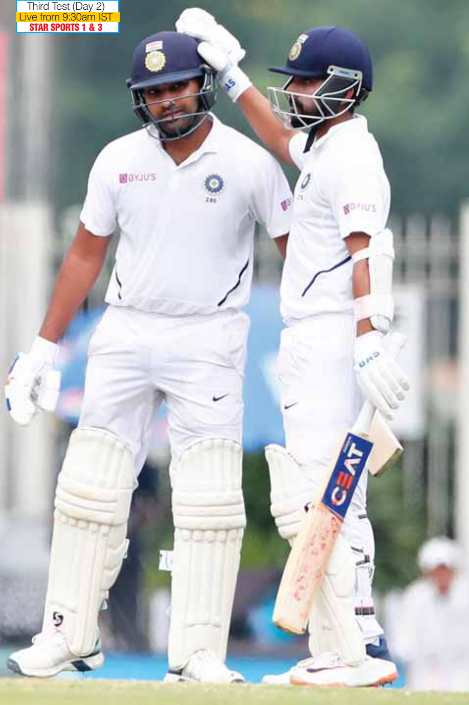
Ajinkya Rahane, right, pats on the helmet of teammate Rohit Sharma to congratulate him on scoring century

Kohli took the review but only to be turned down with an umpire's call and the skipper went back to the pavillion frustrated.