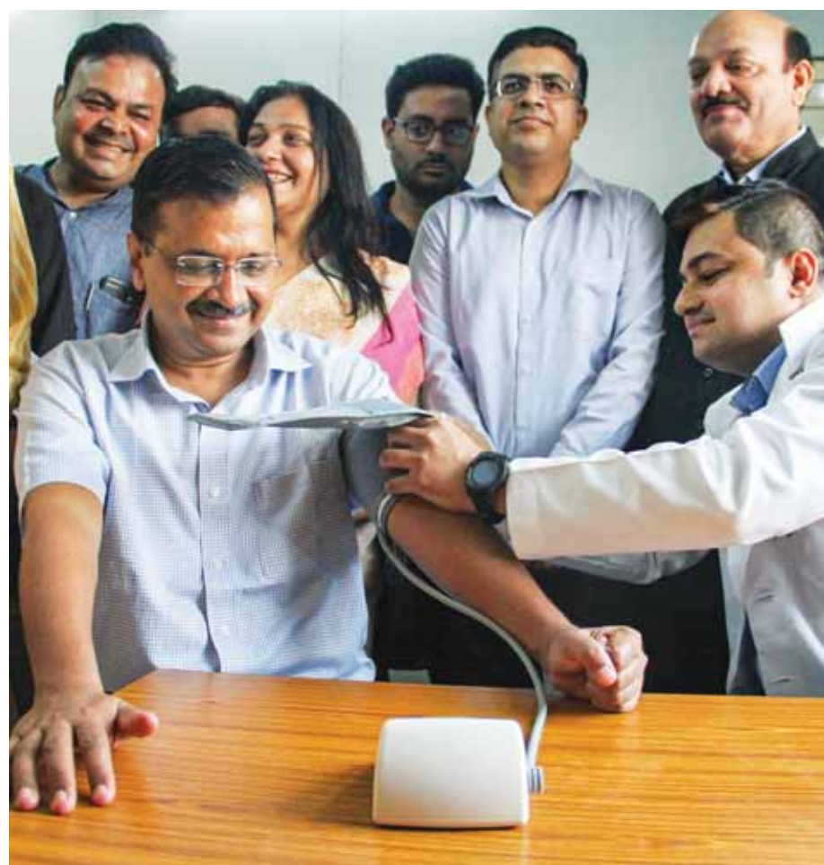
Delhi Chief Minister Arvind Kejriwal is undergoing the blood pressure check after the inauguration of an Aam Aadmi Mohalla Clinic near Sangam Vihar Flyover, Wazirabad, in Delhi on Saturday