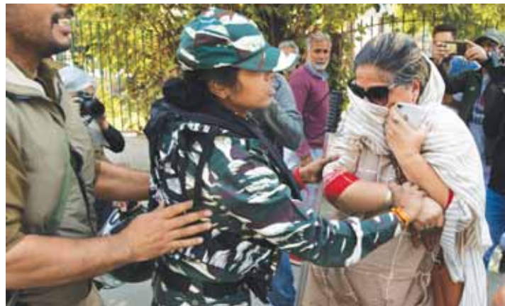
A paramilitary woman detains a Kashmiri woman who was among the protesters in Srinagar on Tuesday