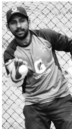
PTI ■ KARACHI

Head coach-cum-chief selector Misbah-ul-Haq is extremely disappointed with the attitude of some Pakistani players, who shy away from proper training, lack discipline and don't adhere to professional standards.