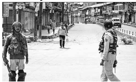
National Conference leaders expressed regret over the continued detention of political leaders and common citizens, saying the situation had touched the lowest depths

The NC said such harsh measures would further alienate the people and delay restoration of normalcy in