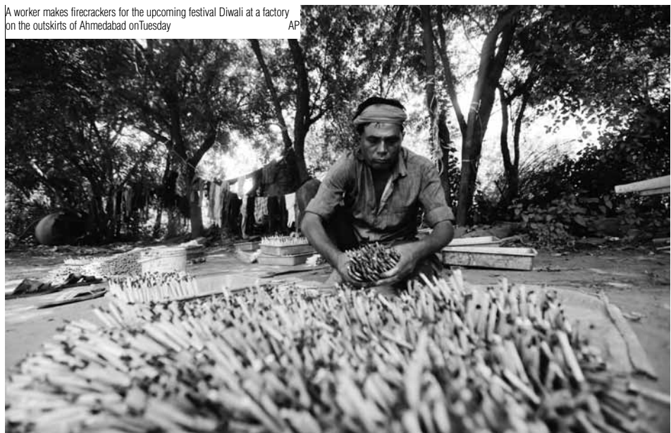
A worker makes firecrackers for the upcoming festival Diwali at a factory on the outskirts of Ahmedabad on Tuesday

This will not only increase trips but also earn revenue from the otherwise stationed coaches, he added. Dr Harsh Vardhan appreciated the work being done in all areas with a special mention of the up-gradation of stations in the National Capital Region.