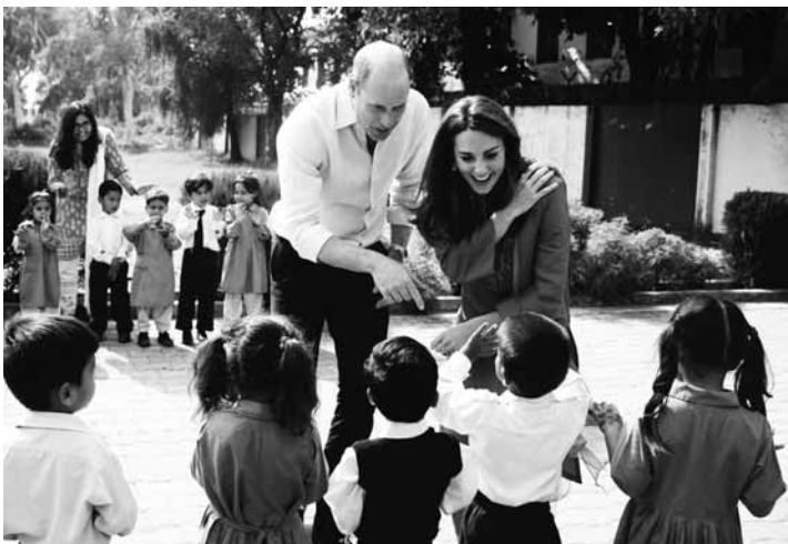
Britain's Prince William and his wife Kate interact with students during their visit to a school outside Islamabad, Pakistan on Tuesday

Sd/- Executive Engineer-cum- Resident Engineer Bihar Bhawan, New Delhi