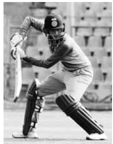
Smriti Mandhana in a file picture.

Among others batters, skipper Mithali Raj moved down to the seventh spot while her Harmanpreet Kaur rose in the rankings to the occupy the 17th place.