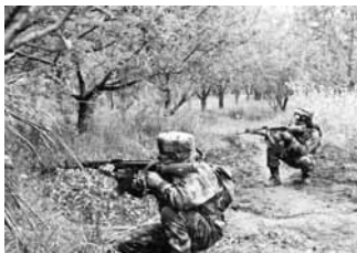
Minzoor Hussain and Naseema Akhtar.

As heavy shelling continued in the forward areas, another couple hailing from Qasba village of Poonch sector received injuries and was rushed to the nearby hospital. The injured were identified as