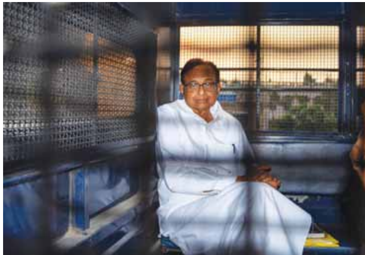
Senior Congress leader and former Finance Minister P Chidambaram after being produced in the Rouse Avenue Court in connection with the INX Media corruption case in New Delhi on Tuesday