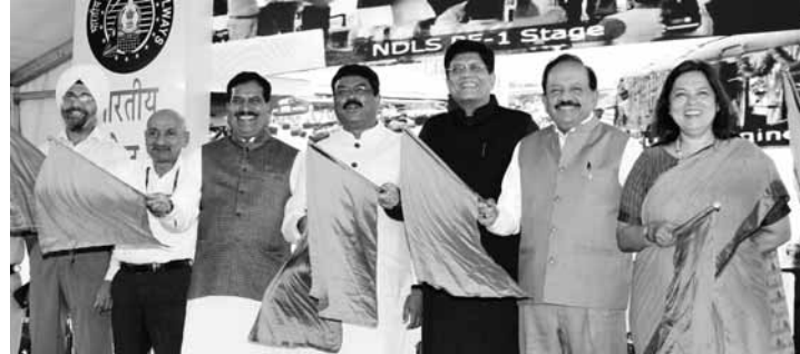
Minister of Railways Piyush Goyal, Union Minister of Petroleum & Natural Gas Dharmendra Pradhan, Union Minister for Health and Family Welfare Dr Harsh Vardhan, MoS Railway Suresh C Angadi and Meenakshi Lekhi, flagged off the inaugural run of Delhi — Shamli train service in a ceremony held at New Delhi Railway station on Tuesday

To provide better travel opportunities to passengers who have to travel to neighboring towns and cities mainly for livelihood and education purposes the Railways has initiated nine new Sewa Services spread across eight states of India. These daily or six days a week short distance services will be a boon to the daily