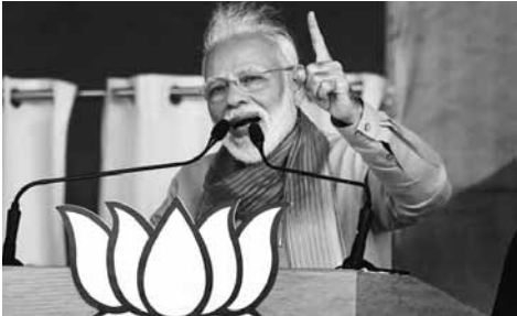
Prime Minister Narendra Modi in his rallies in Haryana on Tuesday