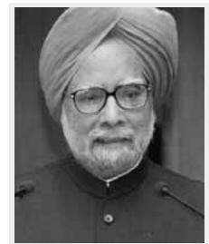
UNEMPLOYMENT PROBLEM AS MIGRATION INCREASES

Lamenting that the industrial slowdown was coming in India's way to optimally utilise its demographic dividend, Singh said: "Only in the recent