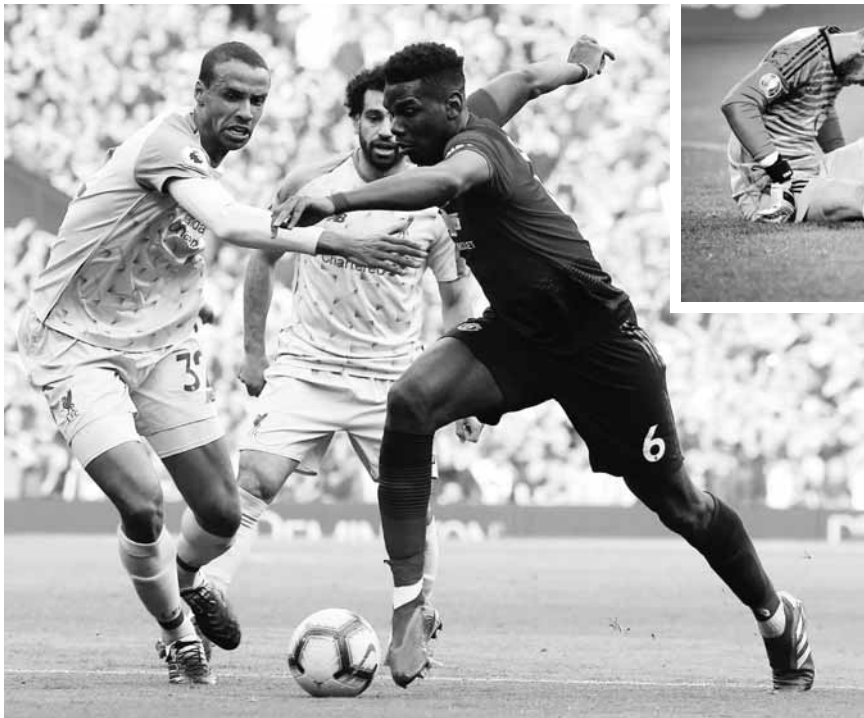
Manchester United's Paul Pogba battles for ball possession with Liverpool's Joel Matip during Premier League 2018-19 season match

Liverpool have made a perfect start to the season with 24 points from eight matches and will look to equal Manchester City's record of 18 consecutive top-flight victories when they visit Old Trafford.