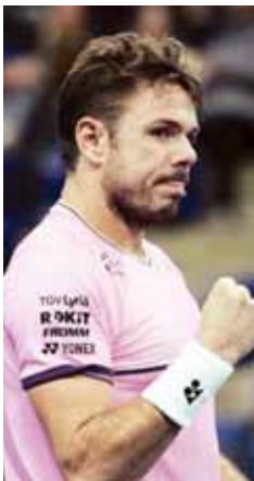
Stan Wawrinka celebrates after win