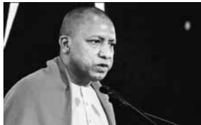
remains illuminated from Diwali till Dev Diwali, Adityanath said as he directed the PWD to make the roads free of potholes by October 30.

Roads, parks and vacant plots of land should be included in the campaign. In view of Chhath Puja, start a special campaign to clean the ghats of the Ganga, the chief minister said. Do something special so that Kashi