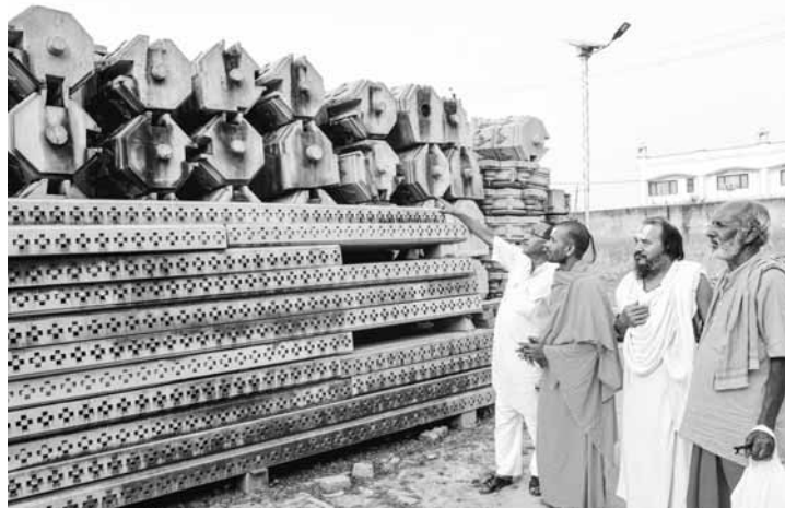
Sadhus look at stone slabs, carved-out for the construction of Ram Temple, at Shri Ram Janmabhoomi Karyashala (workshop) in Karsewakpuram, Ayodhya on Thursday

Located in the northern fringes of Kolkata, Bhatpara municipality falls under Barrackpore Lok Sabha constituency, which is now represented by Arjun Singh of BJP.