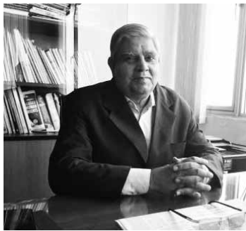
including Union Home Minister Amit Shah.

The Governor had on Tuesday said that he was deeply hurt at the treatment allegedly meted out to him at the Durga Puja Carnival on Red Road on October 11. Usually governors are given state police cover.