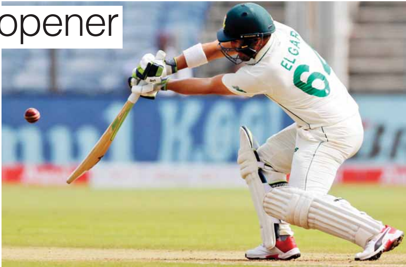
South Africa's Dean Elgar bats during fourth day of second Test between India and South Africa in Pune