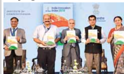
NITI Aayog Vice-chairman Rajiv Kumar, with others, launches the India Innovation Index prepared by NITI Aayog in New Delhi on Thursday