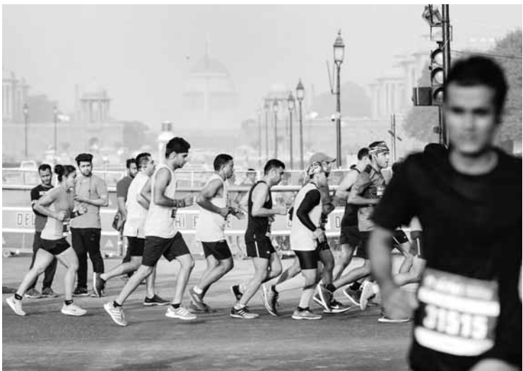
Participants seen at Rajpath during the 15th Airtel Delhi Half Marathon on Sunday in New Delhi

Not many overseas Indians turn up to cast their votes as they do not want to spend foreign currency to come to India for the purpose, officials said.