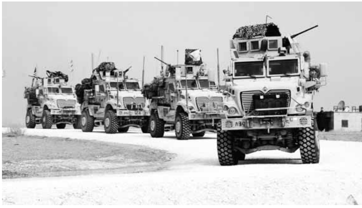
American military convoy stops near the town of Tel Tamer, north Syria on Sunday

That brought the Turkish military's death toll to seven