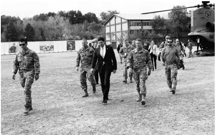
US Defense Secretary Mark Esper walks Gen. Scott Miller chief of the US-led coalition in Afghanistan, at the US military headquarters in Kabul, Afghanistan on Sunday