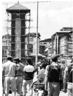
Andaman and Nicobar Islands.

“Approval has been given for the transfer of about 385 Ladakhi-origin police personnel to Ladakh and they will function under the new UT which will come into existence on October 31,” a Ministry official said. The police personnel will work with the Ladakh UT Police, which will be under the direct control of the MHA. The police personnel — from the rank of constable to inspector — will also get the pay and perks available to police personnel of other UTs like Chandigarh and