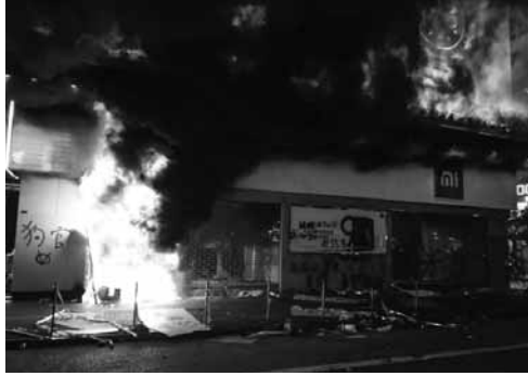
Protesters set fire to a Xiaomi shop at Nathan road in Hong Kong on Sunday