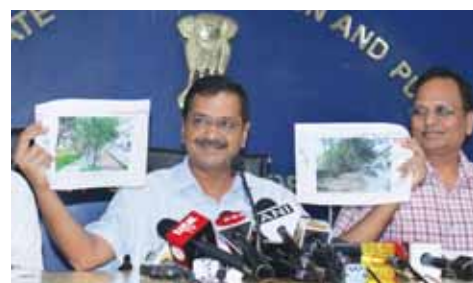
Delhi Chief Minister Arvind Kejriwal addresses a Press conference in New Delhi on Tuesday

The stretches include Ring Road from Mayapuri to Moti Bagh Junction, Satguru Ram Singh (Road No. 36) Marg from Mayapuri Chowk to SD Public School, Britannia Chowk to Outer Ring Road, West Enclave, Pritampur, Road No 41 and 41-A from Wazirpur Depot Crossing (NSP) to Rithala Metro Station,