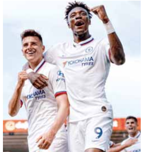
Tammy Abraham (9) celebrates with Mason Mount after scoring

Conte's side bank on Belgian striker Romelu Lukaku, who got off the mark in his first league match against Lecce and has since scored five goals in eight Serie A games since departing Old Trafford under a cloud last summer.