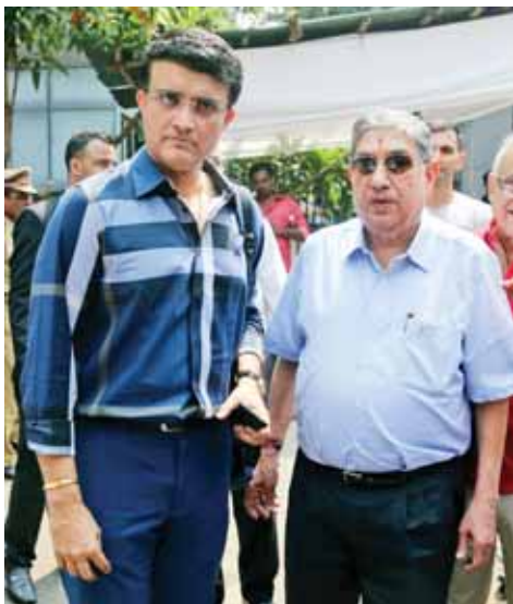
Sourav Ganguly poses for photographs with N Srinivasan as he arrives to file nomination for the post of BCCI president at the board headquarters

However Ganguly will have a curtailed tenure of around nine months as he would need to demit office by the end of July, next year as per the provisions of new constitutions, which makes 'Cooling Off' period