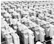
all 288 Assembly constituencies in the State.

A day after the State Assembly polls, Maharashtra Pradesh Congress Committee (MPCC) president Balasaheb Thorat— in a representation made to the Chief Electoral Officer (CEO), Maharashtra, said that "a large section of our citizens apprehend that these EVMs can be tampered with" and sought installation of "network jammers" in and around strong rooms storing EVMs in