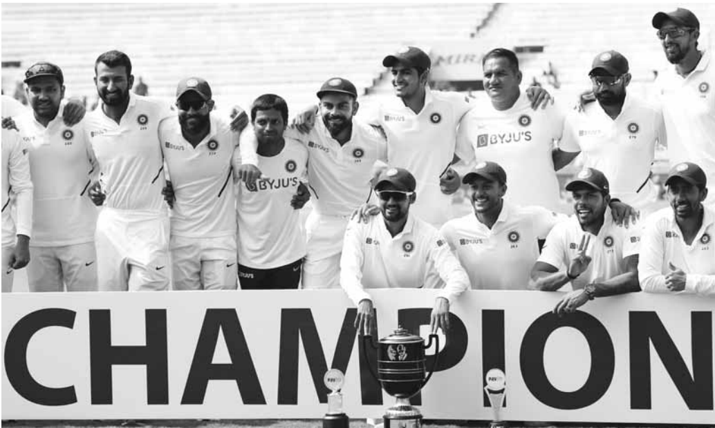
Members of Indian team pose with the winners trophy after their win on the fourth day of third and last Test match between India and South Africa in Ranchi

Rarely has there been a series where the impact of pacers has