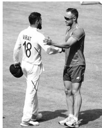
Indian captain Virat Kohli shakes hand with Faf du Plessis