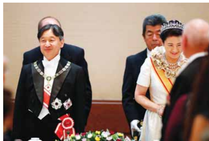
Japan's Emperor Naruhito, left, and Empress Masako, right, host the court banquet, in Tokyo on Tuesday. Japan's Naruhito proclaimed himself Emperor during an enthronement ceremony at the Imperial Palace, declaring himself the country's 126th monarch

are operating with varying degrees of restrictions in different districts of the State.