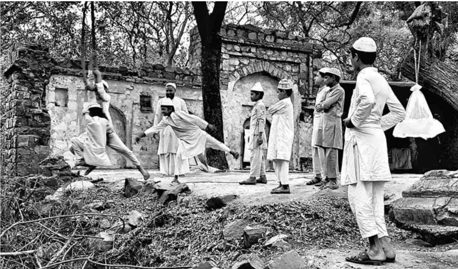
The swing, Mehrauli Archaeological Park, Delhi; Archival Pigment Print

BLACK AND WHITE IS ABSTRACT; COLOR IS NOT. LOOKING AT A BLACK AND WHITE PHOTOGRAPH, YOU ARE ALREADY LOOKING AT A STRANGE WORLD —JOEL STERNFELD