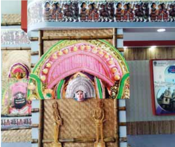
Arts displayed during third day of 'Diwali Mela' organised by Jharkhand IAS Officers Wives Association (JIASOWA) at Morhabadi Ground in Ranchi on Saturday