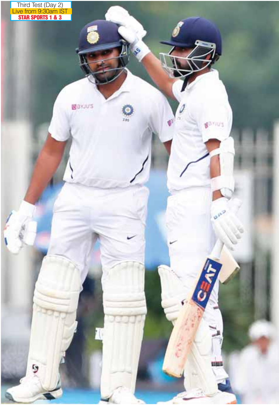
Ajinkya Rahane, right, pats on the helmet of teammate Rohit Sharma to congratulate him on scoring century during first day of third Test against South Africa at Jharkhand State Cricket Association Stadium in Ranchi

Kohli took the review but only to be turned down with an umpire's call and the skipper went back to the pavillion frustrated.