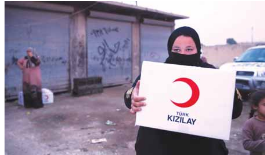
a woman carries aid being distributed by Turkish Red Crescent in Ras Al-Ayn, Syria on October 19, 2019

kered with Ankara. "The combination of a US pullback and the escalating Turkish-Kurdish hostilities is creating a strategic nightmare for our country," McConnell wrote in his opinion piece. "Even if the five-day ceasefire announced on Thursday holds, events of the past week have set back the US' campaign against the Islamic State and other terrorists," he said. McConnell did not mention Trump by name, though he did liken the Syria withdrawal to the foreign policy of Trump's Democratic predecessor Barack Obama. "We saw the Islamic State flourish in Iraq after President Barack Obama's retreat. We will see these things anew in Syria and Afghanistan if we abandon our partners and retreat from these conflicts before they are won," McConnell wrote. "America's wars will be 'endless' only if America refuses to win them," he added in an apparent jab at Trump's insistence that the withdrawal was necessary "to get out of these ridiculous Endless Wars." AFP