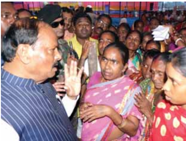
Chief Minister Raghubar Das interacts with local women during his 'Jan Chaupal' programme at Litipara, Pakur district on Saturday

While discharging these duties, houses were constructed, electricity, roads were provided. Work of women empowerment took place. The