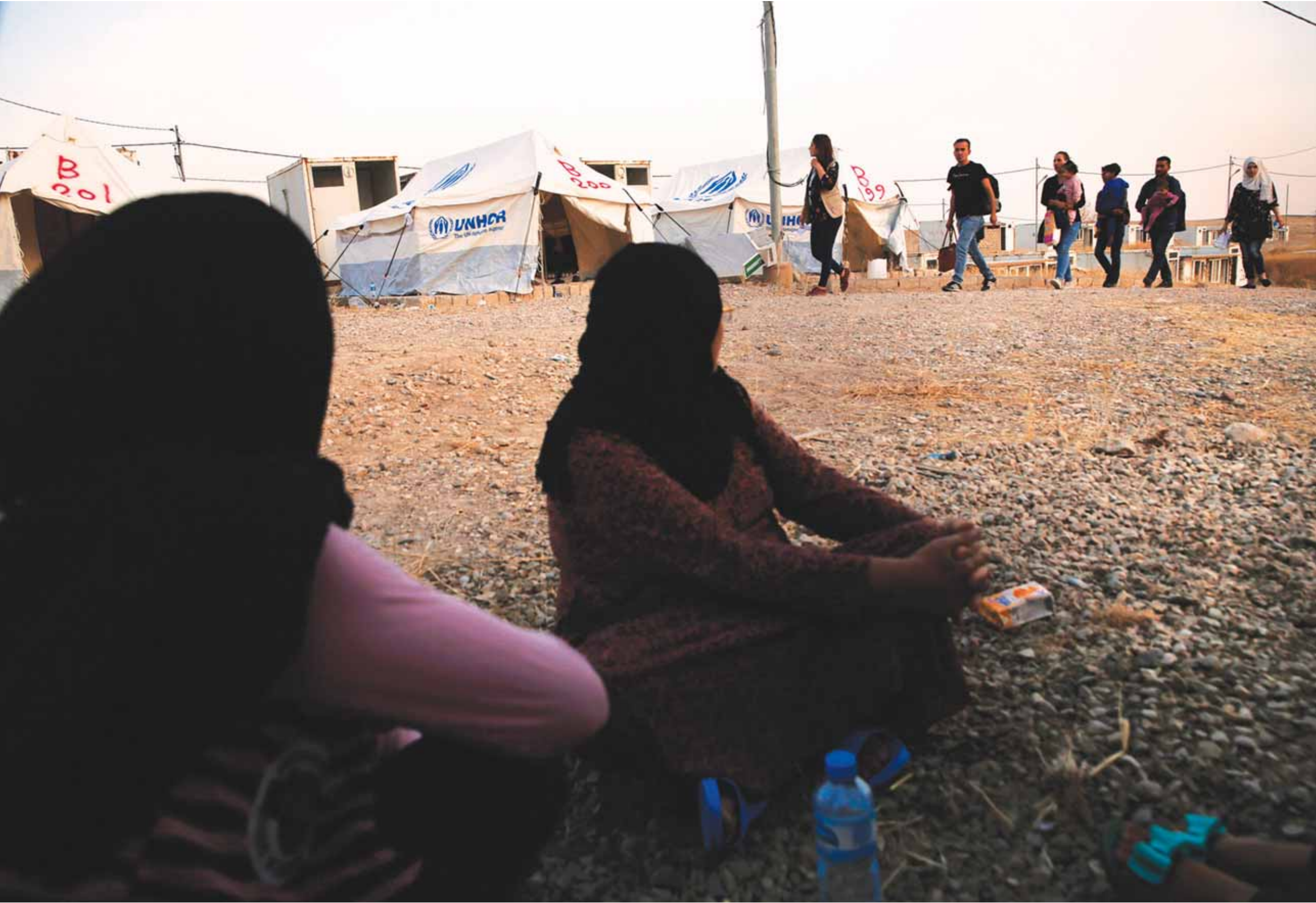
In this October 17, 2019 file photo, Syrians who were displaced by the Turkish military operation in northeastern Syria, carry their belongings as they walk to receive a tent at the Bardarash refugee camp, north of Mosul, Iraq.