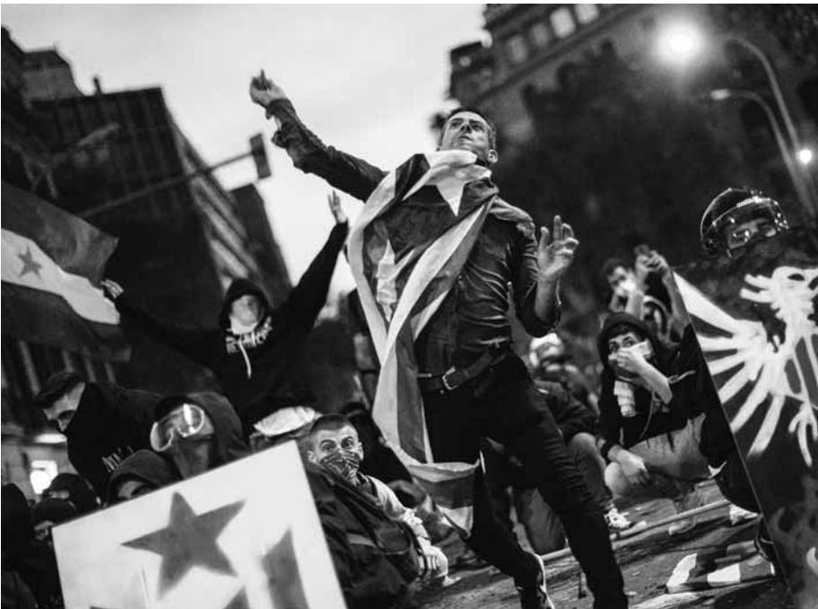
A Catalan pro-independence protestor throws a stone during clashes with police in Barcelona, Spain on Friday

not made sufficient progress in four parameters — international cooperation, supervision, legal persons and arrangements and targeted financial sanctions on proliferations (North Korea and Iran), the daily said. At its meeting at Buenos Aires, Argentina in October 2017, the FATF listed Sri Lanka as a jurisdiction with strategic AML/CFT deficiencies which is more commonly identified as “Grey List” and provided a time-bound action plan, the report said.