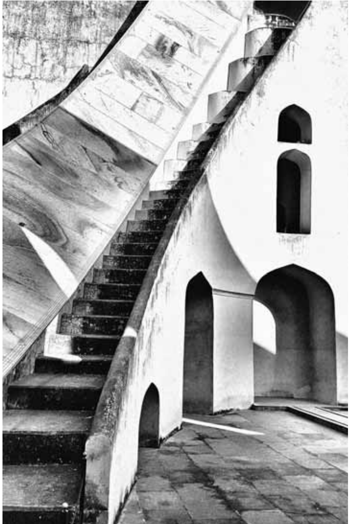
Jantar Mantar, Jaipur; Archival Pigment Print