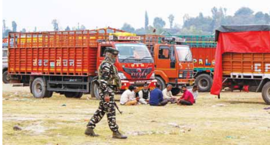
A security person patrols as trucks stand parked at a safe zone for fruit dealers in Shopian on Saturday.

On an average, one truck carries 800 to 1,000 apple boxes. Transporters are charg-