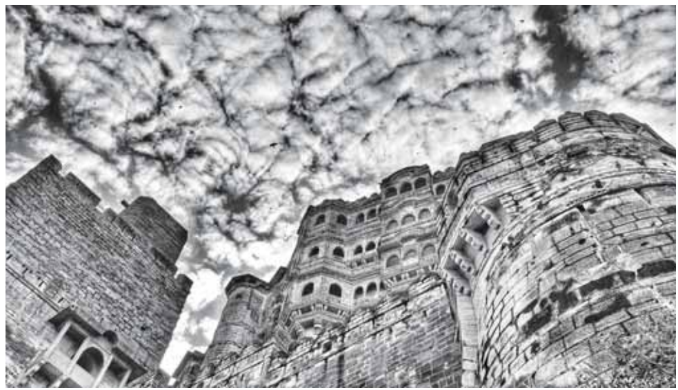
Early morning, Mehrangarh Fort, Jodhpur I; Archival Pigment Print