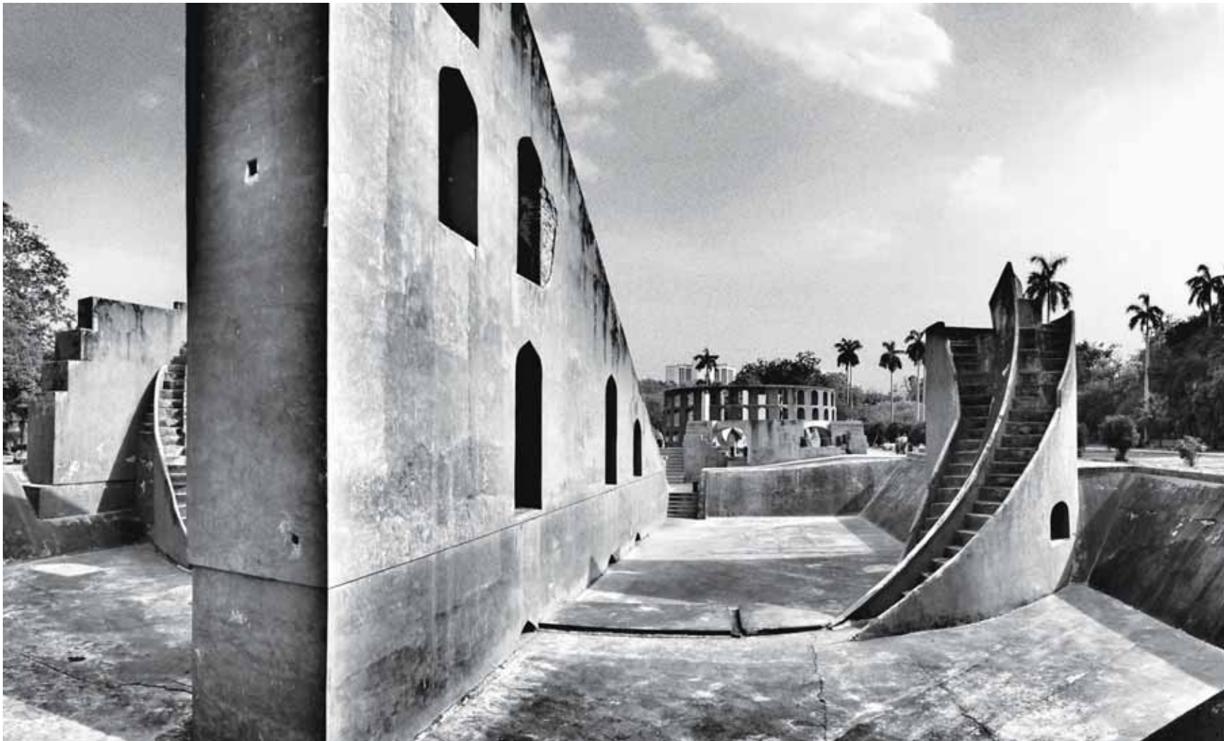
Jantar Mantar, Delhi; Archival Pigment Print