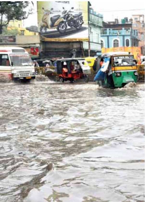
Vehicles wade through a waterlogged road during heavy rainfall in Ranchi on Saturday. The Capital city witnessed 33 MM rainfall between 8:30 am and 5:30 pm on Saturday