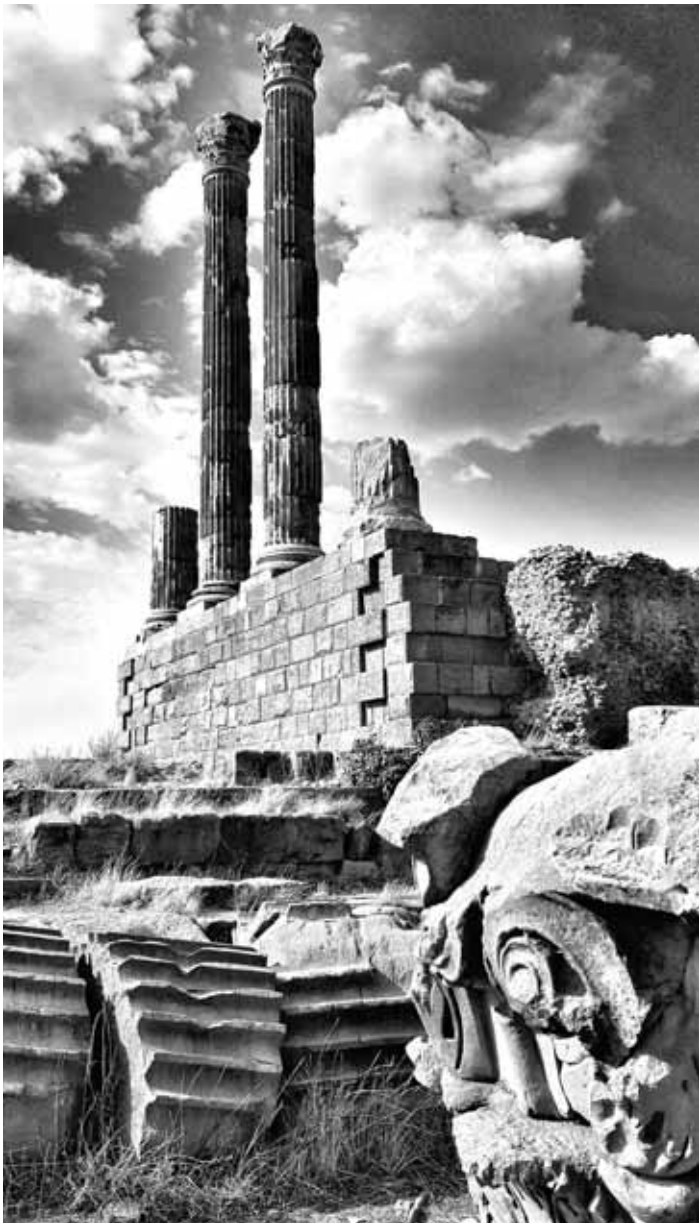
Untitled; Digital print on photorag bright white paper

"I've been visiting all the places where this history took place — the battlefields and ruins, the mosques, sufi shrines and temples, the paradise gardens and pleasure grounds, the barrack blocks and townhouses, the crumbling Mughal havelis , the palaces and forts," he says. For sure, each photograph captured by Dalrymple reveals a narrative tension within itself, between stillness and movement, history and reality, creating a wrinkle in time that highlights an intermingling of the monumental past and fleeting present. A Photofeature.