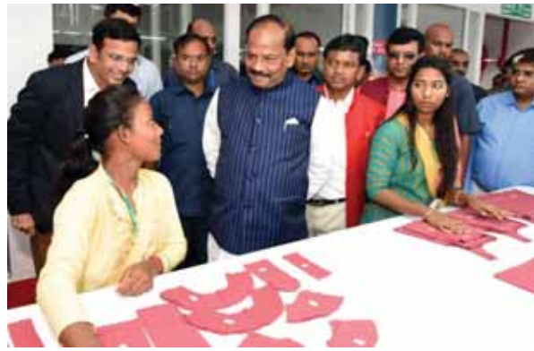
Chief Minister Raghubar Das inspects a new centre of Kaushal Kishore Exports Centre for the rural girls for self-dependant and also to earn money by making school dresses for children at Ormanjhi near Ranchi on Saturday

"The present Government is working to get rid of this problem. The Government is promoting industries for the girls to get employment in Jharkhand itself. Industries, in which costs are low and employment opportunities are high. The textile industry is the leader in this. Jharkhand has the best textile policy in the country. This is the reason why big textile companies are starting production here. In the coming days, other companies will also come here," said the CM during the inauguration ceremony of the second unit of Kishore Export in Kulhi