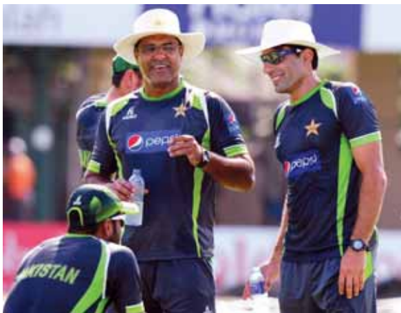
Newly appointed Pakistan head coach Misbah-ul-Haq & bowling coach Waqar Younis during practice session

Misbah will be Pakistan's 30th head coach — but it is the first time that the head coach will also be the chief selector, along the lines of the system in New Zealand.