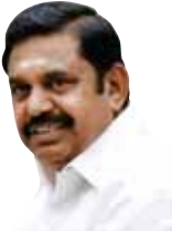
Tamil Nadu CM —Edappadi K Palaniswami

As far as I am concerned, I have come up one step in politics. I had never even dreamt of becoming Chief Minister. Still, (I have) got an opportunity.