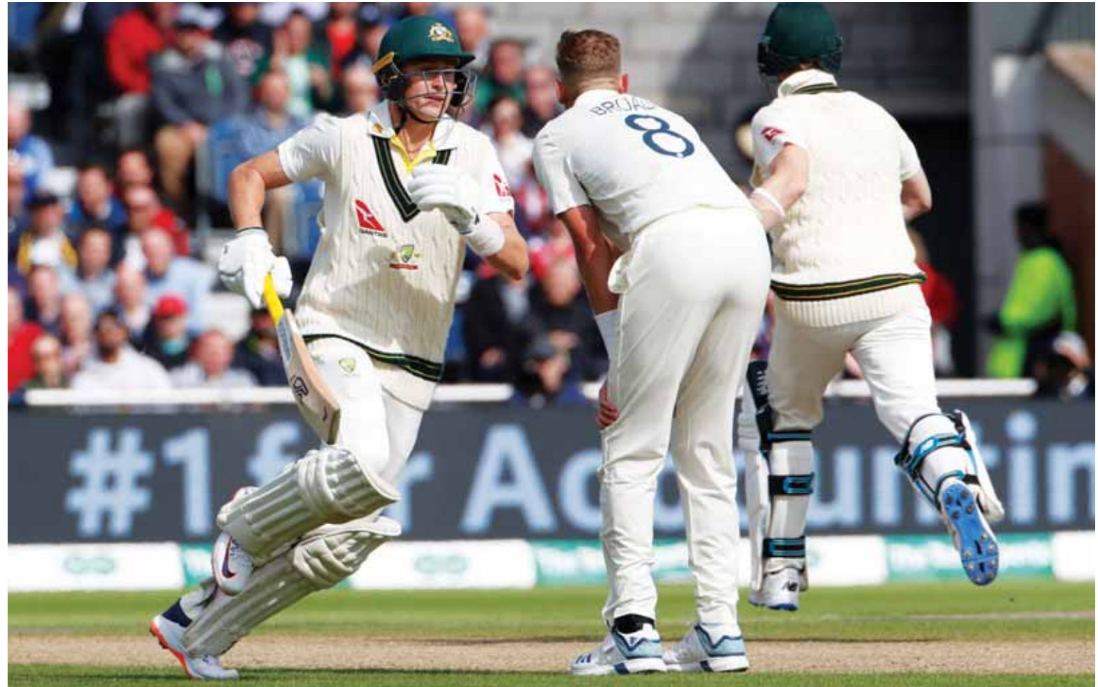
Australia's Marcus Labuschagne, left, and Steve Smith take a run during day one of the fourth Ashes Test at Old Trafford in Manchester

Smith, Labuschagne add 116 runs for 3rd wicket to lead visitors fightback