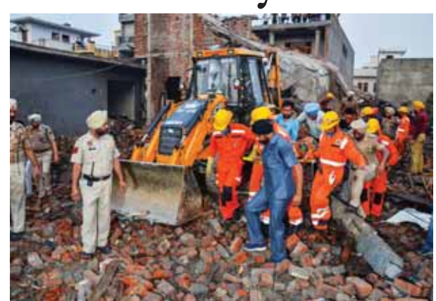
Rescue works underway after a blast in a firecracker factory at Batala in Gurdaspur district of Punjab on Wednesday

Meanwhile, Punjab Chief Minister Capt Amarinder