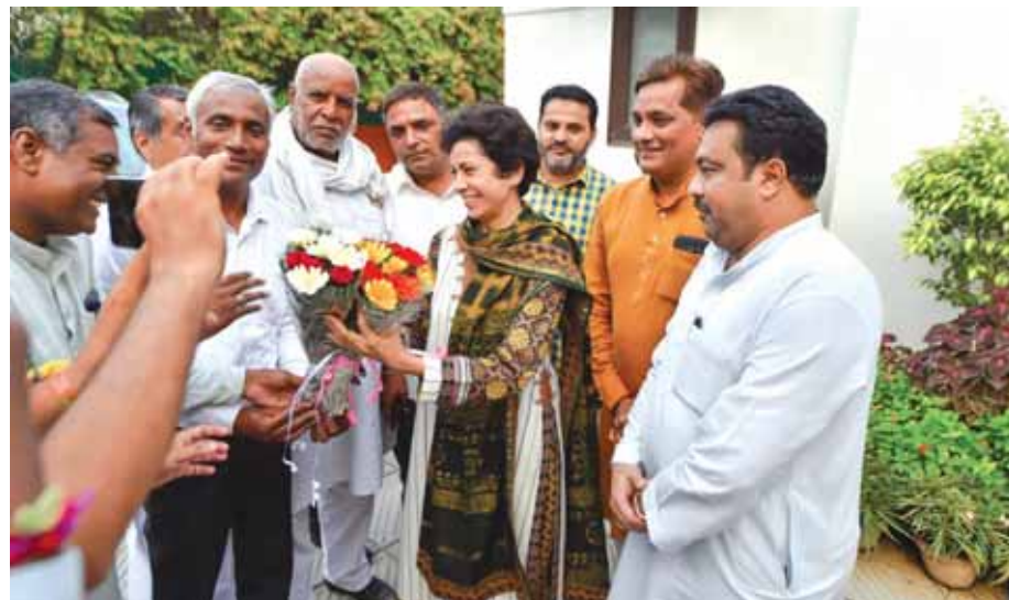
Congress leader Kumari Selja being greeted by supporters after she was appointed Haryana Congress president, at her residence in New Delhi on Wednesday

The next move of the interim party chief is to replace the party chiefs at Uttar Pradesh and Madhya Pradesh and give