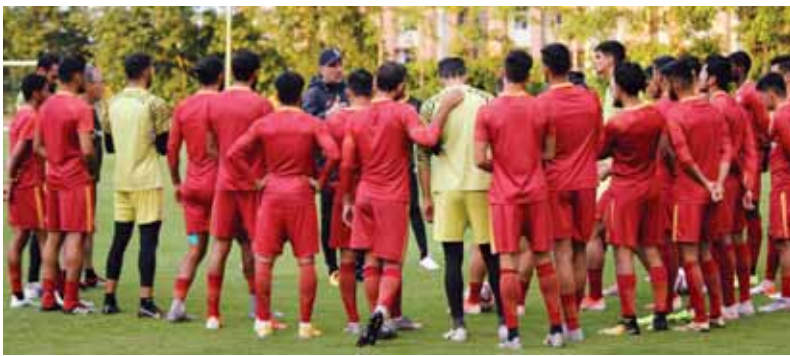
Indian players' chat during team's practice session ahead of FIFA World Cup qualifier against Oman

The 18-year-old, who captained India in the U-17 World Cup at home two years ago, was the only player who featured in all five matches since Stimac's appointment.