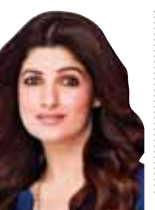
Actor —Twinkle Khanna

Is Pluto a planet or a YouTube makeup guru ? One minute you are a planet, then you are cancelled, then you are a planet again. The drama — oh, the drama.