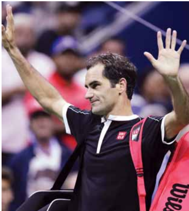
Roger Federer thanks the crowd after a loss to Grigor Dimitrov

"He can, but I don't think he will. I think it's going to be really difficult," Wawrinka said. "Because he looks to start to be tired, and he has to beat some more tougher player in the semi-final and then in the final."