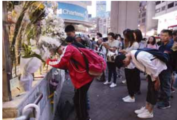
People pay their respects for protesters who were injured on Aug 31 outside Prince Edward station in Hong Kong on Wednesday