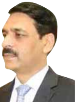
Pak Army spokesperson —Asif Ghaffoor

Maybe India thinks that it should take action against us that would weaken us. We want to tell India that wars are not only fought with weapons but with patriotism.