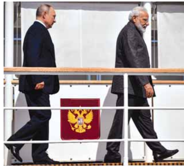
Prime Minister Narendra Modi and Russian President Vladimir Putin visit shipyard Zvezda outside the far-eastern Russian port of Vladivostok on Wednesday

His remarks without naming any country came against the backdrop of tension