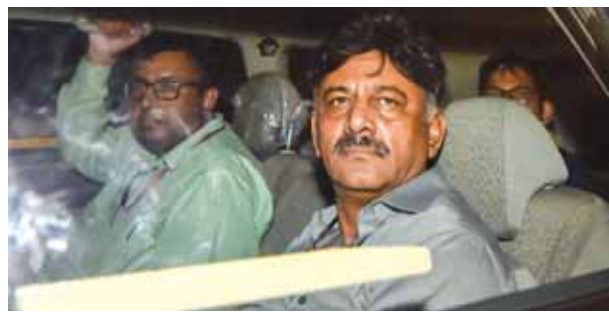
Karnataka Congress leader DK Shivakumar leaves after being produced at Rouse Avenue Court in New Delhi on Wednesday

Contesting ED's contentions, Shivakumar's counsel said the Congress leader has