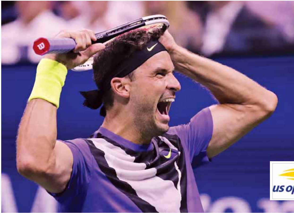
Grigor Dimitrov reacts after defeating Roger Federer during the quarterfinals of the US Open tournament. Dimitrov won 3-6, 6-4, 3-6, 6-4, 6-2

Medvedev defeated three-time Grand Slam champion