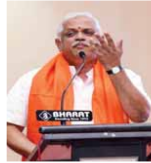
and named party leader Motilal Vora and former Haryana Chief Minister Bhupinder Singh Hooda in it.

Besides, the ED had earlier filed its first chargesheet in a case of alleged irregularities in land allotment to the Congress-promoted Associated Journals Limited in Panchkula