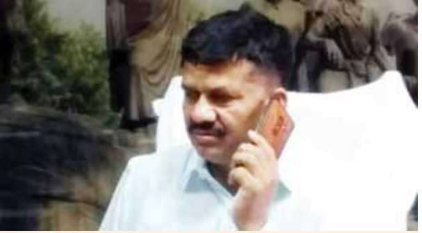
The Ghaziabad Municipal Corporation has taken a positive initiative for the maintenance and upkeep of the Ashriti Gauravansh. In this regard, an institute called the Society of People for Animal Welfare has been set up.