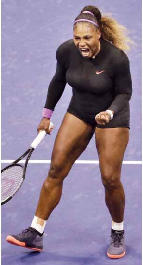
Serena Williams reacts after winning a point during her match against Qiang Wang in the US Open quarterfinals on Wednesday morning (IST)

Williams captured her last Slam title at the 2017 Australian Open while preg-