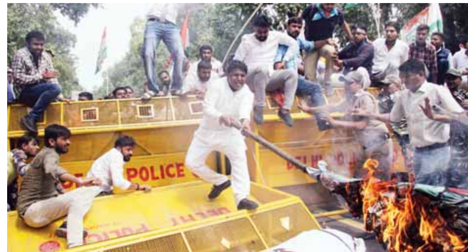
Youth Congress members clash with the security personnel during a protest against the arrest of Karnataka Congress leader DK Shivakumar by Enforcement Directorate (ED) officials, at Raisina Road in New Delhi