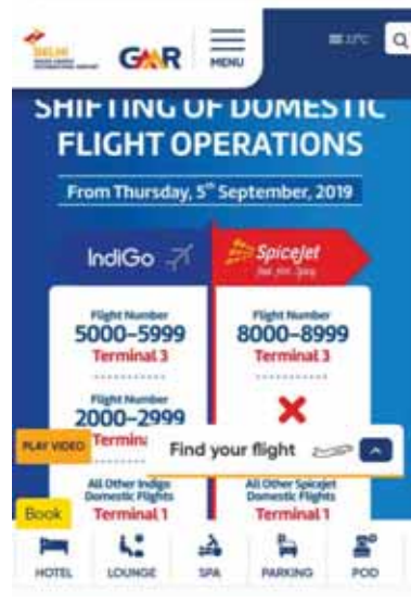
Indigo would shift a portion of its operations from T2 to T3, SpiceJet would shift all of its domestic flights, operating from T2, to T3. Post the shift, the SpiceJet flights- SG 8000 to SG

For air travellers' convenience, Delhi International Airport Limited (DIAL) has issued 7,000 pocket cards with flights information available to taxi drivers to convey about the operations of certain flights. Notably, SpiceJet and IndiGo will shift their flight operations partially from the intervening night of September 4-5. While airlines are conveying changes to passengers via emails and SMS, DIAL is taking care of airside area with the placement of bilingual directional and informative signage at the strategic location. Elaborating about preparations, DIAL official told The Pioneer the installation of MTV screens will display all flight operations. "We have trained our staff. The staff will be deployed and tell passengers about terminals corresponding to flights." There will be shuttle services for the passengers in need.