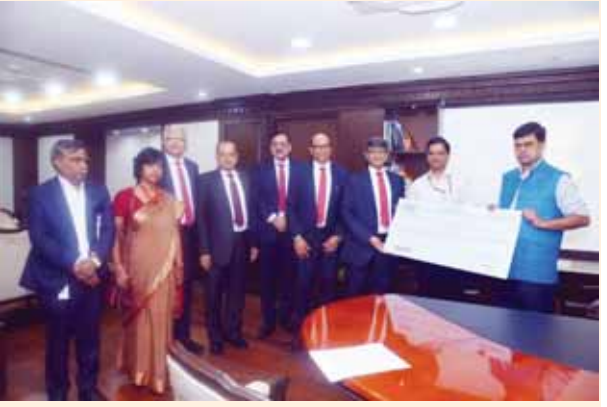
For the financial year 2018-19, NTPC Ltd. has paid final dividend of ₹2,473.64 crore, being 25% of the paid-up equity share capital of the Company.