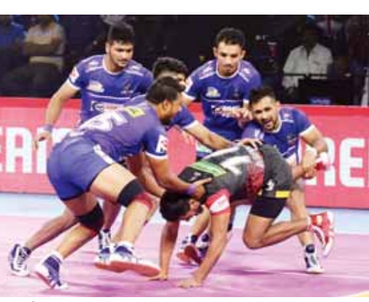
Haryana Steelers players' attempt to successfully catch opposition raider during Pro Kabaddi League season 7 match

Travis Head survived several close calls, including a Stokes review for lbw, to reach a rescheduled tea on 18 not out and further rain during the interval ended play for the day.