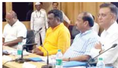
Chief Minister Raghubar Das, Art, Culture, Sports & Youth Affairs Minister Amar Kumar Bauri alongwith senior officials during a meeting at Project building in Ranchi on Thursday

The CM, on the occasion, also asked the Kamal Clubs, which have not been registered to get registration so that the benefits of government scheme