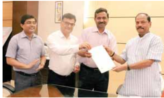
Chief Minister Raghubar Das congratulates officials of Higher, Technical Education and Skill Development department along with Director of Industries, CEO of Jharkhand Skill Development Mission Society and all other personnel, in Ranchi on Thursday

The CM further said that the goal of the government is to employ the youth and empower them financially. As