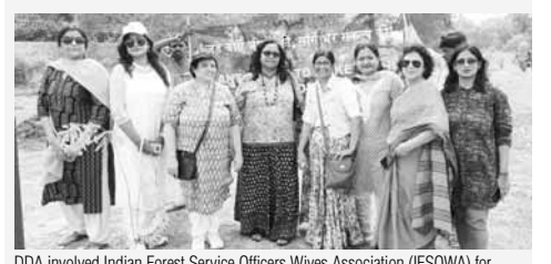
DDA involved Indian Forest Service Officers Wives Association (IFSOWA) for planting in park near CWG flats Akshardham on September 9, 2019 to make Delhi pollution free. IFSOWA has shown willingness to take care of planted saplings in future also and they will visit regularly to check the health of the planted saplings. Nearly 300 indigenous tree saplings were planted in the park