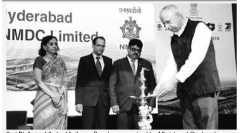
2nd Bi-Annual 3-day Vigilance Conclave organised by Ministry of Steel and NMDC Limited commenced today at Hyderabad with over 150 Delegates from various CPSEs under Ministry of Steel across the country. The primary objective of this conclave is to sensitize officials on issues pertaining to Procurement, Tendering, Vigilance, Finance, Legal and Works. The conclave started with Guru Vandana as a tribute to Dr. Sarvepalli Radha Krishna, as 5th September happens to be Teachers Day