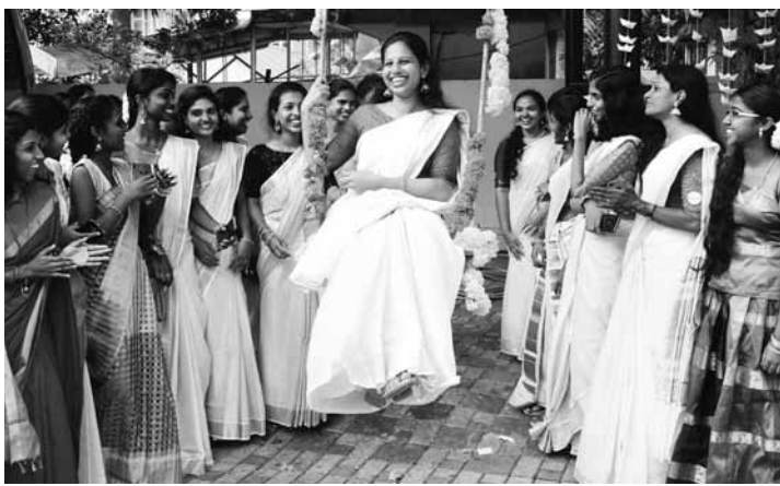
College students dress in traditional clothes to celebrate Onam festival in Kochi on Thursday