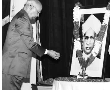
President Ram Nath Kovind pays floral tributes to the portrait of the former President of India, Dr. Sarvepalli Radhakrishnan, on the occasion of his birth anniversary at Rashtrapati Bhavan in New Delhi on Thursday