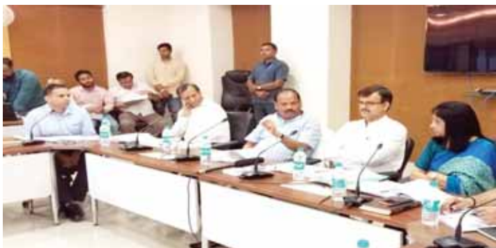
Chief Minister Raghubar Das holds review meeting with Energy department officials at Project building in Ranchi on Thursday

Das said that completion of transmission work will ensure better quality electricity in far off areas, while situation will also improve in the urban areas. He said that work should be completed by the time given by contractors; else their funds will be