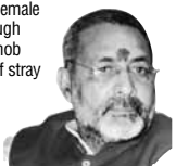
Union Minister — Giriraj Singh

In the near future, only female calves will be born through semen. Now, cases of mob lynchings in the name of stray cattle won't be reported.