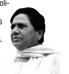
BSP chief — Mayawati

Upset over the anti-people policies of the Congress, people rejected it. BJP Governments at the Centre and in UP are repeating the same mistakes.