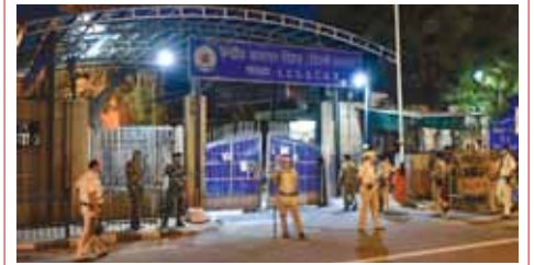
Police personnel stand guard outside Tihar Jail ahead of the arrival of former Finance Minister P Chidambaram in New Delhi on Thursday