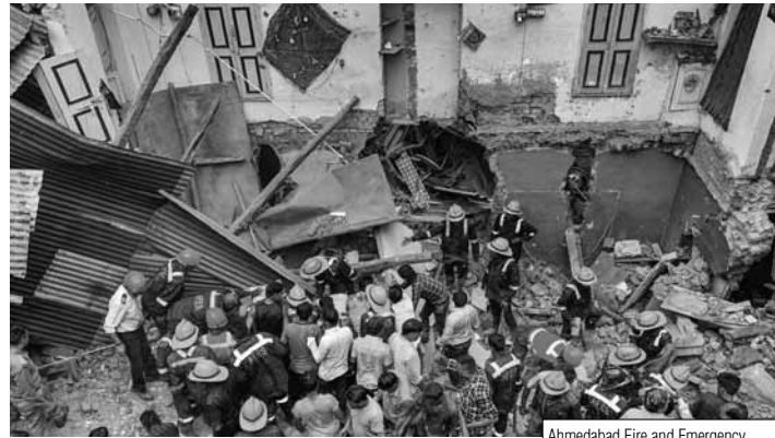
Old woman - were declared as 'brought dead' by doctors, said hospital authorities, adding eight others are currently under

Of the total 11 people referred to the hospital, three - an elderly couple and a 36-year-