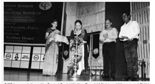
CISF in association with Central Social Welfare Board (Ministry of Women and Child Development) organised general sensitization session on family counseling services for CISF personnel and their families, at Metro Bhawan Auditorium, New Delhi