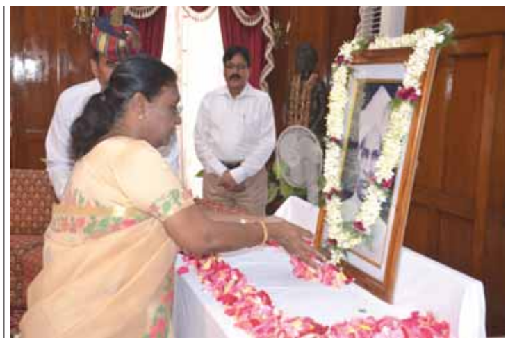
Governor Droupadi Murmu pays tribute to former President Sarvepalli Radhakrishnan on his birth anniversary, at Raj Bhawan in Ranchi on Thursday