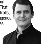
Congress leader — Rahul Gandhi

I thank all those from whom I've learnt over the years. That includes the social media trolls, some journalists with an agenda and my political adversaries.