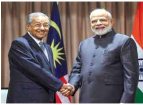
Prime Minister Narendra Modi shakes hands with his Malaysian counterpart Mahathir Mohamad on the sidelines of 5th Eastern Economic Forum at Vladivostok in Russia on Thursday