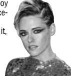
Actor — Kristen Stewart

I think I just wanted to enjoy my life. And that took precedence over protecting my life, because in protecting it, I was ruining it.