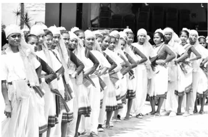
Students of Ursuline Convent pose for a photo during a cultural programme on the occasion of Teacher's Day in Ranchi on Thursday.