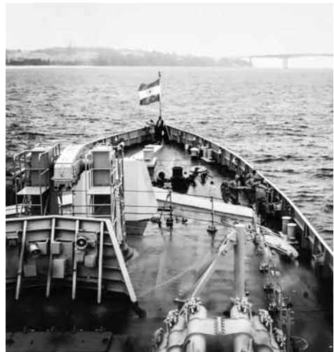
An Indian Navy ship makes a port call at Sihanoukville, Cambodia, on Thursday. The ships are part of the Indian Navy's Eastern Fleet under the Operational Command of Flag Officer Commanding-in-Chief, Eastern Naval Command, based at Visakhapatnam

The two ships, equipped with an array of weapons and sensors, can carry multi-role