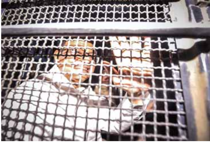
Congress leader and former Finance Minister P Chidambaram being taken to Tihar Jail in connection with the INX Media corruption case in New Delhi on Thursday

Solicitor General Tushar Mehta, representing CBI, assured that there will be adequate security for Chidambaram in the jail. The special court also issued notice to the ED on Chidambaram's plea seeking to surrender in the money laundering case lodged by the agency in which the apex court on Thursday dismissed his plea against the August 20 order of the Delhi High Court denying him pre-arrest bail.