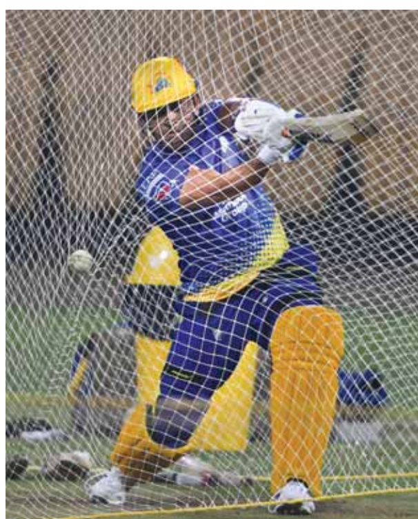
Mahendra Singh Dhoni bats during Chennai Super Kings nets session

One of the most awaited parts of this year's Indian Premier League (IPL), which currently stands suspended due to the coronavirus outbreak, was the return of Mahendra Singh Dhoni to the cricket field. Dhoni last played in the World Cup 2019 semi-final against New Zealand and since then has been on a sabbatical. It was believed that Dhoni's performance in the IPL would decide if he will be a part of India's T20 squad. But cricketer-turned-commentator Aakash Chopra begs to differ. The former India opener said that he believes it's a huge misconception people had that Dhoni's comeback into the Indian team would be based on his performance in the IPL. "It's a huge misconception that Dhoni's comeback to the Indian team was dependent on his performance in the IPL," Chopra said. "If that is how we will view Dhoni as a player and his