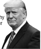
US President —Donald Trump

I never even thought of changing the date of the election due to the Coronavirus pandemic. Why would I do that? November 3, it's a good number.