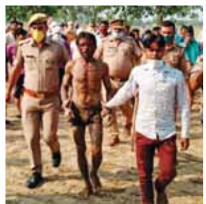
Police arrest a suspect involved in the murder of two temple priests, in Bulandshahr on Tuesday

After the news spread about the murder, tension ran