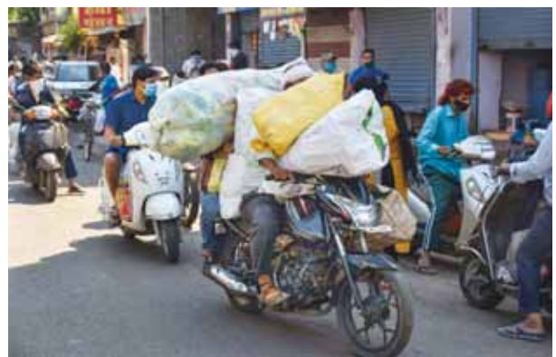
People return from a market carrying essential items in Jabalpur on Tuesday

Maharashtra, Gujarat and Delhi remained the worst affected States, while Madhya Pradesh stole march over Rajasthan on Tuesday to occupy the fourth place. Rajasthan, Tamil Nadu, UP and Andhra