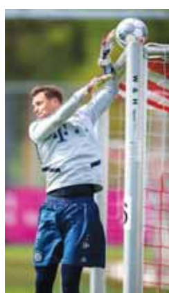
Manuel Neuer in training session

The sports ministers of Germany's 16 states met on Monday and announced in a statement that it is "justifiable" for the league to resume "in empty stadiums" from "the middle or end of May".