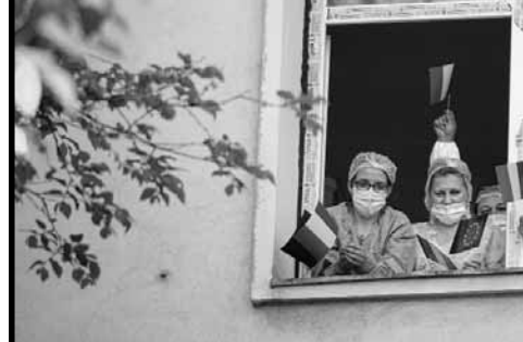
Medical staff of the Polizu maternity hospital hold European Union and Romanian flags while standing in a window to listen to a violinist playing to entertain them and the patients in Bucharest, Romania, on Tuesday.

Authorities in Ukraine have started to ease lockdown restrictions enacted since March 12 to curb the spread of the coronavirus. Ukraine has reported 9,410 coronavirus cases and 239 deaths.