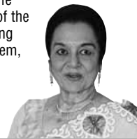
Actor —Asha Parekh

The risk of radicalisation can increase as extremist groups seek to exploit the anger and despair of the young. The world cannot afford a lost generation due to the Covid crisis.