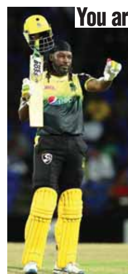
Chris Gayle in action for CPL side Jamaica Tallawahs

The CAB will continue with its online classes with focus being on their top-order batsmen, their biggest letdown in an otherwise eventful season when they reached their first Ranji Trophy final in 13 years.