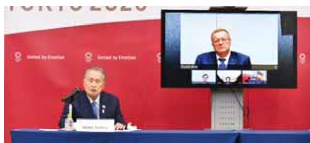
Tokyo 2020 Organizing Committee President Yoshiro Mori speaks in teleconference with John Coates, chairman of IOC's Coordination Commission for Tokyo 2020 Olympics

The pandemic has already forced a year-long delay of the Games, which are now sched-