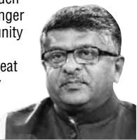
Union Minister —Ravi Shankar Prasad

It's better to have a life than dying because of the virus. To those flouting rule, I want to ask them, has God given you immortality?