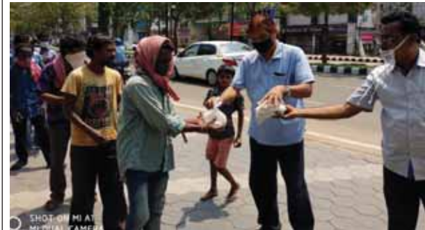
PNS ■ BHUBANESWAR

The Sweetie Housing Complex Welfare Society, Ganganagar, Bhubaneswar has been distributing dry and cooked foods to distressed and daily wagers, who have been severely affected due to Covid-19 threat at different places in the city.