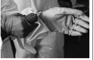
AFP ■ PARIS

Washington: US cases of the novel coronavirus were approaching 1 million on Tuesday, having doubled in 18 days, and made up one-third of all infections in the world, according to a Reuters tally. More than 56,000 Americans have died of the highly contagious respiratory illness COVID-19 caused by the virus, an average of about 2,000 a day this month, according to the tally.