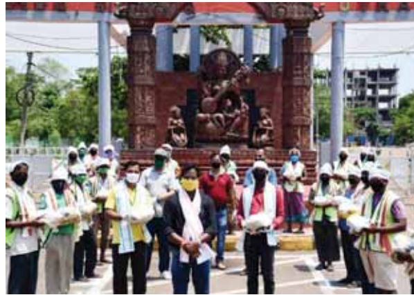
PNS ■ BHUBANESWAR

Members of the Vani Vihar Old Students' Society 92 (Voss 92) honoured cleaning staffs of the Bhubaneswar Municipal Corporation engaged in the Utkal University campus as Corona Yoddha on Monday.