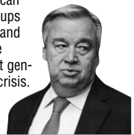
UN Secretary-General —Antonio Guterres

I never even thought of changing the date of the election due to the Coronavirus pandemic. Why would I do that? November 3, it's a good number.