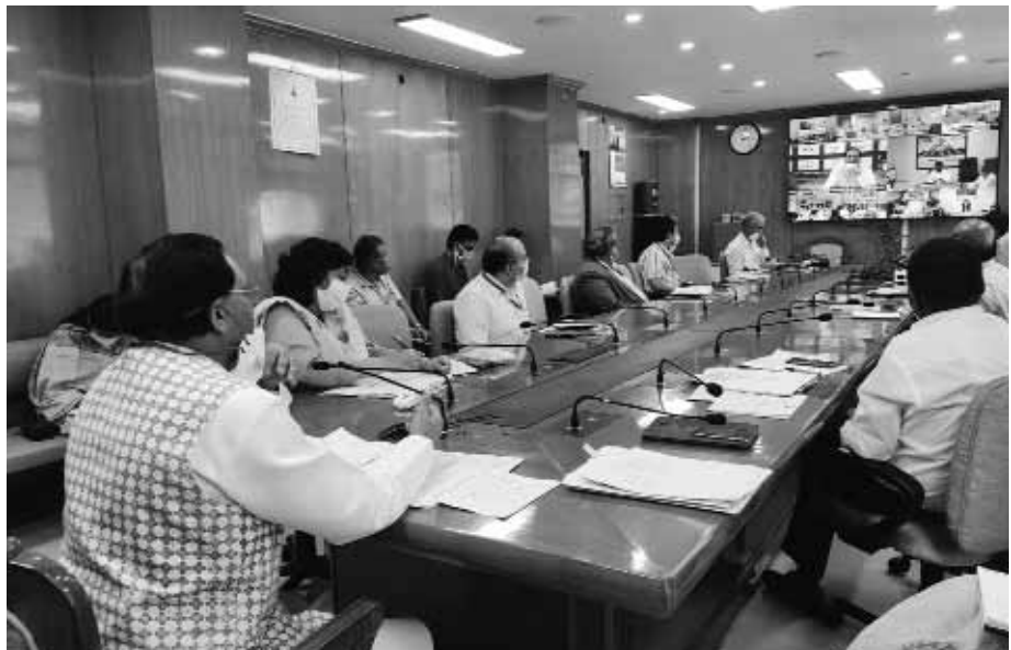
the education boards had done with 80 per cent of their examinations except for Kerala which was hit with the Corona

A senior HRD ministry official said that States will now have to decide on the Minister's appeal regarding the evaluation of board exams. "Since board exams are part of the federal structure, Centre can't be imposing but the States acknowledged the ground situation and will do accordingly. It was brought to the notice of HRD Minister that most of