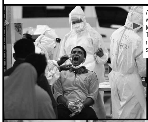
A health worker collects sample for coronavirus from a worker at a locked down wet market as one of its traders tested positive for COVID-19 in Petaling Jaya, Malaysia, on Tuesday. The Malaysian government issued a restricted movement order to the public till April 28, to help curb the spread of the new coronavirus.