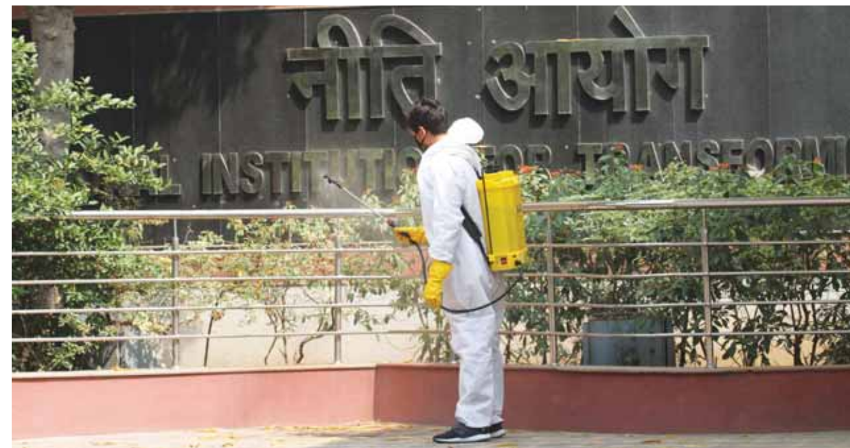
A health worker sanitises the premises of NITI Aayog building after a director-level officer tested positive for Covid-19 in New Delhi on Tuesday

Delhi, Mumbai, Ahd among them; 7 show high cases: Niti Aayog