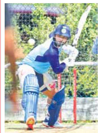
Rishabh Pant bats during nets session

MUMBAI: Ace India cricketer Rohit Sharma on Wednesday roasted Rishabh Pant after he came to