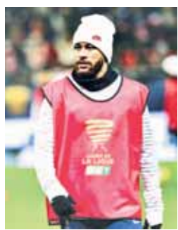
the report as quoted by ESPNFC.

PSG value Neymar at €150m while Barca value Griezmann at €100m, says