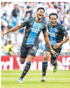
league table as final."

Matches behind closed doors were "theoretically possible", but the league said it preferred not to put more pressure on health services and police in the circumstances. It therefore agreed not to restart the season and "accept the current