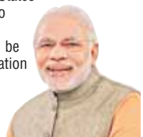
Prime Minister — Narendra Modi

I am not a Bollywood singer. I am just a singer. Bollywood's biggest problem is that there are too many things involved, including business.