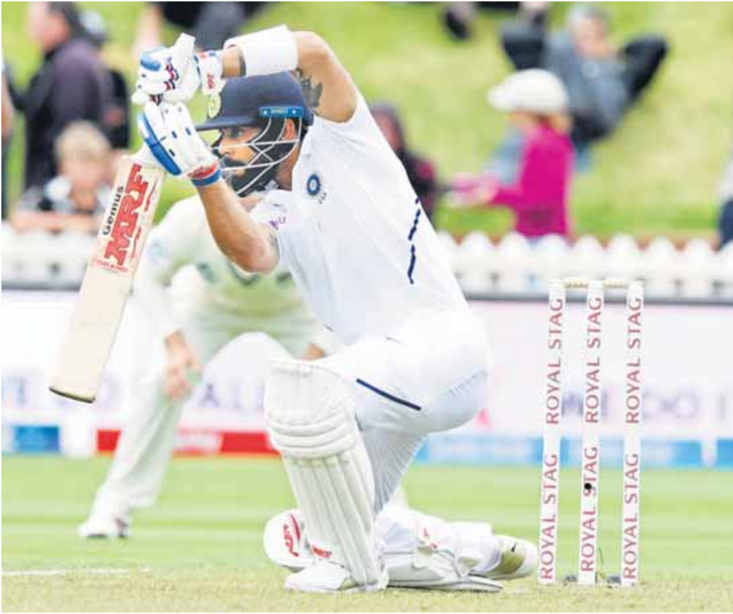
Virat Kohli plays a shot during his innings against New Zealand in the first Test at Wellington

"I was called for a debate and I told them that if Virat Kohli doesn't want four day Tests, it's not hap-