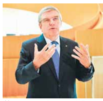
IOC President Thomas Bach

LAUSANNE: International Olympic Committee (IOC) President Thomas Bach has thanked India's Prime Minister Narendra Modi for his unflinching support to the 2020 Tokyo Olympics, which has now been shifted to 2021 because of the global coronavirus pandemic.