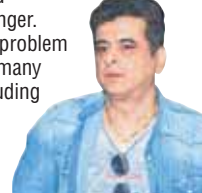
Singer — Palash Sen

Controversy around Beijing's transparency has strained ties, adding to bad feelings triggered by a conspiracy theory in China that the US military was to blame for the virus.