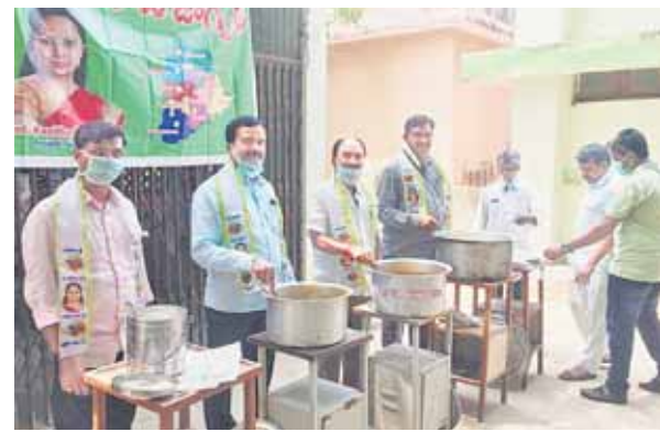
The volunteers of Free Food Centres, set up by former MP K Kavitha

He said that the present season maize produce in the state is likely to yield 14 lakh tonnes and about Rs 3,243 crore were allocated for procurement by the authorities. Minister Errabelli Dayakar rao also spoke at the villages and added that the government was keen on helping the farmers.