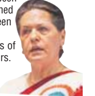
Congress chief — Sonia Gandhi

The lockdown may have been necessary but the unplanned manner in which it has been implemented has caused chaos and pain in the lives of millions of migrant workers.