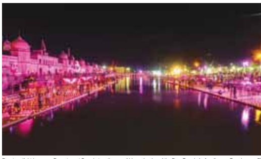
Devotees light lamps on Deepotsav at Ramghat on the eve of bhoomi puja of the Ram Temple in Ayodhya on Tuesday

There is an air of festivity around Ayodhya. Religious songs or the chanting of Sunderkand wafts through the air as one drives through the empty roads of Ayodhya.