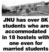
JNU has over 8K students who are accommodated in 18 hostels with one even for married students

The statement further added that the unified and integrated Enterprise Resource Planning system will help in ensuring that all academic and administrative processes can be