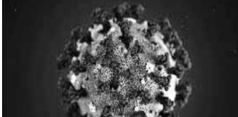
PNS ■ NEW DELHI

The Covid-19 virus seems to be more virulent to males when compared to their female counterparts. Sample this: About 68 per cent of deaths due to virus is reported among male patients and 32 per cent among female patients in India, said the Union Health Ministry while sharing the details of the profile of the Covid-19 patients. Also, 50 per cent of the total Covid-19 deaths reported in India so far are among people aged above 60, said Union Health Secretary Rajesh Bhushan at a press briefing here.