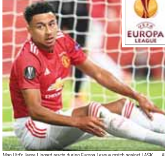
Man Utd's Jesse Lingard reacts during Europa League match against LASK.

The Linz-based outfit had to wait until the second half to break the deadlock as defender Philipp Wiesinger rifled into the top corner from outside the box after 55 minutes.