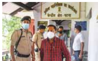
Bihar Police team officials arrive back from Mumbai after meeting with Inspector General and submitting reports in Bollywood actor Sushant Singh Rajput's death investigation in Patna on Thursday