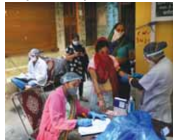
Health workers take blood samples for a random serological test to check for antibodies against the coronavirus in New Delhi on Thursday

After Maharashtra, racing closer to the two lakh mark, the coronavirus tally in Andhra Pradesh reached 1.96 lakh on Thursday as another 10,328 cases were added for the second consecutive day. Worsening further, East Godavari reported another 1,351 cases in the last 24 hours.