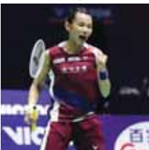
KUALA LUMPUR: World No 2 shuttler Tai Tzu-ying has said she didn't have any problems with Tokyo Olympics getting postponed as according to her, she has now more time to prepare and end her drought at the showpiece event.

Tai Tzu-ying was initially set to be hosted in July this year but due to coronavirus pandemic, it will now take place