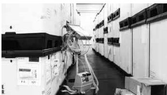
PNS ■ NEW DELHI

Life-saving ventilators for Covid-19 patients are now being embedded with Global Positioning System (GPS) chips to ensure they are not misused or diverted and their movement is tracked on a real-time basis. The Union Health Ministry has created a dashboard for tracking the real-time status of the indigenously-manufactured ventilators being dispatched, delivered and installed for monitoring and feedback, said Union Health Secretary Rajesh Bhushan. "We can track the location of each of these devices as we get to know in real-time if a ventilator is changing location," he said. On the issue of giving nod for export of ventilators, the official said that just about 0.27 per cent of total active Covid-19 cases are on a ventilator across the country. "At any given time, not more than 1 per cent of patients are sick enough to need ventilator support," said Bhushan.