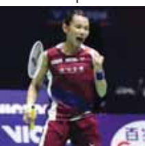
KUALA LUMPUR: World No 2 shuttler Tai Tzu-ying has said she didn't have any problems with Tokyo Olympics getting postponed as according to her, she has more time to prepare and end her drought at the showpiece event.

from July 23 till August 8 in 2021. Despite her constant successes on the BWF circuit, Tai Tzu is yet to win a medal at senior international level which includes Olympics and World Cups. At London 2012 and Rio 2016, she crashed out in the last-16 round itself. "I didn't have a problem with (postponement). I can use this time as a period of rest because it's been a long and tight schedule of high-level competition," Tai Tzu said on the BWF's Badminton Ultimate Feature . "It's a good time to rest and have even more time to prepare (for the Olympics)."