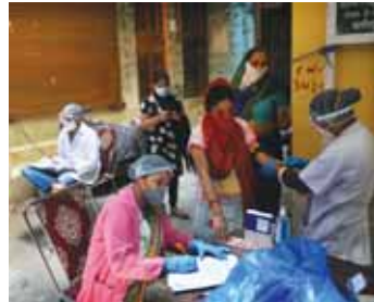
Health workers take blood samples for a random serological test to check for antibodies against the coronavirus in New Delhi on Thursday

After Maharashtra, racing closer to the two lakh mark, the coronavirus tally in Andhra Pradesh reached 1.96 lakh on Thursday as another 10,328 cases were added for the second consecutive day. Worsening further, East Godavari reported another 1,351 cases in the last 24 hours.