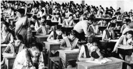
PNS ■ NEW DELHI

Referring to the coronavirus pandemic and floods' havoc in several parts of the country, a group of students on Thursday filed a petition in the Supreme Court on Thursday seeking postponement of JEE (Main) April 2020 and NEET-Undergraduate examinations, which are scheduled to be conducted in September. The plea has sought quashing of July 3 notices issued by the National Testing Agency (NTA), by which it was decided to conduct Joint Entrance Examination (Main) April 2020 and National Eligibility-Cum-Entrance Test (NEET)-Undergraduate exams in September. The plea, filed by 11 stu-