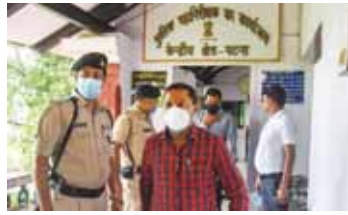
Bihar Police team officials arrive back from Mumbai after meeting with Inspector General and submitting reports in Bhojpur about Sushant Singh Rajput's death investigation in Patna on Thursday

The move comes after the Bihar Government recommended a probe into the matter by the Central agency. "CBI has today registered a case related