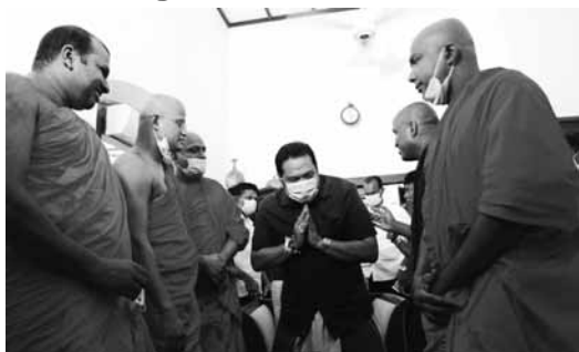
Sri Lankan Prime Minister Mahinda Rajapaksa greets Buddhist monks following his election victory in the general election at his residence in Tangalle Sri Lanka on Friday

Sri Lankans for placing their trust in President Gotabaya Rajapaksa, myself and the Podajana Party and voting for the 'Saubhagya Dakkama' election manifesto in overwhelming numbers. We will ensure Sri Lanka will not stand disappointed during our tenure," he said.