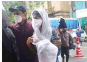
Bollywood actress Rhea Chakraborty arrives at Enforcement Directorate office for questioning in connection with a money laundering case in Mumbai on Friday.