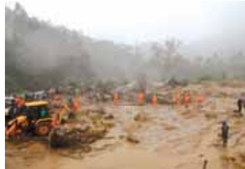
Rescuers work at the site of a mudslide triggered by heavy monsoon rain in Idukki, Kerala on Friday.

Cooking utensils buried in mud, asbestos and tin sheets strewn around were all there to be seen at the area, which was the habitation of around 80 odd workers near a tea plantation, about 30 km from the tourist town of Munnar.