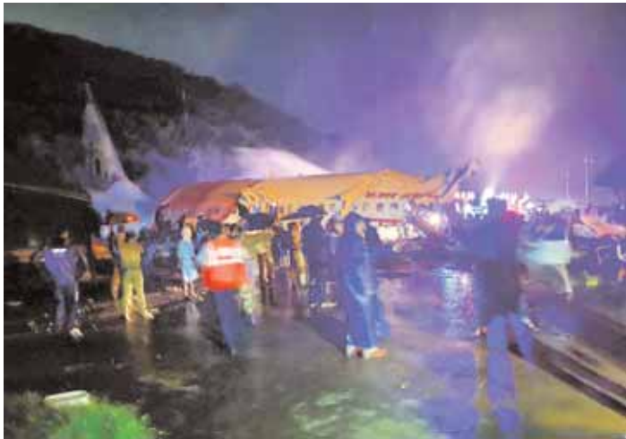
Rescue work in progress as an Air India Express flight with passengers on board en route from Dubai skidded off the runway while landing in Kozhikode on Friday.

"AI Exp flight overshoot Kozhikode runway in rainy conditions, went down 35 ft into slope, split into 2. Formal enquiry will be conducted by Aircraft Accident Investigation