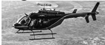
the HAL said.

This was followed by a landing at one of the most treacherous helipads in the region. The LCH successfully demonstrated its quick deployment prowess to forward locations in extreme temperatures,