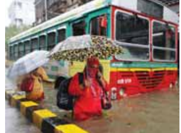
Commuters waded through a waterlogged street during heavy rain in Mumbai on Tuesday.

The India Meteorological Department (IMD) has forecast spells of more heavy to very heavy rainfall in Mumbai and surrounding areas over the