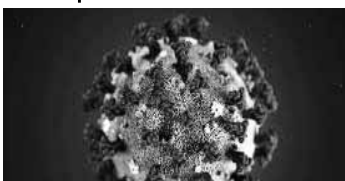
PNS ■ NEW DELHI

The Covid-19 virus seems to be more virulent to males when compared to their female counterparts. Sample this: About 68 per cent of deaths due to virus is reported among male patients and 32 per cent among female patients in India, said the Union Health Ministry while sharing the details of the profile of the Covid-19 patients. Also, 50 per cent of the total Covid-19 deaths reported in India so far are among people aged above 60, said Union Health Secretary Rajesh Bhushan at a press briefing here.