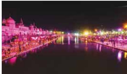
Devotees light lamps on Deepotsav at Ramghat on the eve of bhoomi puja of the Ram Temple in Ayodhya on Tuesday.

There is an air of festivity around Ayodhya. Religious songs or the chanting of Sunderkand wafts through the air as one drives through the