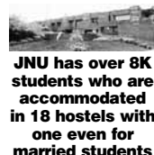
JNU has over 8K students who are accommodated in 18 hostels with one even for married students

The statement further added that the unified and integrated Enterprise Resource Planning system will help in ensuring that all academic and administrative processes can be