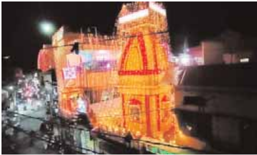
With Dehradun preparing to celebrate Bhoomi Puja at Ram Janmabhoomi on Wednesday, one of the famous temples in the city, the Kalika temple was illuminated on the eve of the occasion

Rawat said, "The Ram temple to be built in Ayodhya is linked to the faith of crores of people. Lord Ram is the symbol of Sanatan culture,