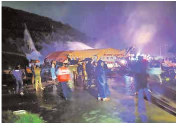
Rescue work in progress as an Air India Express flight with passengers on board en route from Dubai skidded off the runway while landing in Kozhikode on Friday.

"AI Exp flight overshoot Kozhikode runway in rainy conditions, went down 35 ft into slope, split into 2. Formal enquiry will be conducted by Aircraft Accident Investigation