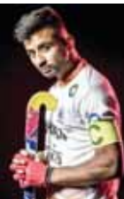
planned with the fit players. "As of now the camp is on and will resume as planned. The fit players can start their individual training and the players who have tested positive for Covid can resume later after recovering but they will have to pass a fitness test," the source said.

The players tested positive after returning to the national hockey camp at the SAI South Centre in Bengaluru following a month-long break.