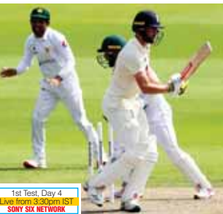
England batsman Chris Woakes, right, is bowled out by Pakistan's Yasir Shah during the third day of the 1st Test at Old Trafford on Friday

stand crept up to 65, every run hard-earned, before Naseem produced a memorable delivery to claim his deserved reward. Pope was hardly to blame, reeling back and fending to gully after the teenager got one to kick viciously off the surface. Barring an early blow to the helmet for new man Chris Woakes, the remainder of the session was better for England as they eased the score out to 159-5.