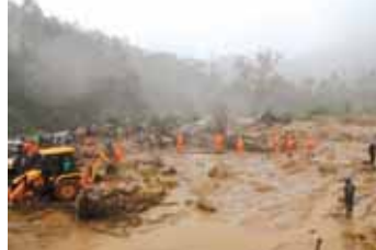
Rescuers work at the site of a mudslide triggered by heavy monsoon rain in Idukki, Kerala on Friday.

Cooking utensils buried in mud, asbestos and tin sheets strewn around were all there to be seen at the area, which was the habitation of around 80 odd workers near a tea plantation, about 30 km from the tourist town of Munnar.