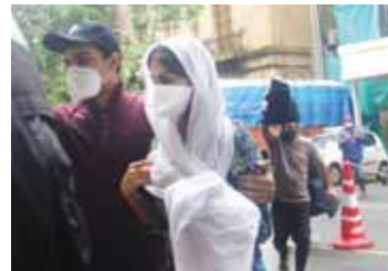
Bollywood actress Rhea Chakrabarty arrives at Enforcement Directorate office for questioning in connection with a money laundering case in Mumbai on Friday.