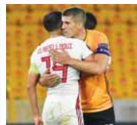
Wolverhampton Wanderers' Conor Coady embraces Olympiakos' Omar Elabdellauoui after the Europa League match

about the impact of the pandemic. "Moving the event by 12 months gives all competing teams the chance to play a sufficient level of cricket... So the integrity of the tournament is maintained."