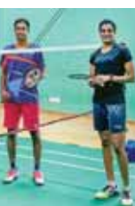
PV Sindhu poses for photograph after resuming practice at Pulla Gopichand Badminton Academy in Hyderabad on Friday

"I am very happy to have our elite shuttlers back for on-field training after this long break. We are fully equipped to resume training in a safe environment," Chief national coach