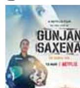
cially against women in the IAF.

It also said in the aim to glorify the screen character of 'Ex-Flt Lt Gunjan Saxena, M/s Dharma Productions presented some situations that are misleading and portray an inappropriate work culture espe-