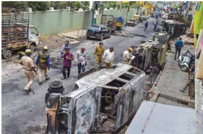
Police and residents walk past charred remains of vehicles vandalised by a mob over a FB post by a relative of a Congress MLA in Bengaluru on Wednesday