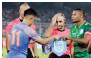
Indian captain Sunil Chhetri with his Bangladeshi counterpart