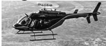
the HAL said.

This was followed by a landing at one of the most treacherous helipads in the region. The LCH successfully demonstrated its quick deployment prowess to forward locations in extreme temperatures,