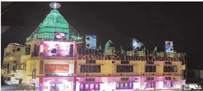
The Shyam Sundar temple decorated with illuminations on the occasion of Janmashtami in Dehradun on Wednesday

The maximum and minimum temperatures recorded at various places on Wednesday were 29.4 degrees Celsius and 24.9 degrees Celsius respectively in Dehradun, 32 degrees Celsius and 25.6 degrees Celsius in Pantnagar, 21.4 degrees Celsius and 15.9 degrees Celsius in Mukteshwar and 24.6 degrees Celsius and 18.6 degrees Celsius respectively in New Tehri.