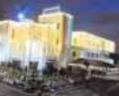
The Vidhan Sabha building in Dehradun illuminated on the eve of Independence Day.

Now the work plan for development facilities necessary for a capital is being prepared. He said that in recent times, there has been a rise in Covid cases in the State but