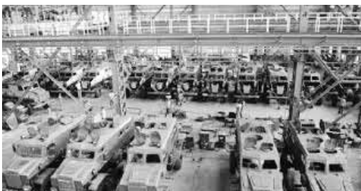
PNS ■ NEW DELHI

Days after banning import of 101 weapon systems to make the Indian defence industry self-reliant, the Government on Friday signed four contracts as part of Defence India Start Up challenge in the presence of Defence Minister Rajnath Singh. On the final day of 'Atmanirbhar Week' celebration of the Defence Ministry, he also launched Department of Defence Production (DDP) portal SRIJAN which is a 'one stop shop online portal that provides access to the vendors to take up items that can be taken up for indigenisation. A number of Expressions of inter-