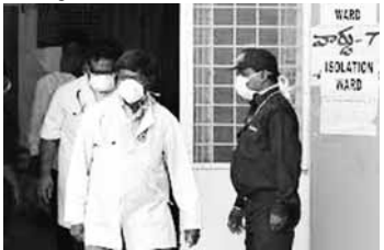
PNS ■ NEW DELHI

Says nation is 'indebted to doctors, nurses and other health workers'