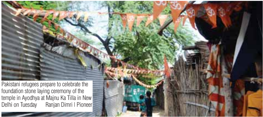
Pakistani refugees prepare to celebrate the foundation stone laying ceremony of the temple in Ayodhya at Majnu Ka Tilla in New Delhi on Tuesday

In order to get maximum seats in the municipal election, the party has started strengthening the structure at the booth level. The AAP lost the municipal elections in 2017 to the BJP. The AAP won 62 seats in the 70-member Delhi Assembly under the leadership of Arvind Kejriwal while the BJP got just eight seats.