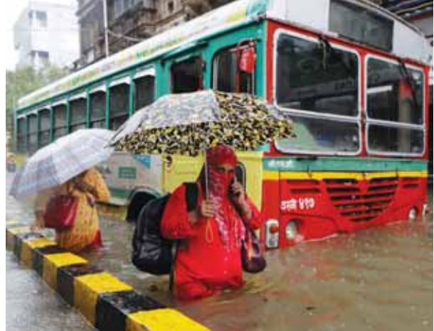
Commuters waded through a waterlogged street during heavy rain in Mumbai on Tuesday

The India Meteorological Department (IMD) has forecast spells of more heavy to very heavy rainfall in Mumbai and surrounding areas over the next