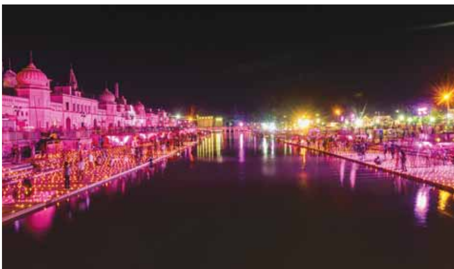
Devotees light lamps on Deepotsav at Ramghat on the eve of bhoomi puja of the Ram Temple in Ayodhya on Tuesday