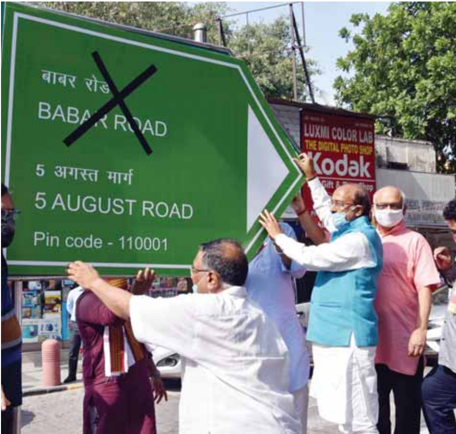
Former Union Minister and senior BJP leader Vijay Goel on Tuesday demanded renaming of Babar Road in Bengali Market as the 5 August Marg

The extended time period granted for the filing of GST return for Q1 2020-21 got over in July 2020. The Delhi Government is also identifying the taxpayers evading tax. The department has been able to recover Rs. 10 crore from two such defaulting companies in the last one week. The department is also analysing the tax payment profile of such taxpayers along with their overall tax profile in the previous quarters, it said.