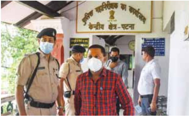
Bihar Police team officials arrive back from Mumbai after meeting with Inspector General and submitting reports in Bollywood actor Sushant Singh Rajput's death investigation in Patna on Thursday

The move comes after the Bihar Government recommended a probe into the matter by the Central agency. "CBI has today registered a case relat-