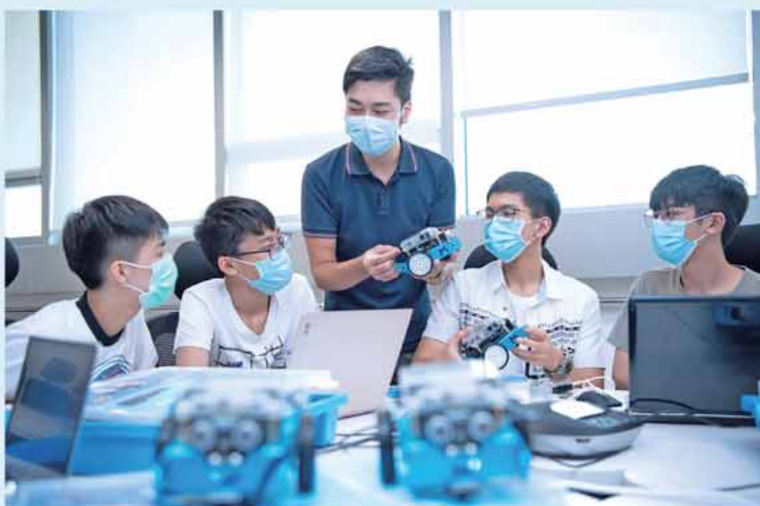
A growing number of young people in Macao have set up their businesses in parallel with the development of the Guangdong-Hong Kong-Macao Greater Bay Area. Riding the wave of innovation and entrepreneurship across China, they are seizing opportunities in the Greater Bay Area to achieve their dreams. The photo shows that students were given training courses at the Macao Young Entrepreneur Incubation Center on July 14