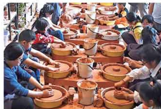
Tourists DIY purple pottery in Jianshui (Online photo)

As a culturally-diversified province lying in southwest China, Yunnan has long been famous for the arts and handicrafts created by local ethnic groups. Black and purple potteries, paper cuttings as well as wooden objects are among the most popular souvenirs for people who come to visit Yunnan. Almost every tourist would purchase a few handicrafts before leaving and bring them back home.