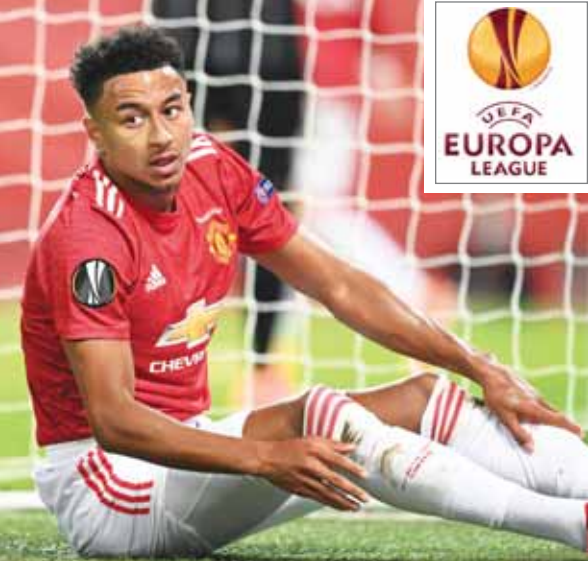
Man Utd's Jesse Lingard reacts during Europa League match against LASK

The Linz-based outfit had to wait until the second half to break the deadlock as defender Philipp Wiesinger rifled into the top corner from outside the box after 55 minutes.