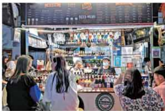
A snack stand at Nanqiang street, Kunming