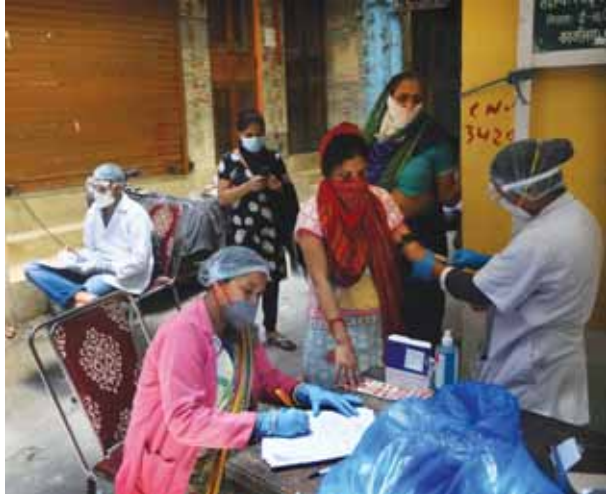
Health workers take blood samples for a random serological test to check for antibodies against the coronavirus in New Delhi on Thursday