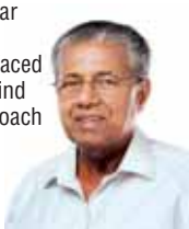
Kerala Chief Minister —Pinarayi Vijayan

If the Congress had a clear stand on secularism, the country would not have faced the present fate. I don’t find anything new in the approach of Rahul or Priyanka.