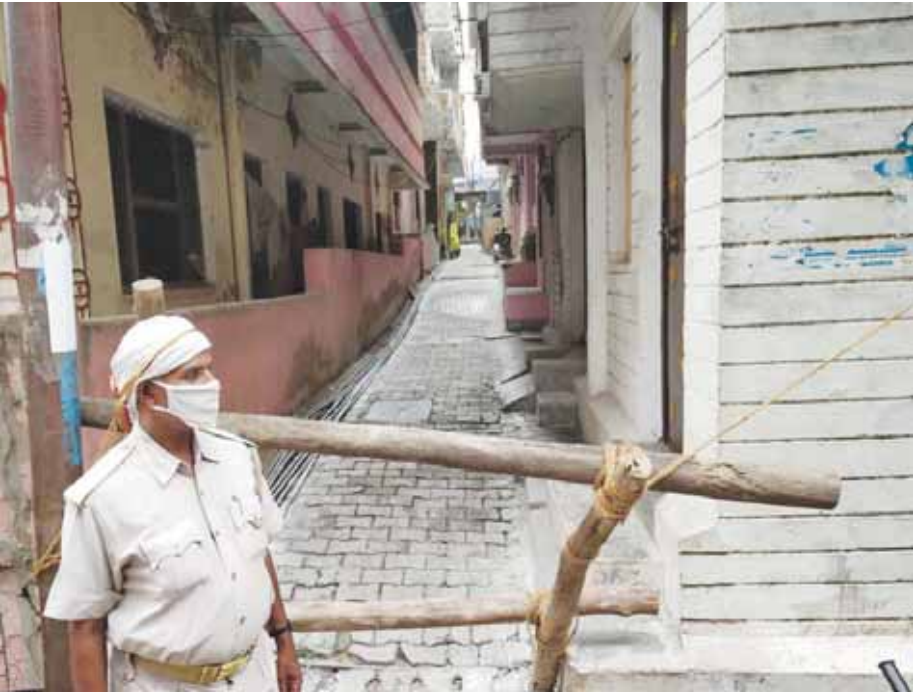
Security at hotspot Machaudhari (Adampur) in Varanasi on Thursday