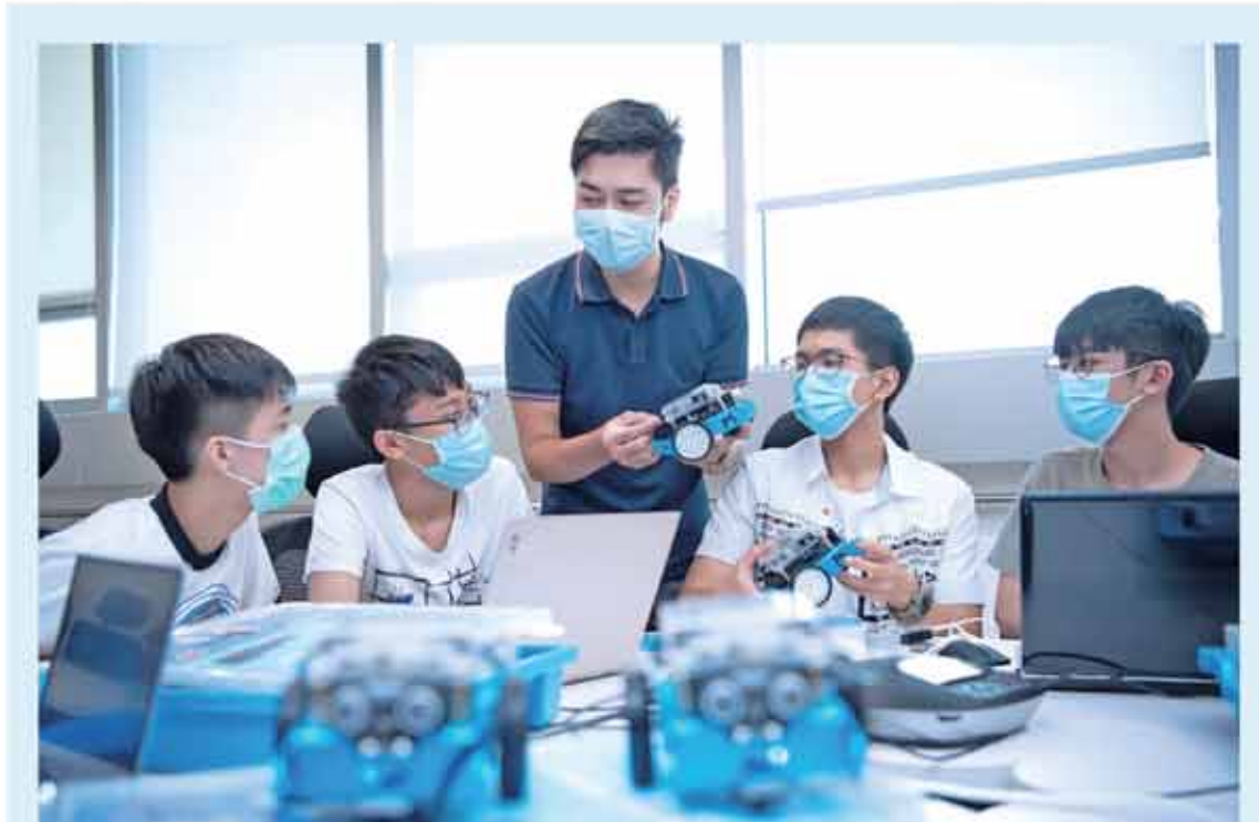
A growing number of young people in Macao have set up their businesses in parallel with the development of the Guangdong-Hong Kong-Macao Greater Bay Area. Riding the wave of innovation and entrepreneurship across China, they are seizing opportunities in the Greater Bay Area to achieve their dreams. The photo shows that students were given training courses at the Macao Young Entrepreneur Incubation Center on July 14

99.9 percent of Hong Kong people will not be affected by the National Security Law, since it targets only separatist activities, subversion of State power, terrorism and foreign/external interference.