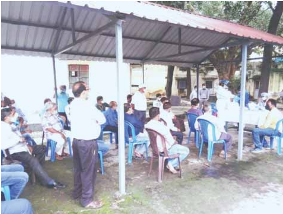
COVID-19 test being carried out at Ordnance Parachute Factory on Thursday.

He said in addition, to reduce the spread of COVID-19 one should wear masks, avoid touching face with unwashed hands and frequently washing hands with soap and water for at least 20