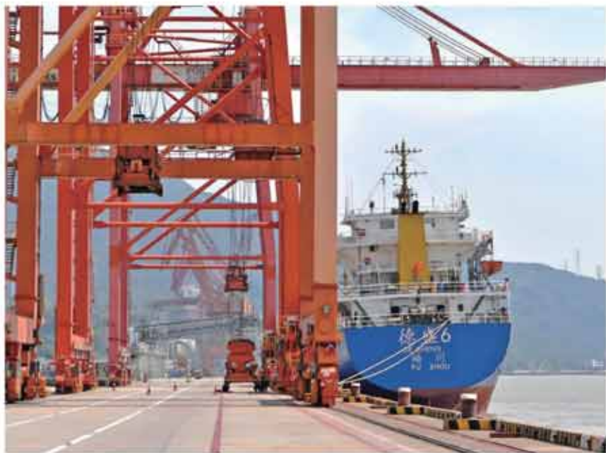
China's foreign trade has gradually recovered from the impact of the COVID-19 pandemic. According to data released by the General Administration of Customs, the country's foreign trade rose 5.1 percent on a yearly basis in June, with exports up 4.3 percent and imports growing 6.2 percent. Here in Qingzhou Port, Fuzhou, capital of east China's Fujian Province, a freighter loaded with containers sets on sail on July 21

Chinese economy has shifted from slowing down to rising, strong evidence that the adverse impact of the epidemic can be overcome with resolve,