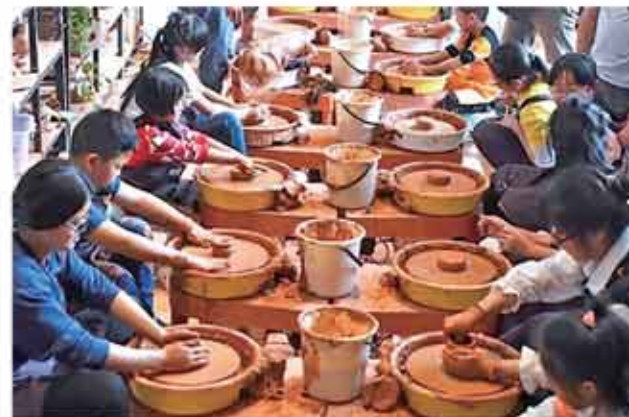
Tourists DIY purple pottery in Jianshui (Online photo)

As a culturally-diversified province lying in southwest China, Yunnan has long been famous for the arts and handicrafts created by local ethnic groups. Black and purple potteries, paper cuttings as well as wooden objects are among the most popular souvenirs for people who come to visit Yunnan. Almost every tourist would purchase a few handicrafts before leaving and bring them back home.