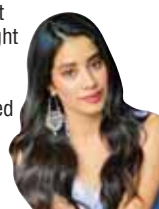
Actor —Janhvi Kapoor

I’ve skipped many steps that many people have had to fight for. I’ve gotten chances that many people wouldn’t have gotten easily. I’ve fast-tracked into this system already