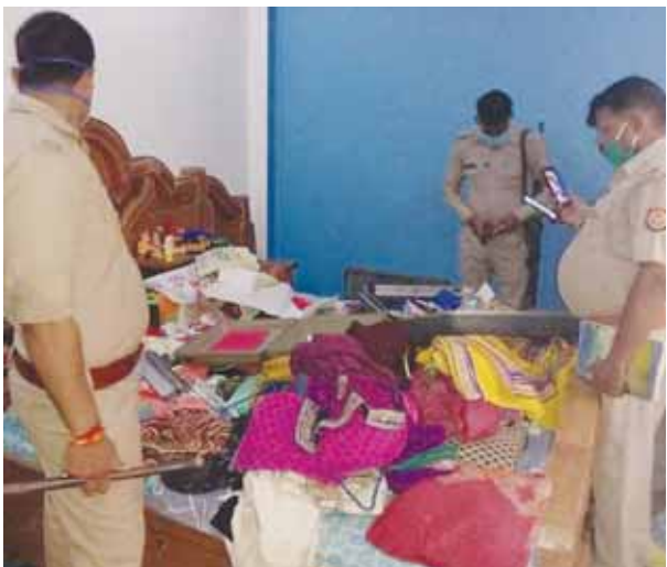
Police carry out investigations in SAF employee's house burgled on Wednesday night.