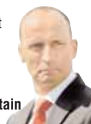
Former England captain —Nasser Hussain

If this lad was Virat Kohli, everyone would be talking about him but because he is Babar Azam, no one is talking about him.