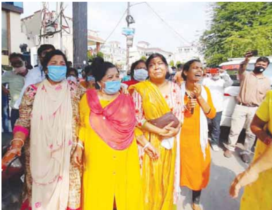
Kin of deceased inconsolable after bodies were recovered from a hotel room