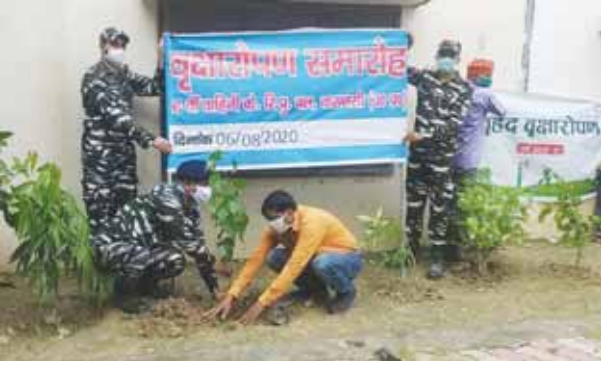
CRPF personnel planting saplings at Shivaji Colony Park in Varanasi on Thursday

Besides, the entire area was also de-infected by spraying sodium hypochlorite chem-