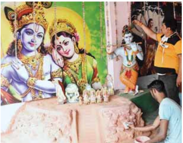
An artisan making preparations for Janmashtami at Reserve Police Lines on Thursday