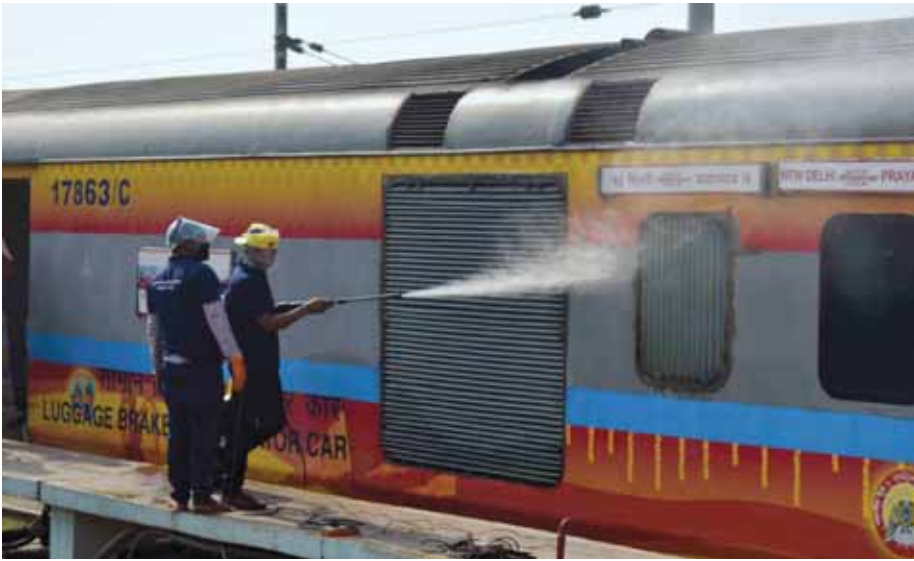
Railway employees sanitising train coaches at Prayagraj Jn