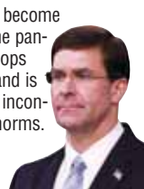
US Defense Secretary —Mark Esper

The world has seen China become more aggressive during the pandemic. It has deployed troops along the LAC with India and is acting out in a way that is inconsistent with international norms.