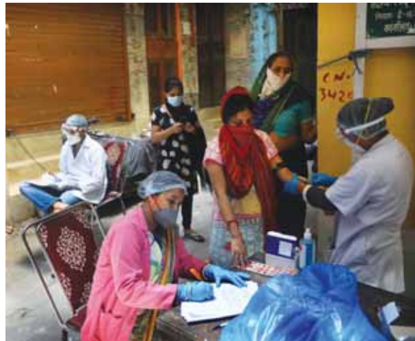
Health workers take blood samples for a random serological test to check for antibodies against the coronavirus in New Delhi on Thursday