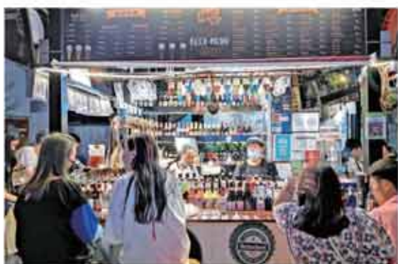
A snack stand at Nanqiang street, Kunming