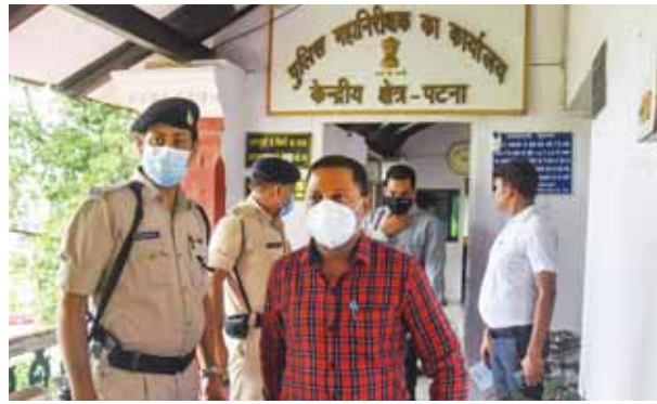
Bihar Police team officials arrive back from Mumbai after meeting with Inspector General and submitting reports in Bollywood actor Sushant Singh Rajput's death investigation in Patna on Thursday

The move comes after the Bihar Government recommended a probe into the matter by the Central agency. "CBI has today registered a case relat-