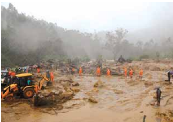
Rescuers work at the site of a mudslide triggered by heavy monsoon rain in Idukki, Kerala on Friday