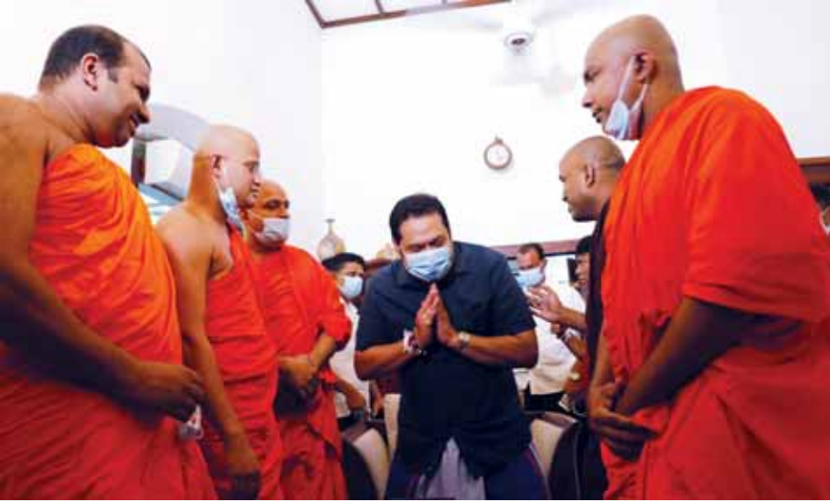
Sri Lankan Prime Minister Mahinda Rajapaksa greets Buddhist monks following his election victory in the general election at his residence in Tangalle Sri Lanka on Friday

The 74-year-old Prime Minister Mahinda thanked the Sri Lankan people for putting their faith in the SLPP and said that the country will not stand disappointed during its tenure. "Heartfelt gratitude to all