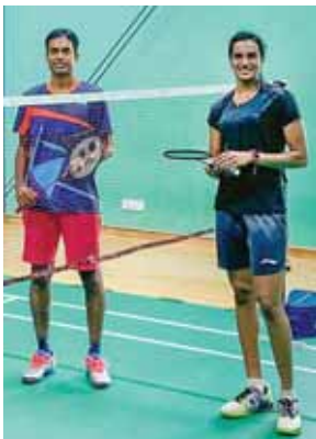
PV Sindhu poses for photograph after resuming practice at Pullela Gopichand Academy in Hyderabad on Friday

World champion PV Sindhu, along with B Sai Praneeth and N Sikki Reddy, hit the courts for training on Friday under strict safety protocols at the SAI Pullela Gopichand Badminton Academy in Hyderabad, ending a four-month-long coronavirus-forced hiatus. This was after the Sports Authority of India (SAI) decided to resume the national badminton camp for the eight Olympic hopefuls following Telangana Government's approval on August 1. "I am very happy to have our elite shuttlers back for on-field training after this long break. We are fully equipped to resume training in a safe environment," Chief national coach