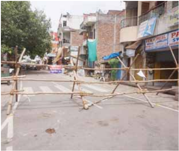
Sealed hotspot in Sonia road (Sigra) in Varanasi on Friday

Besides, the district had also seen two more deaths increasing the toll to 77. During the day, the follow-up reports included 119 patients recovered from home isolation and the total number of patients cured at home has increased to 841 while just 18 recovered from the hospitals. With this, the total number of patients discharged from the hospitals has reached 1,364 while the total number of cured patients is 2,205, leaving 1,783 active patients. However, the only relief is that with the cure of a good number of patients at