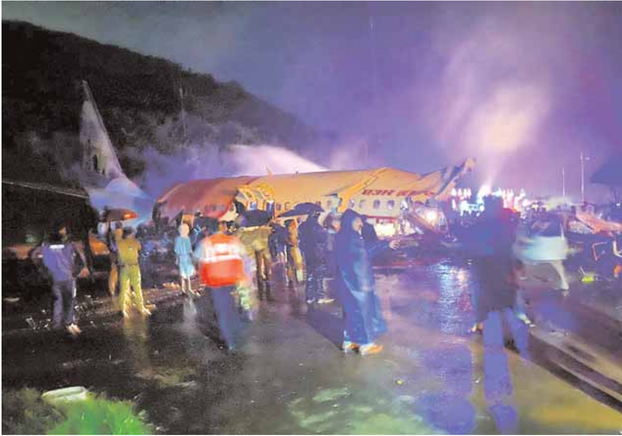
Rescue work in progress as an Air India Express flight with passengers on board en route from Dubai skidded off the runway while landing in Kozhikode on Friday

“AI Exp flight overshot Kozhikode runway in rainy conditions, went down 35 ft into slope, split into 2... Formal enquiry will be conducted by Aircraft Accident Investigation