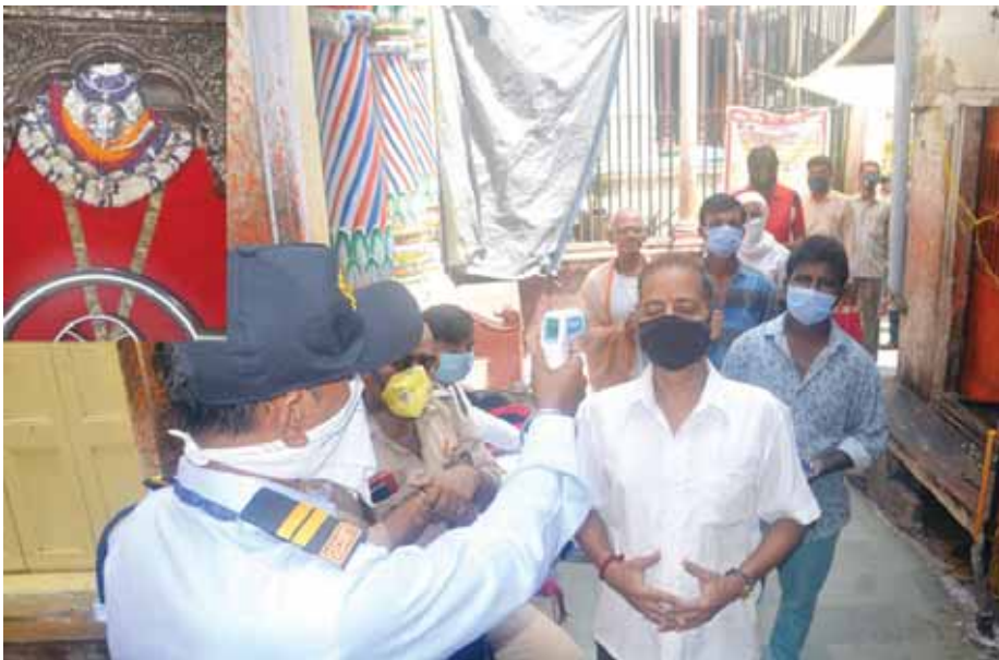
Kal Bhairav temple reopens after 141 days in Varanasi on Friday

There was pressure on Kal Bhairav temple management because as per tradition many