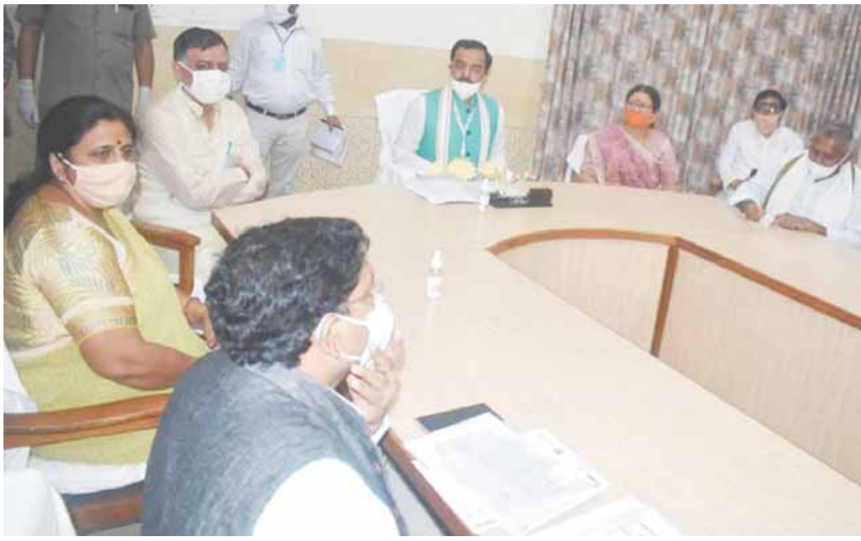
Deputy Chief Minister, Keshav Prasad Maurya addressing a meeting at Circuit House on Monday