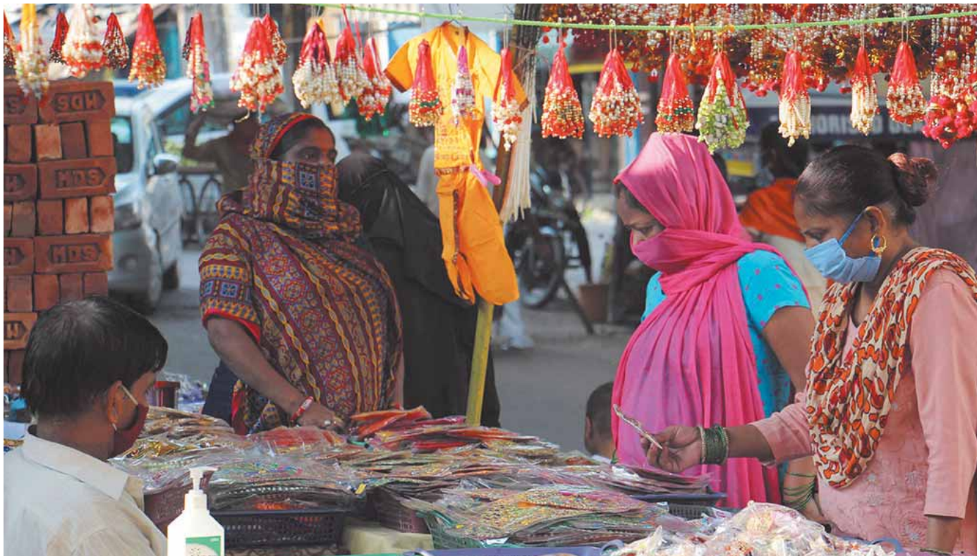
Women making purchases for Janmashtami at Sadar Bazaar on Monday