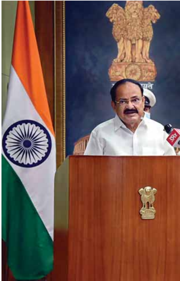
Vice President M Venkaiah Naidu speaks after virtually laying the foundation stone for a housing complex for Rajya Sabha employees in New Delhi on Monday