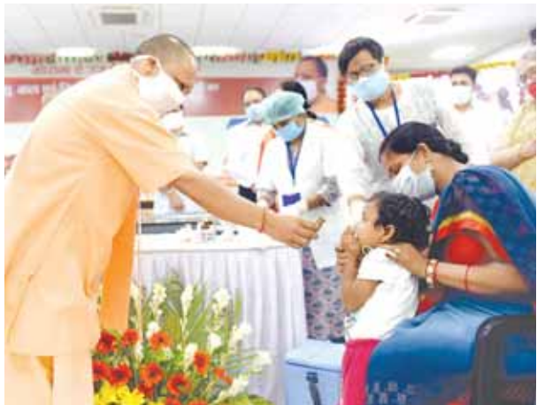
Chief Minister Yogi Adityanath administering vitamin A dose to a child while kicking off the National Worm Eradication Campaign in Lucknow on Monday.

He said that eight COVID-19 deaths in Lucknow included one in Mayo hospital, two each in Vidya and Integral hospitals,