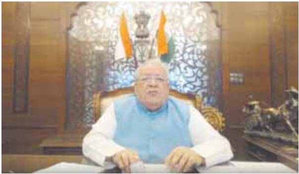
Rajasthan Governor Kalraj Mishra addressing a webinar of BHU in Varanasi on Monday

Complimenting the mission team, Mishra suggested creating an even bigger network of institutions, students and alumni to combat against any emergent situation such as flood, earthquake etc. in addition to COVID-19. He said that he is happy to note the efforts put in by the mission in collaboration of various organisations such as Roti Bank, Sanjivani Welfare Society, MECHI Foundation, Kashi Katha etc. He also hailed the efforts of Malviya Centre for Innovation,