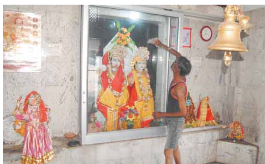
Janmashtami preparations at Alambagh police station on Monday