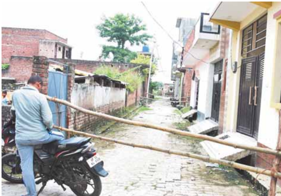
A bylane in Harinagar area of Balaganj sealed after detection of coronavirus positive case