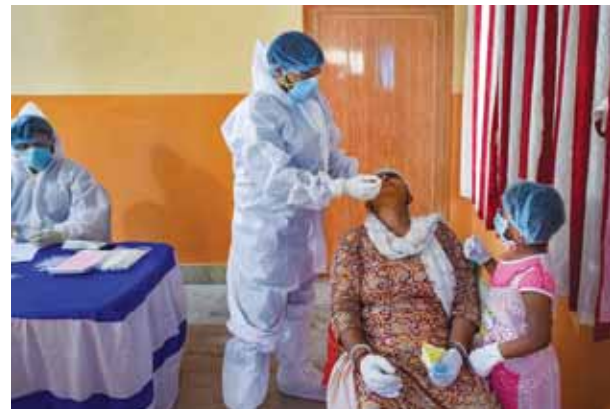
A medic wearing a PPE collects samples from a woman for Covid-19 rapid antigen testing in Kolkata on Monday