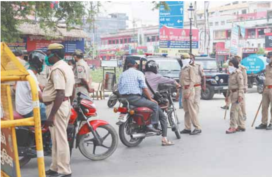
Pollicemen stop a motorcyclist for driving two people on a bike in Prayagraj. It may be said here that only one person is allowed on a two-wheeler.