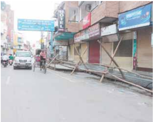
Hotspot in Sonarpura (Bhelupura) area in Varanasi on Monday