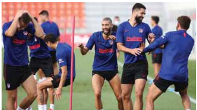
Atletico Madrid players train during team's training session.

“The bowling was also excellent. It’s a young seam attack, apart from Mohammad Abbas, and both Shaheen Afridi and Naseem Shah did really well.”