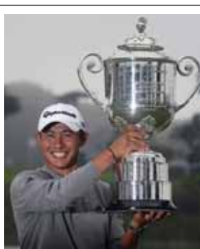
Collin Morikawa holds the Wanamaker Trophy after winning the PGA Championship golf tournament at TPC Harding Park on Sunday.

“Athletics is the main beneficiary because people are doing exercise through running or walking. That is a very big asset. We will not take it for granted but will try to build on it in the post pandemic peri-